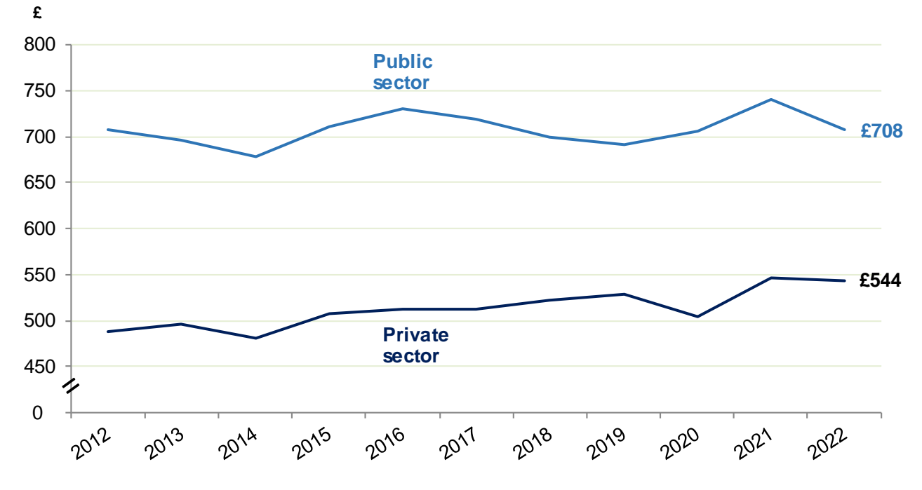
Note: there was a methodological change during the series in 2021.