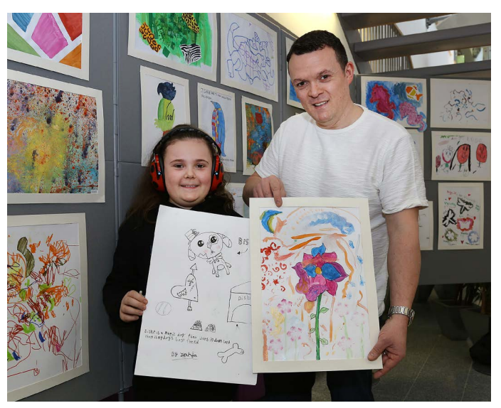
Proud artist at the Exhibition Launch