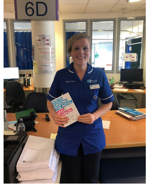
Books arrive at Ward 6D