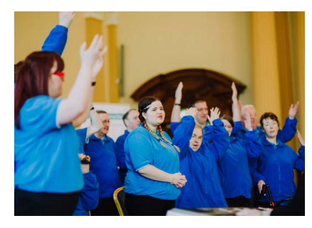
Equal Notes Choir