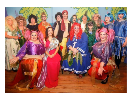
Arts Care Musgrave Park, Sinbad Panto Cast 2019