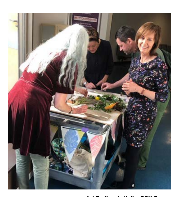
Art Trolley Activity, BCH Foyer