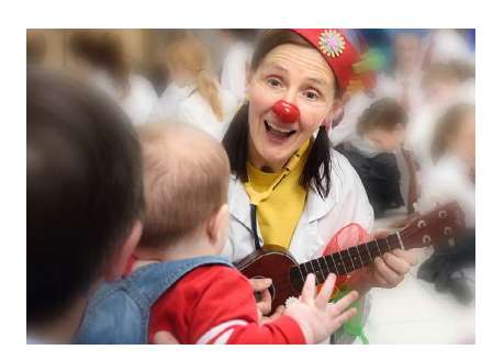
Arts Care Clowndoctor at the Children's Hospital

Arts Care NI run additional regional programmes which involve Belfast Trust – Clown Doctors and Cartwheel for Children and Young People, Twilight Project for Looked After Children and Here and Now Older Peoples Festival For further information see www.artscare.co.uk