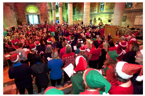
Singing with Santa Event Dec 2019