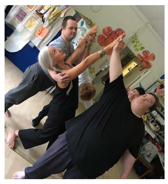
Arts Care Orbit Dance prepare for the Spring Festival

'My husband has been telling me all about what's been going on each day, it's given him a real lift and a sense of normality.' Family reflection