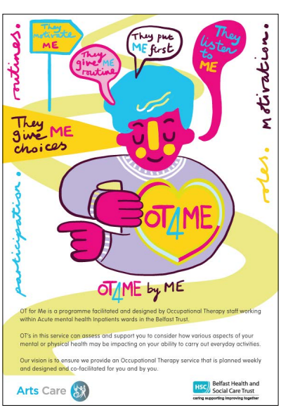
OT4Me Original Artwork created by Staff and Patients