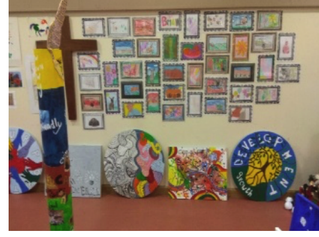
"You've Been Framed" (our interpretation)