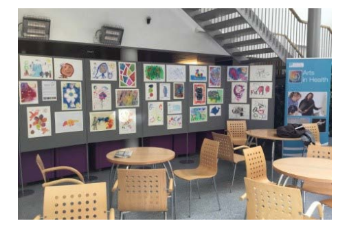
Exhibition at the Arches WTC

'What a fabulous launch event.... I could feel the excitement building in me as I walked down the stairs and the music wound its way up to me. It was great to show off the great artistic talent of so many children with ASD in the midst of Autism Awareness month.'