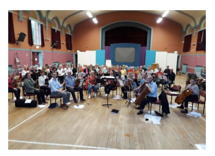
Staff Orchestra and Choir in Rehearsal May 2019