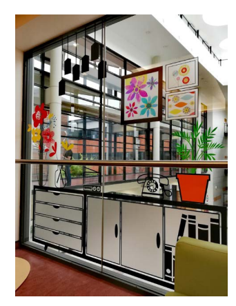
View from the Snug to the Atrium