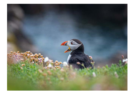
The Calling by Steven Pratt, BPIC