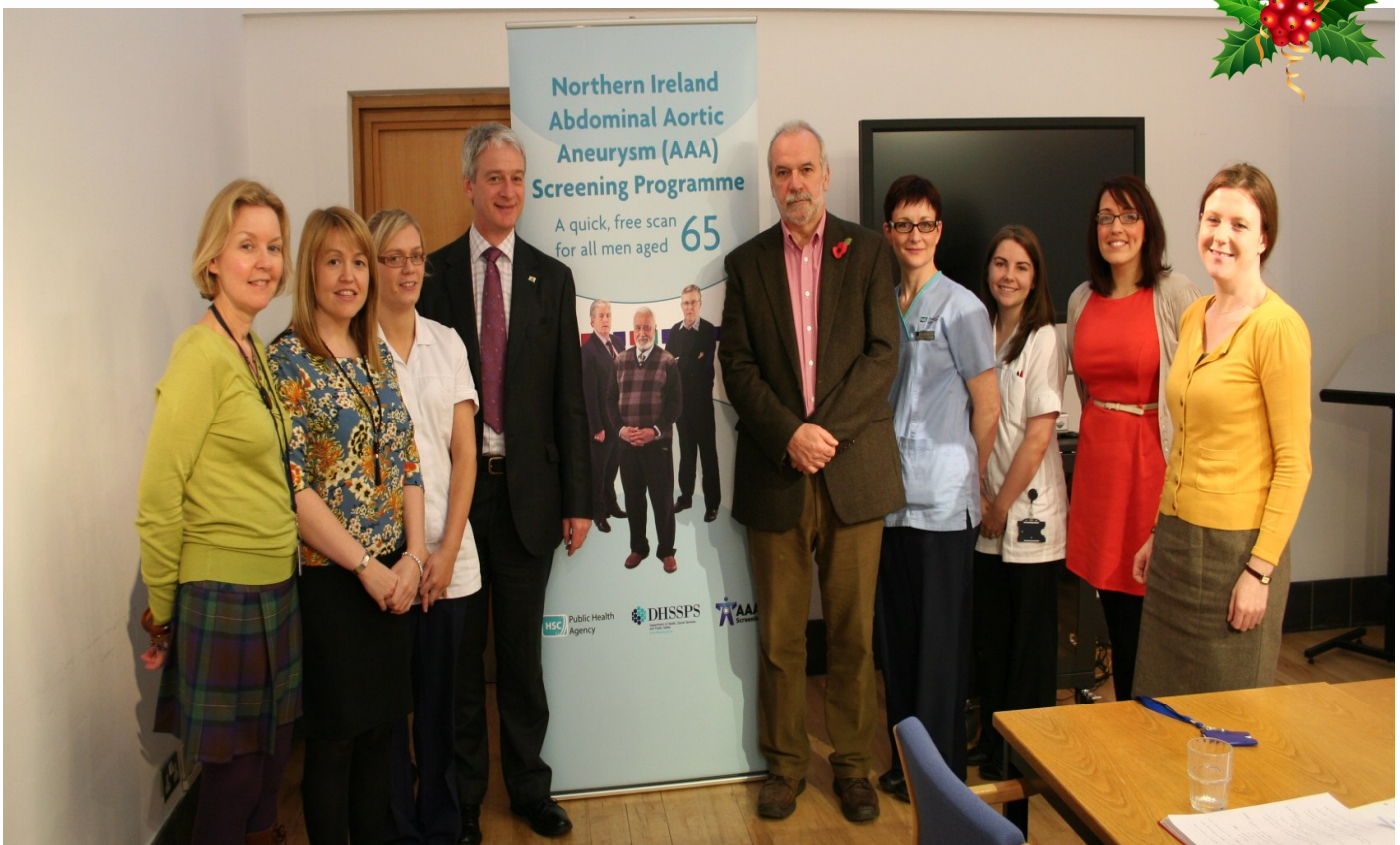
'The AAA Team'