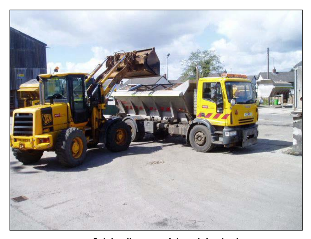
Salt loading one of the gritting lorries

During the winter of 2018-19 there were 47 occasions when salt was applied to the 326km of roads on the gritting schedule using 1,924 tonnes of salt, in the previous year there were 131 salting actions using 5,379 tonnes of salt.