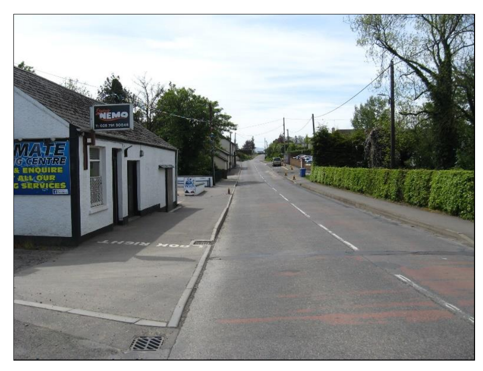
Footway provision - Mayogall Road, Gulladuff