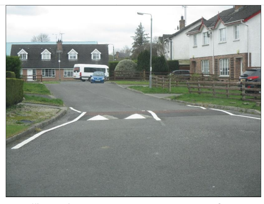
Traffic calming measures on U7102 Ferndale, Clogher