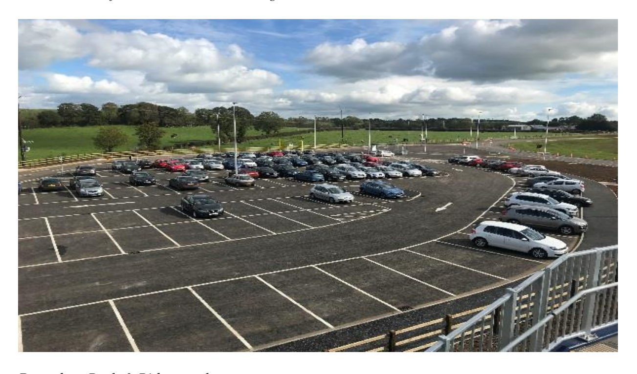
Drumderg Park & Ride complete