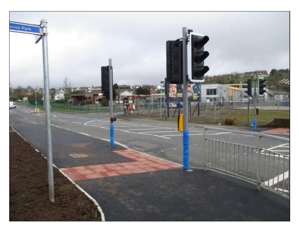
Toucan crossing and footway widening on A45 Oaks Road, Dungannon