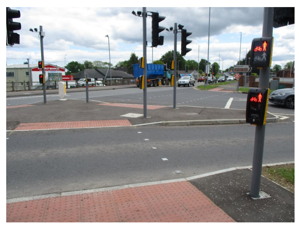
Traffic signal upgrade with Toucan crossing points on A29 Moy Road, Moygashel