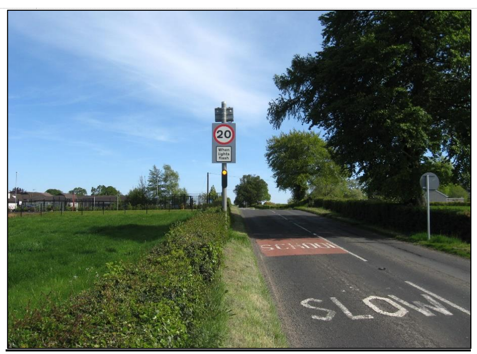
Woods PS trial part time 20mph