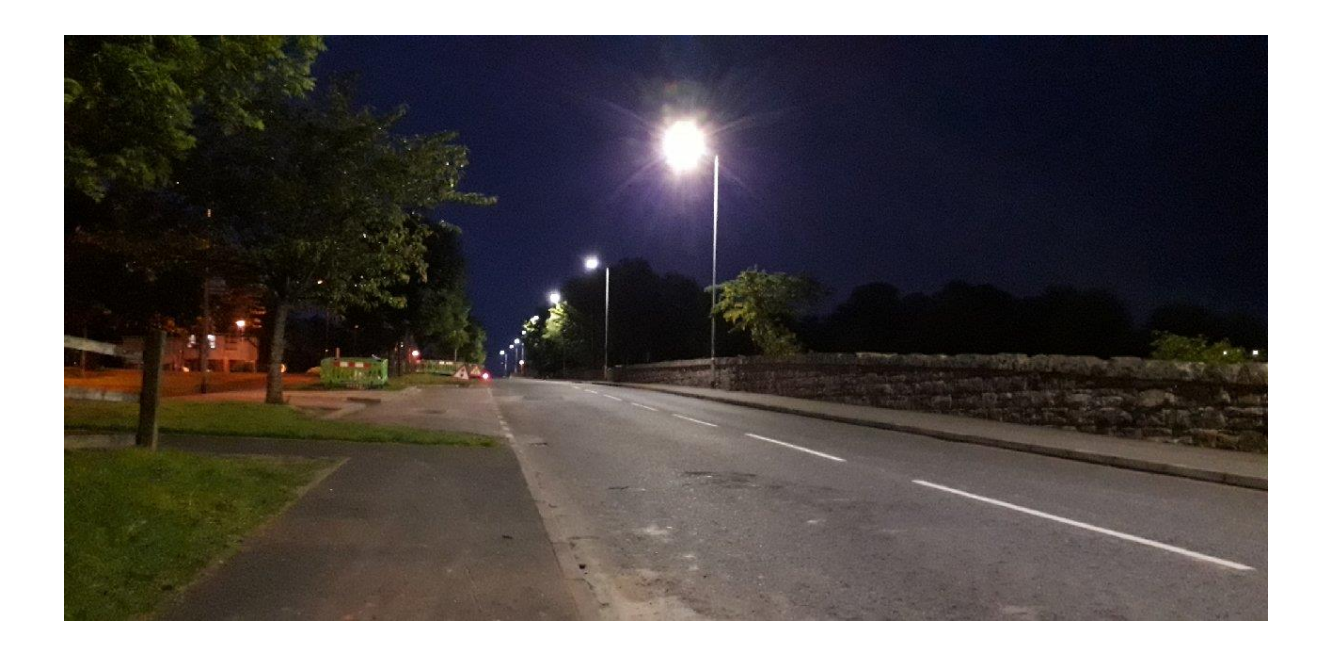
Cemetery Road, Cookstown

Additional funding near year end enabled us to commence completion of Fivmiletown renewal scheme.