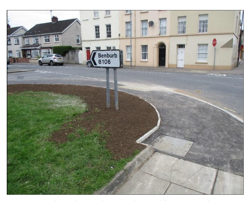
Footway extension with tactile crossing facility at The Diamond, Moy