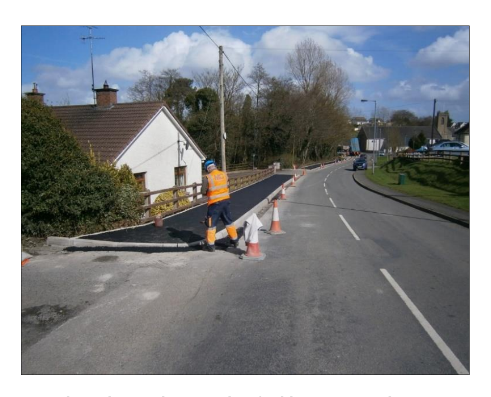
Footway extension with tactile crossing facility on Annaginny Road, Newmills