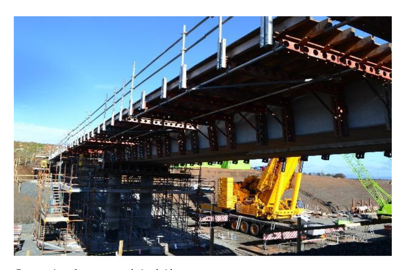
Construction of an accommodation bridge

The scheme represents an investment of £185m, and it remains on programme for the Randalstown to Toome section to open in mid-2019 and the Toome to Castledawson section in 2021.