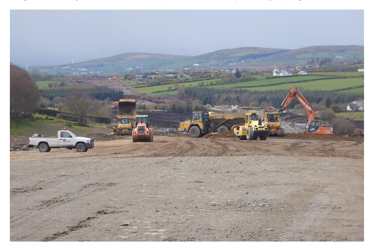
Construction works at Foreglen

With longer working days throughout the summer period, it is anticipated over the next few months the earthworks operations will continue and the construction of further mainline structures will get underway. Construction is expected to be completed by spring 2022.