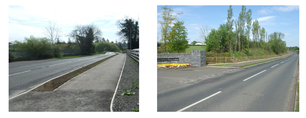
Fenaghy Road - Completed Scheme

This scheme has provided a new footway from near Cullybackey to Galgorm Manor Resort and Spa. The majority of the footway has been accommodated within the existing verge. However, some land has been acquired to complete the scheme.