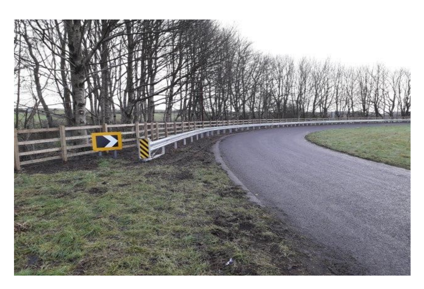
Completed Scheme at Old Ballymoney Road

Maintenance of Structures work completed at a total cost of £12,688