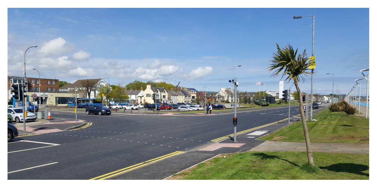
Completed upgrade the traffic signals at Marine Highway/Joymount junction

There is also pedestrian detection at the kerb side to allow the Puffin to cancel the crossing demand should the button be pushed and the pedestrians move away. This allows for a more efficient operation of the signals for both pedestrian and vehicles.