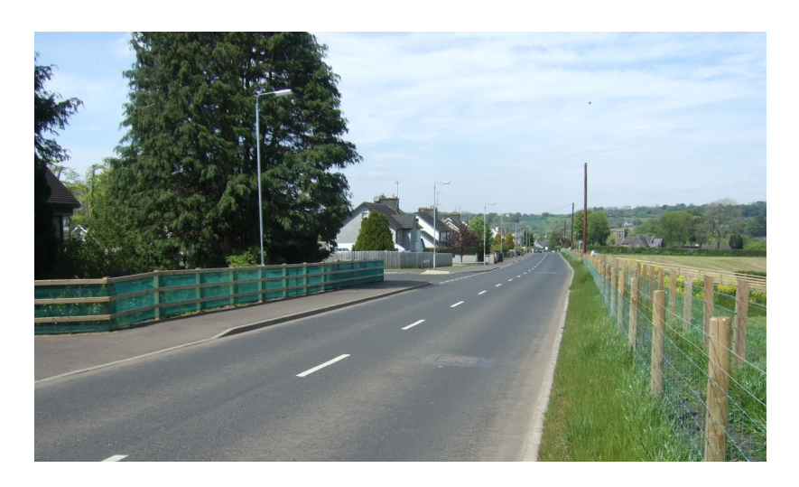
Rathkeel Road - Completed Scheme

The scheme provides a footway from Buckna Road for approximately 450m to the south east towards the 30mph limit. The works also incorporated improvements for traffic emerging from Buckna Road onto Rathkeel Road, as well as street lighting improvements. Land was acquired opposite the houses to provide space along the front of residential properties to facilitate construction of the new footway. The scheme was completed early in 2019. This stretch of the Rathkeel Road was also resurfaced to complement the delivery of the footway scheme.