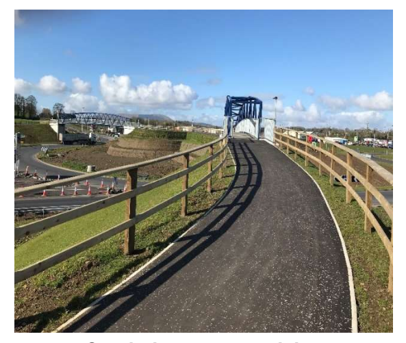
Castledawson roundabout pedestrian/cycleway overbridges

Construction works on the stretch between Brough Road, Hillhead Road and Deerpark Road is well advanced including a short section at the Toome tie-in. The last structure, Hillhead Road overbridge, was completed in January 2020.