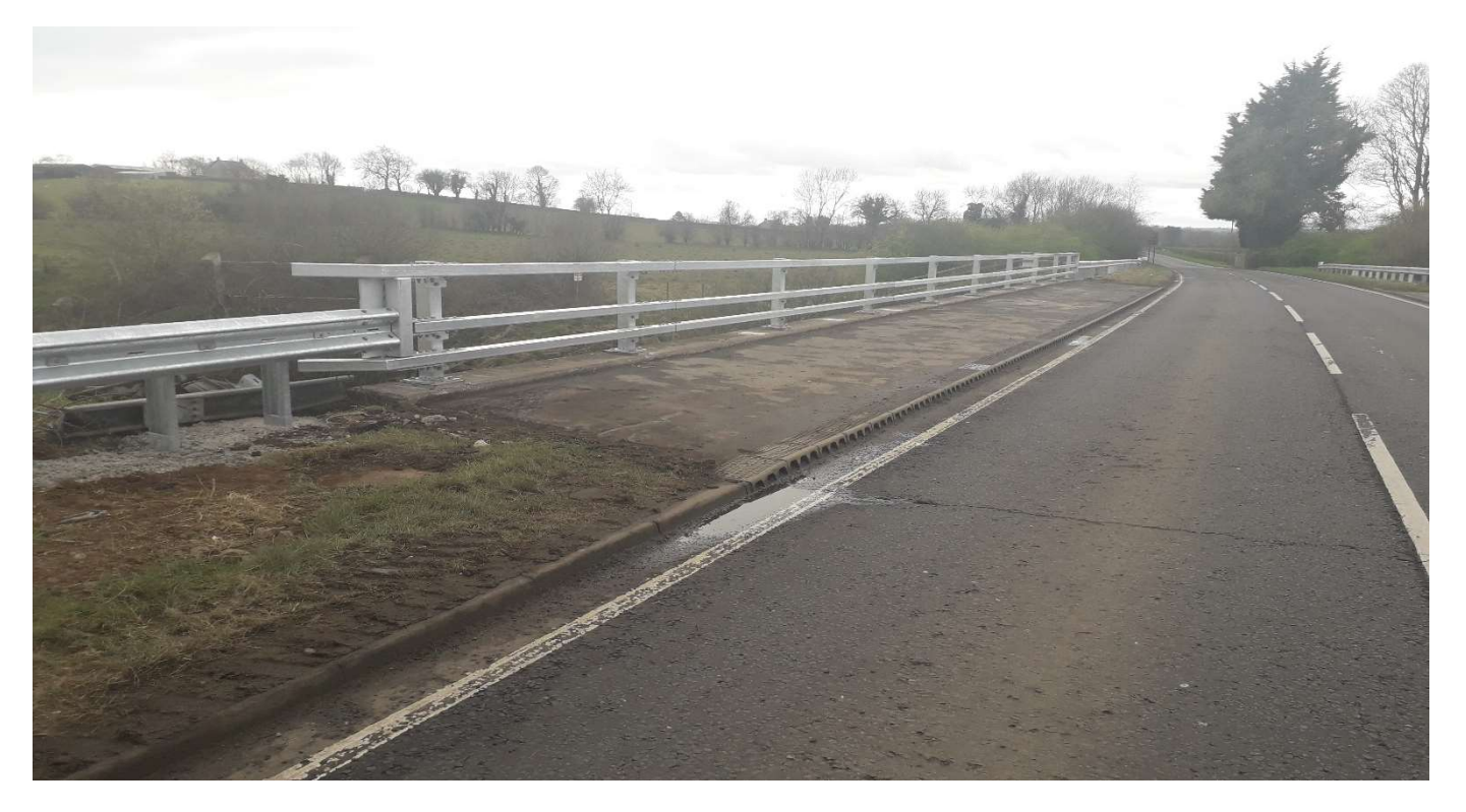
Completed Scheme - Slaght Bridge, Ballymena