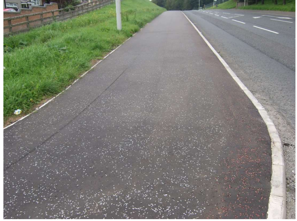
On-going scheme - Grove Road, Ballymena