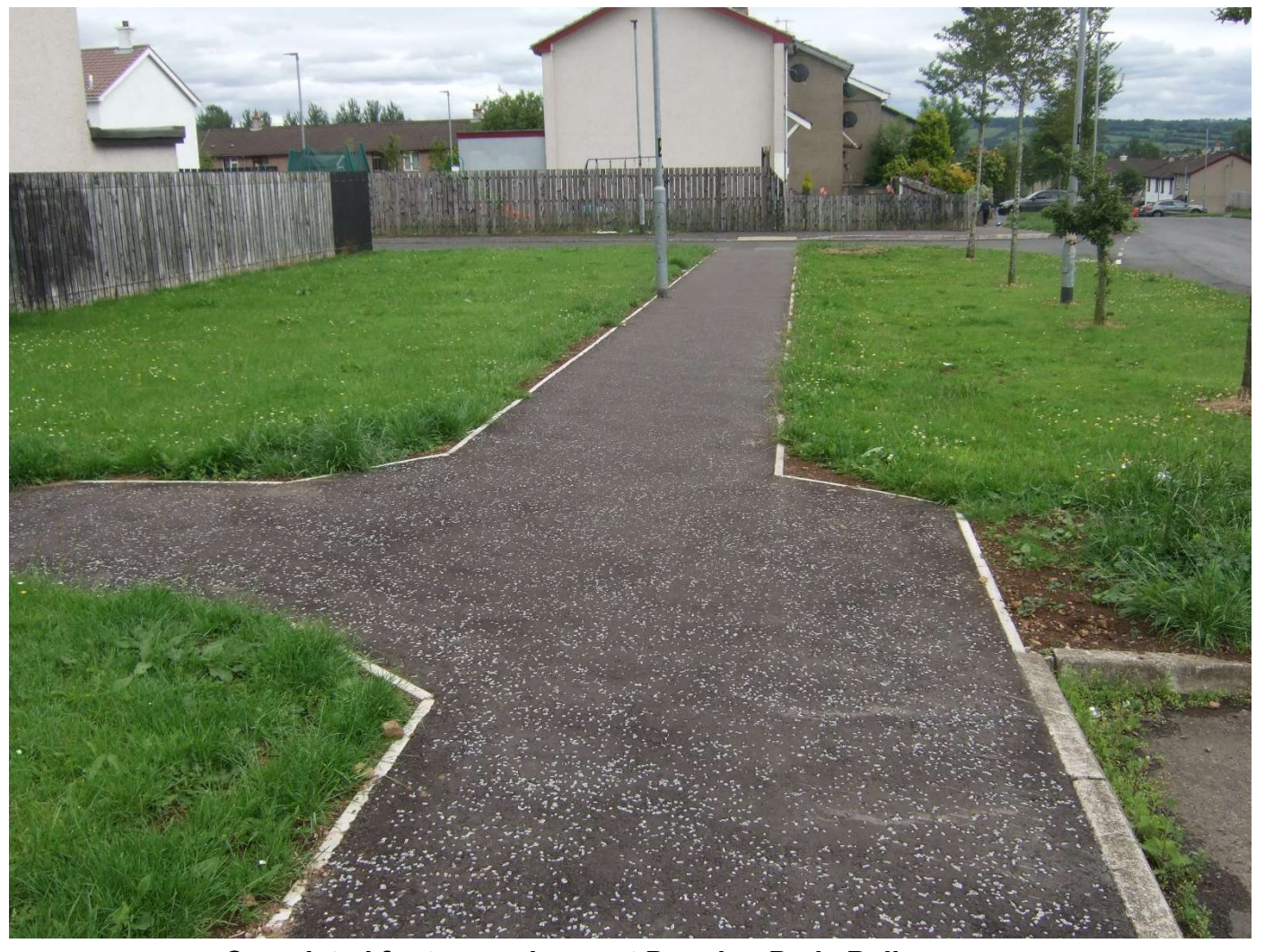
Completed footway scheme at Dunclug Park, Ballymena