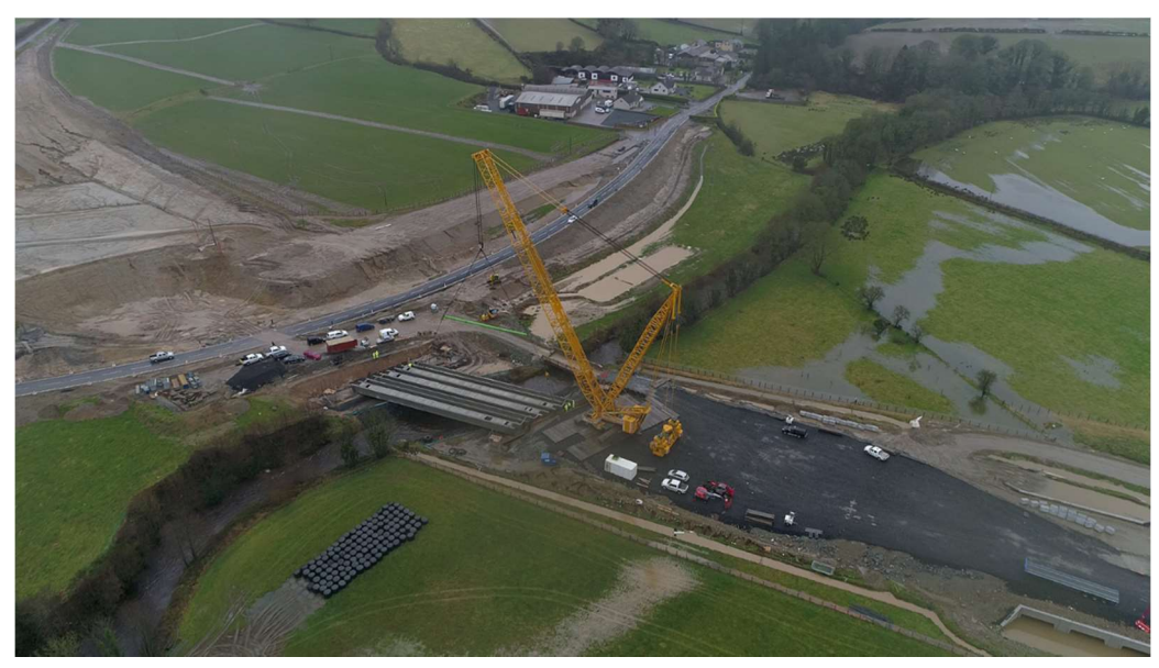
Beams being installed on the Owenrigh River Bridge

For further information on the works and Traffic Management is on the scheme website at: <a href="https://a6d2d.com/">https://a6d2d.com/</a>