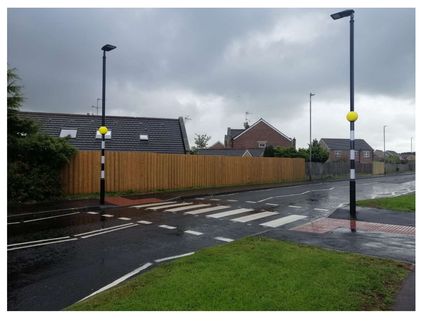
Completed Scheme - Tullygarley Road, Ballymena

The scheme included the provision of Pedestrian Guardrail to improve pedestrians safety, LED street lighting and Belisha Beacons. This scheme will improve pedestrian safety for users accessing the shops, Tullygarley Community Centre and Mid and East Antrim Borough Council's newly constructed children's play park.