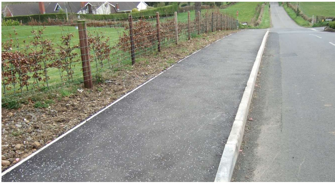
Ballykennedy Road, Gracehill - Completed Scheme