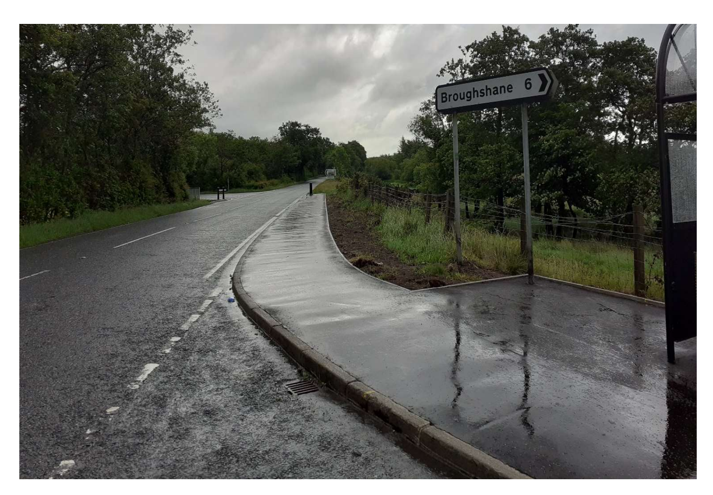
Completed Scheme – Glenravel Road

The scheme is now complete and included the provision of approximately 50 metres of new footway construction, Pedestrian Guardrail, dropped kerb crossing points with tactile paving, pedestrian bollards and the relocation of the existing bus stop. The bus stop was relocated in conjunction with Mid and East Antrim Borough Council who provided the bus shelter and Translink who agreed to the position.