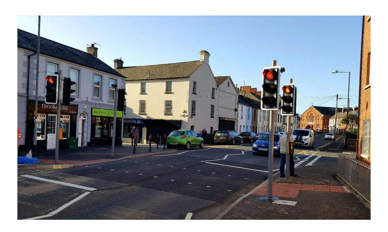
Puffin crossing at St Brides Street, Carrickfergus

The Puffin crossing has two sensors on top of the traffic lights which detect if pedestrians are crossing slowly and can hold the red traffic light for longer if needed. In addition, if a pedestrian presses the button but then walks off, the sensor will cancel the request making the lights more efficient both for pedestrian safety and traffic progression.