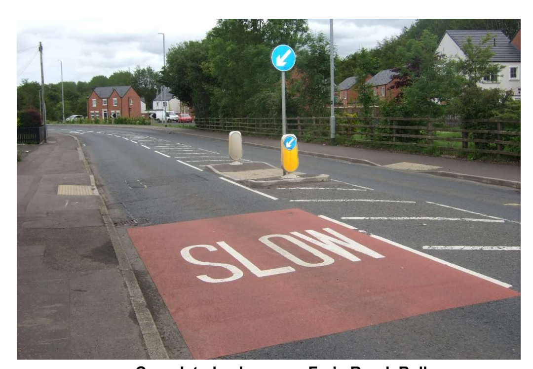
Completed scheme on Fry's Road, Ballymena

An additional safe crossing point was provided to the recently finished Fry's Road scheme at Fry's Meadow. This work incorporated tactile paving at the crossing points for any visually impaired users and 'night owls' to highlight the pedestrian island to motorists. The new footway linkage and crossing point provides a safe location for residents of Fry's Meadow and also the nearby Fry's Hollow to cross the road.