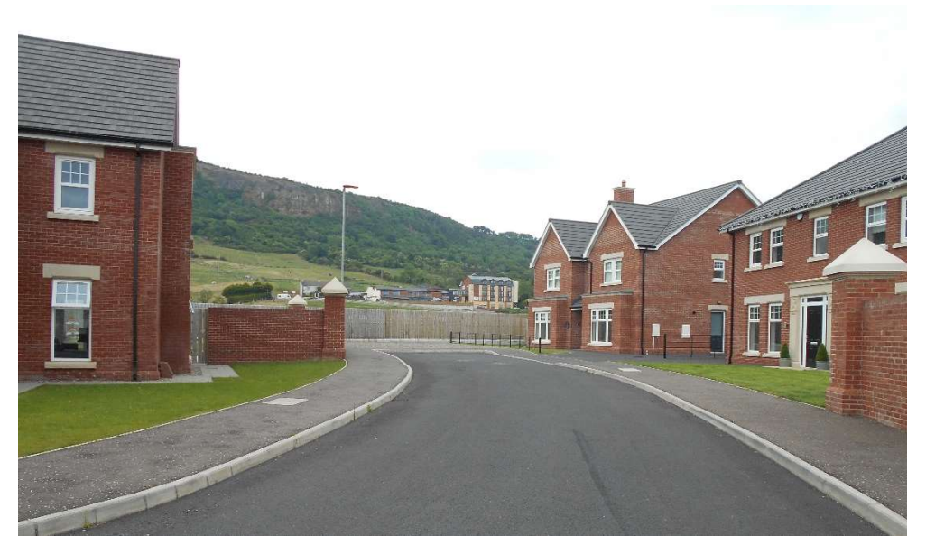
Barton Hall, Greenisland