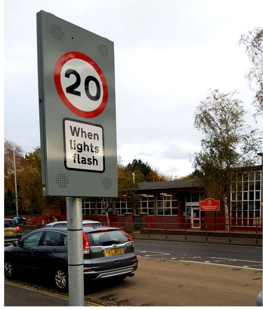
Part time 20mph on A2 at Model Primary School

The scheme consists of gateway 20mph signs with 'wig wag' lights that flash at pre-programmed times. 'Wig wag' lights have proven an effective method of speed reduction at other locations and this scheme will help reduce traffic speeds in the vicinity of the school where vulnerable road users, such as children, regularly cross the road. The scheme has the full support of Mid and East Antrim Council, the Model Primary School and PSNI, and has been well received by all stakeholders. The PSNI can enforce this speed reduction if there is non-compliance.