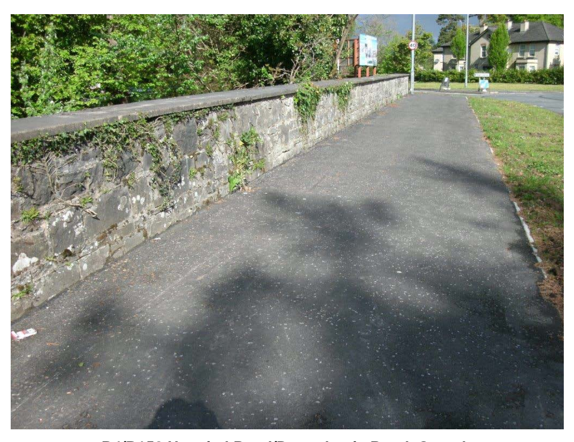
B4/B158 Hospital Road/Donaghanie Road, Omagh