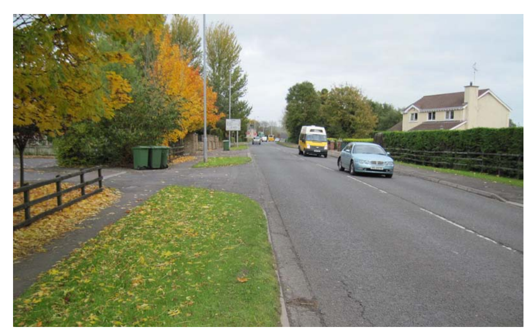
A32 Tempo Road, Enniskillen - Before