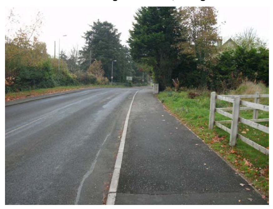
C627 Deverney Road, Omagh