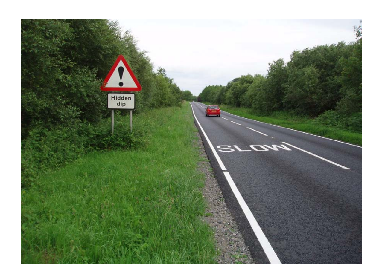
Resurfacing on A32 at Derrynanny