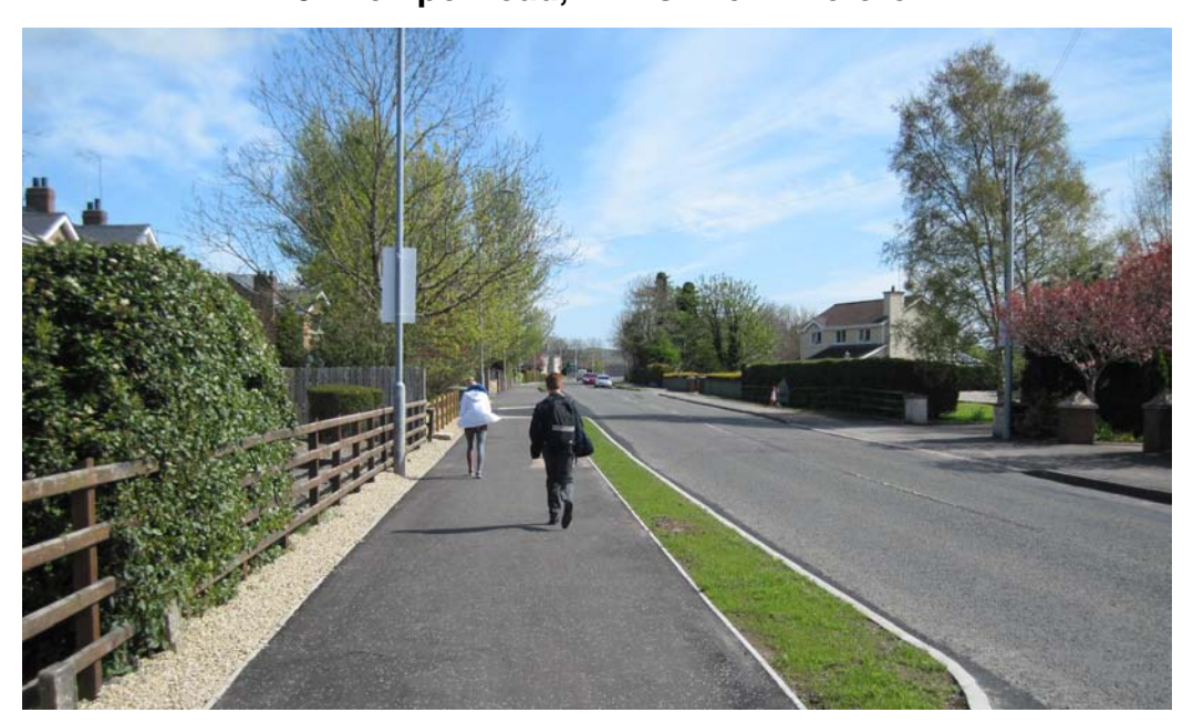
A32 Tempo Road, Enniskillen - After