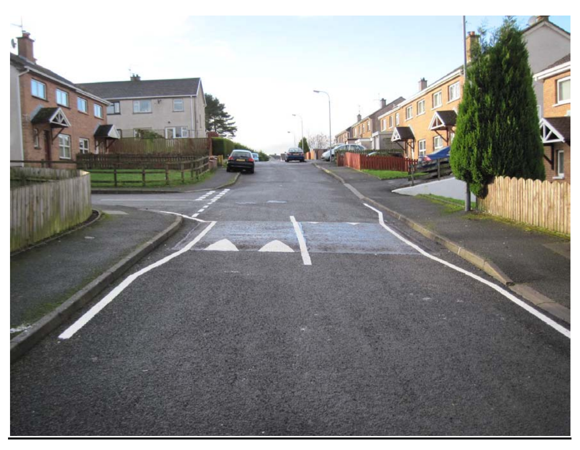
Glebe Park, Enniskillen – Traffic Calming provision