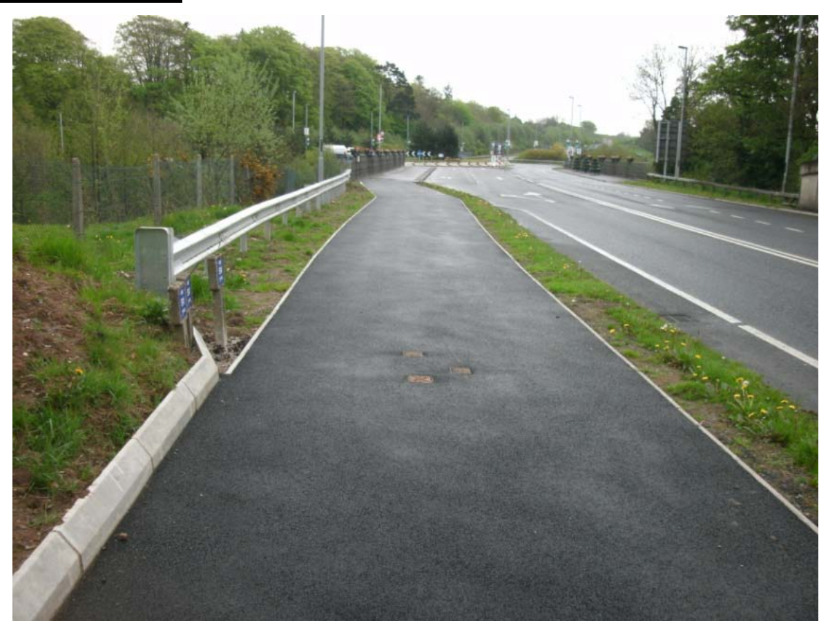
A5/A505 Dublin Road/Crevenagh Road