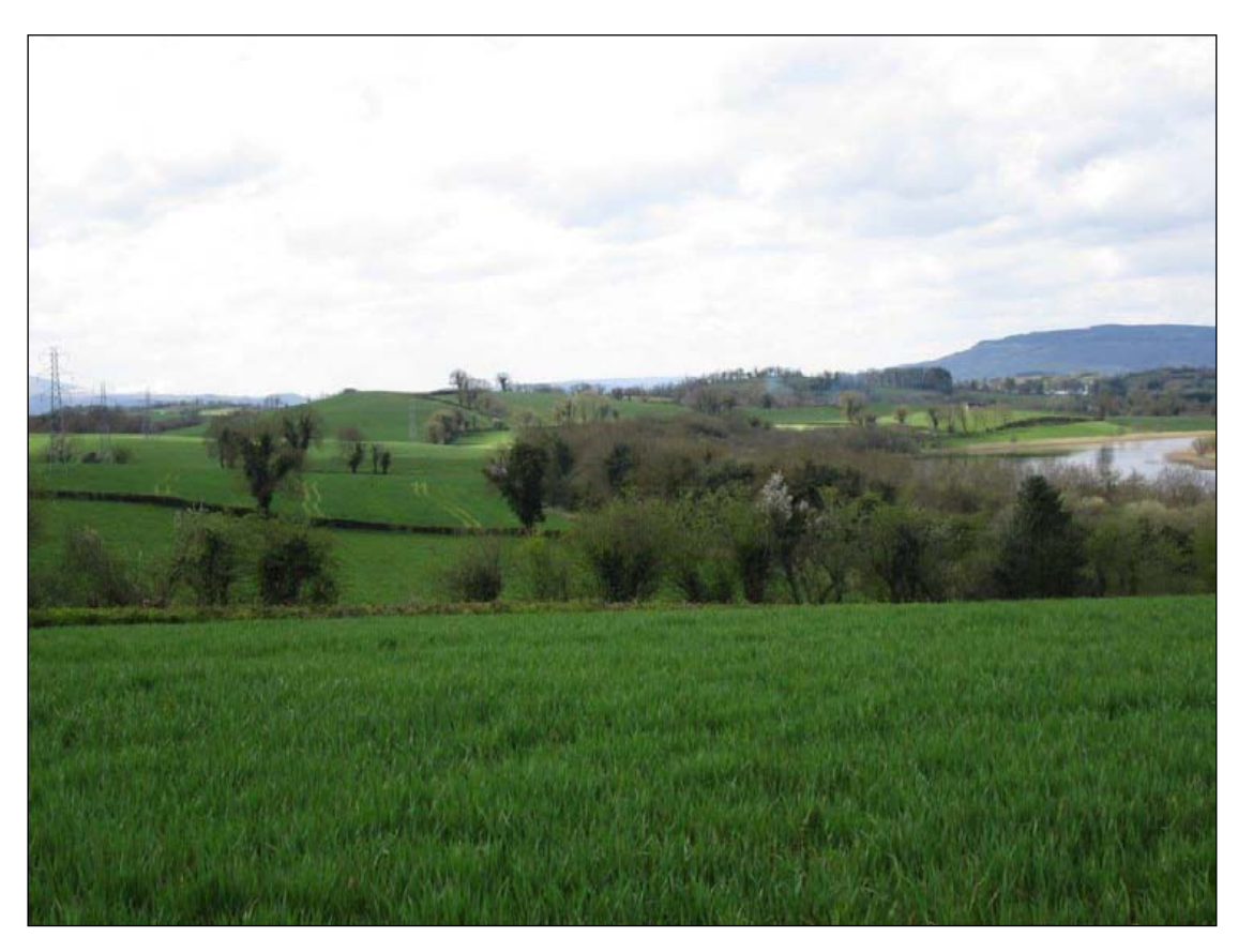
Emerging preferred Route Enniskillen Southern Bypass

Progression of the scheme to the Making of Orders and the associated Statutory Consultation process (which may include a Public Inquiry) will depend on the availability of funding.