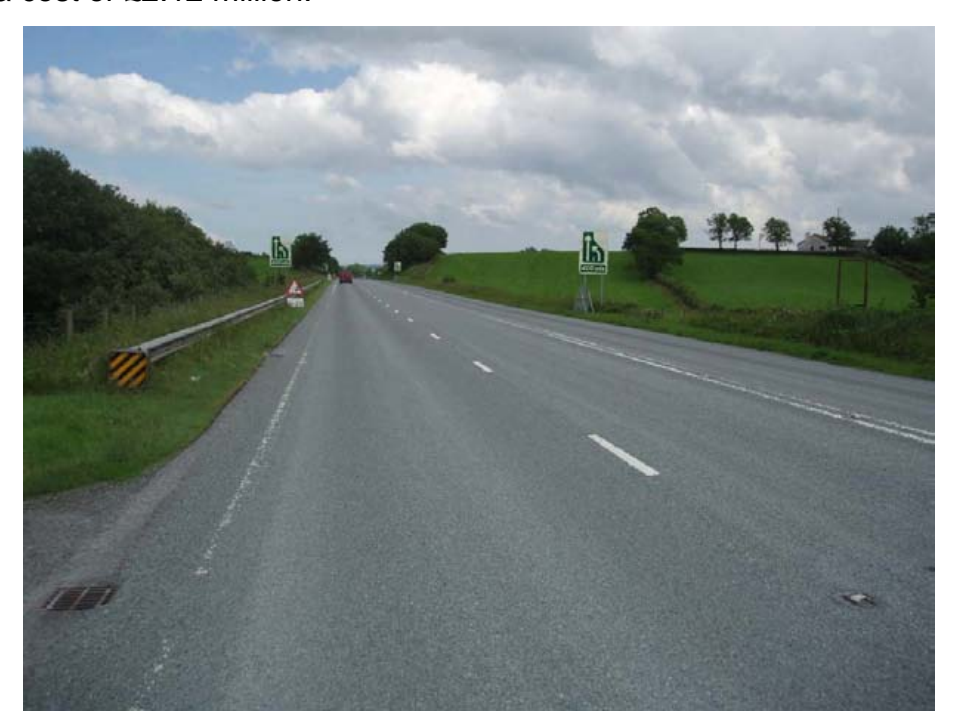
Surface dressing on A4 Belfast Road at Faughard

Last year 267.3 kms of road were surface dressed in the Fermanagh and Omagh area at a cost of £2.12 million.