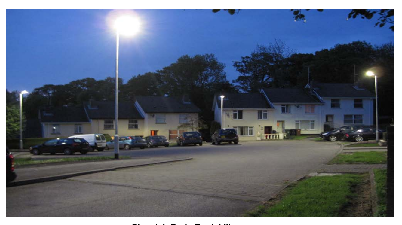
Cleenish Park, Enniskillen

Particular mention should be made of the work carried out on Gortin Road, Omagh & Cleenish Park, Enniskillen where an increase in funding near year end allowed commencement or completion of renewal schemes in these areas.