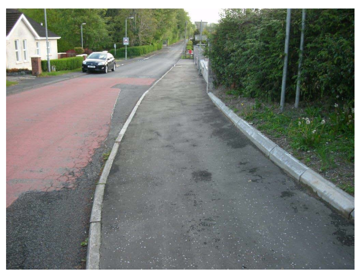
C625 Knocknamoe Road, Killyclogher, Omagh