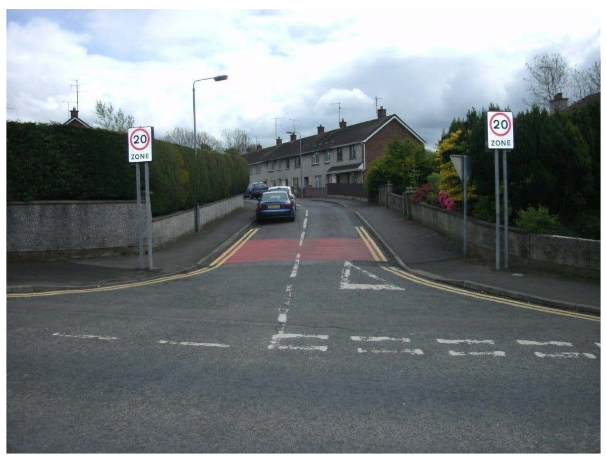
Centenary Park, Omagh