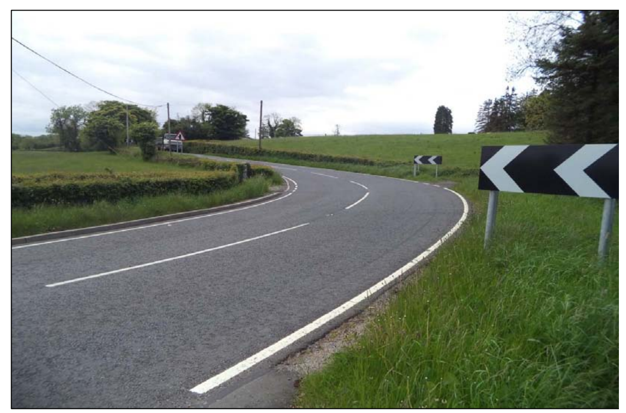
Resurfacing on A4 Sligo Road at 'Double Corners'