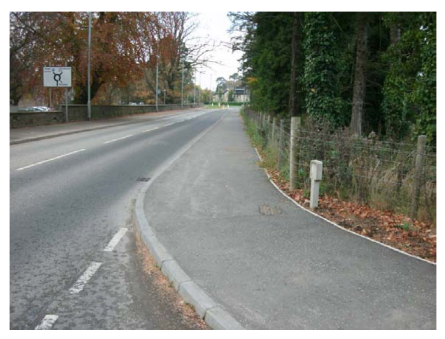
B158 Donaghanie Road, Omagh