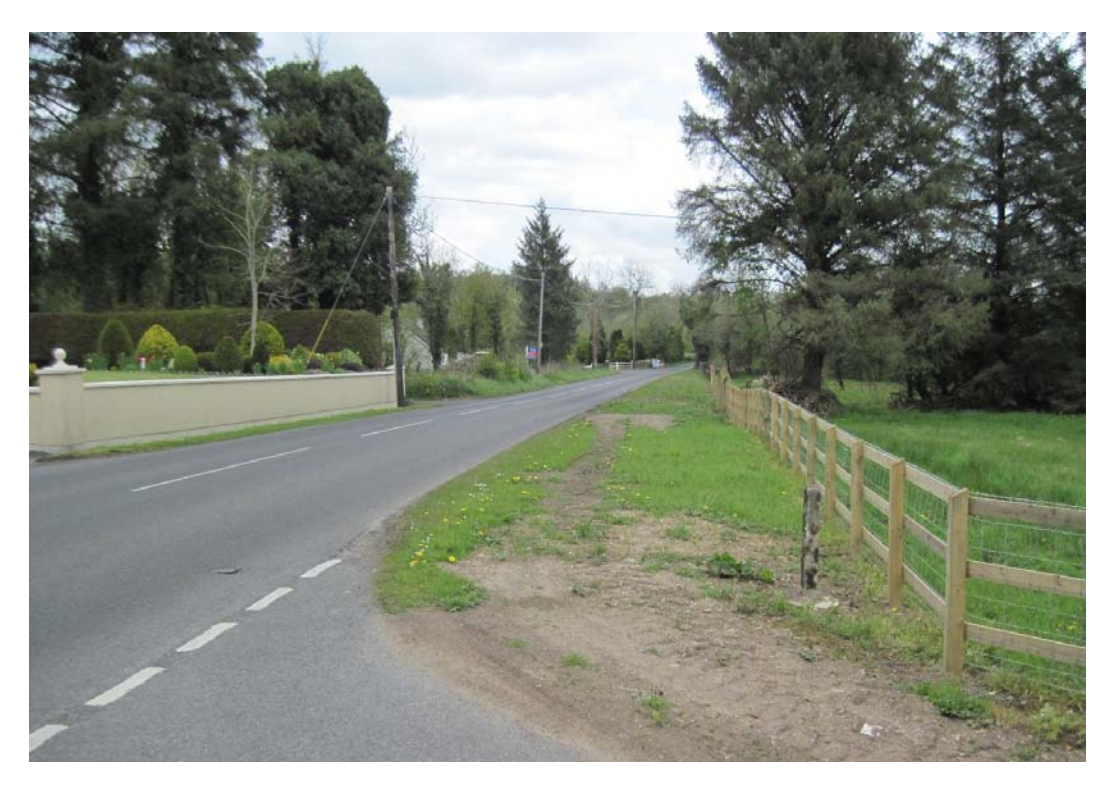
B36 Dernawilt Road/Aghadrumsee Road – Sightline improvement scheme