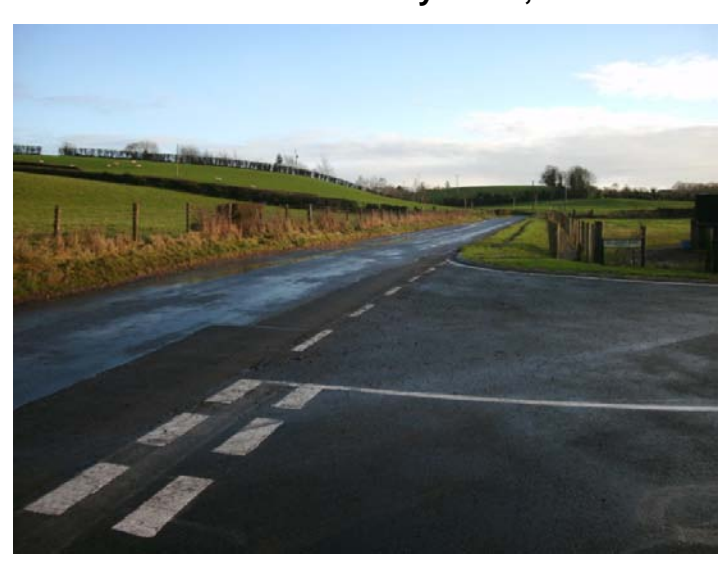
Newtownsaville Road/Killadroy Road, Eskra - after