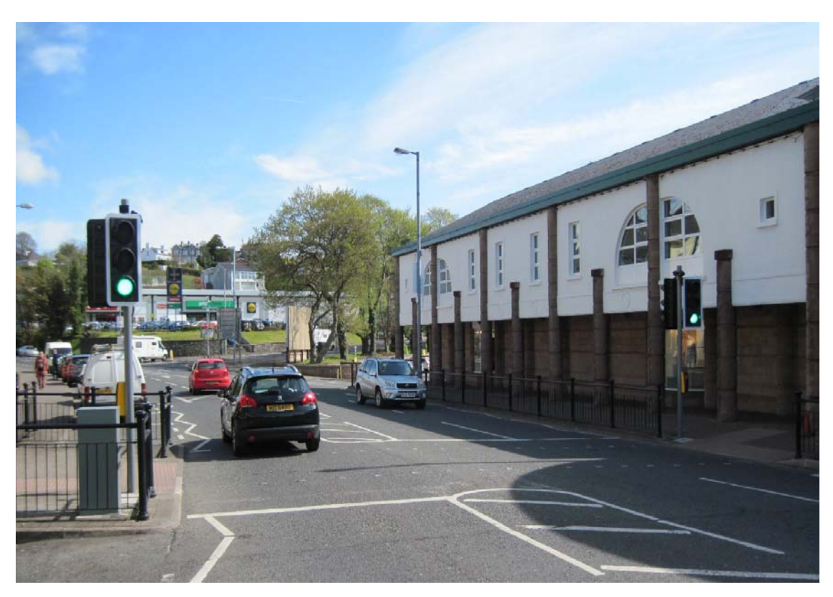
A32 Forthill Street, Enniskillen - Puffin crossing provided