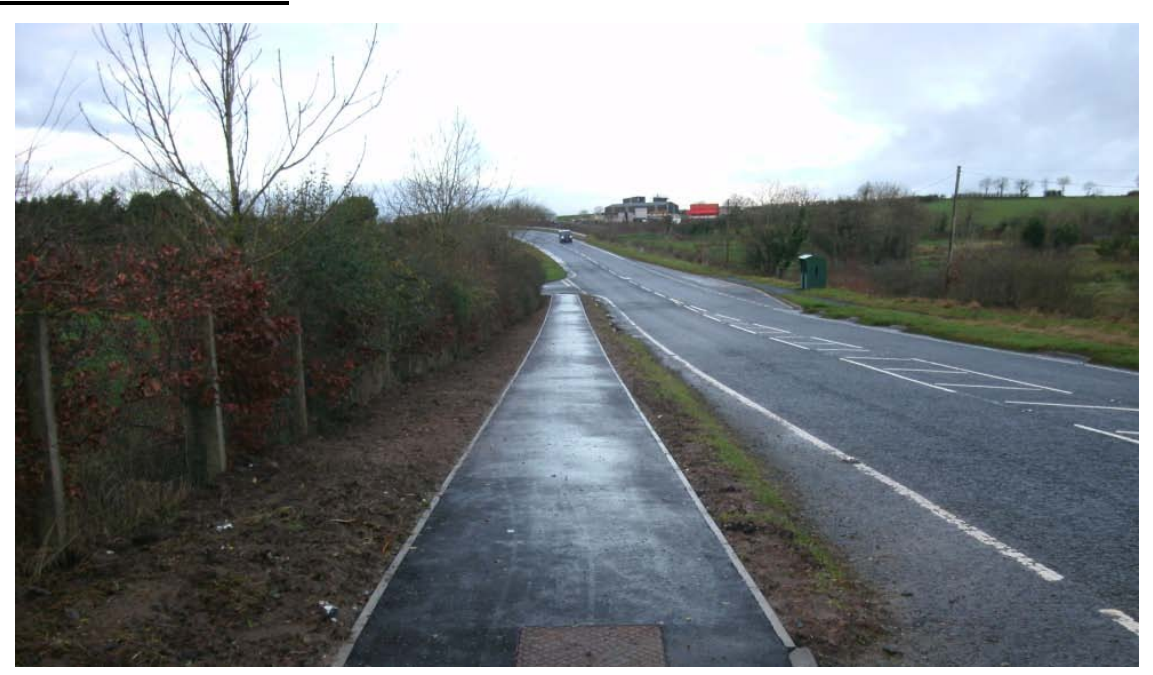
A32 Clanabogan Road, Omagh