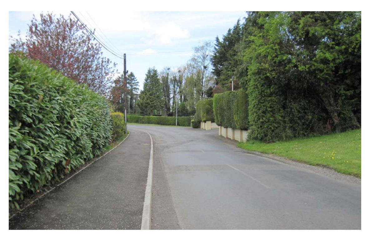
Magheraveeley Road, Newtownbutler – new footway provision