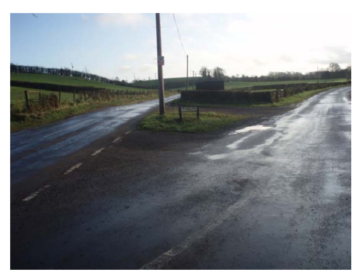
Newtownsaville Road/Killadroy Road, Eskra - before