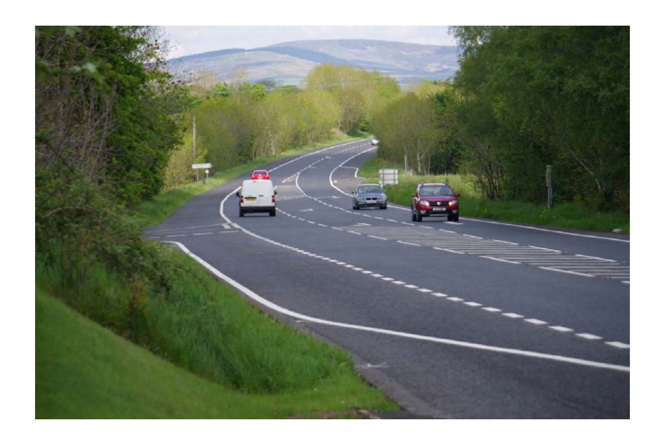
A32 Clanabogan Road