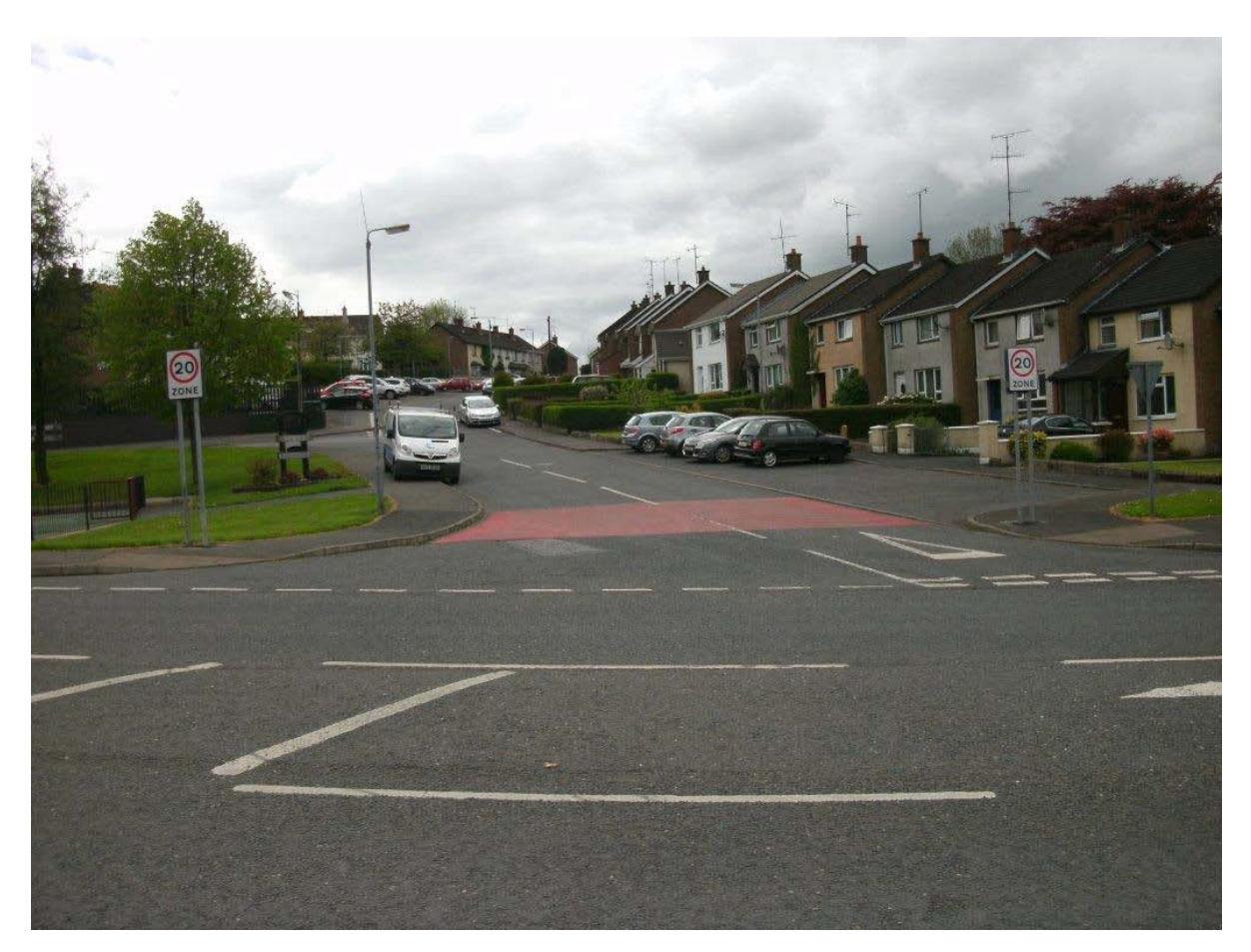
Strule Park, Omagh