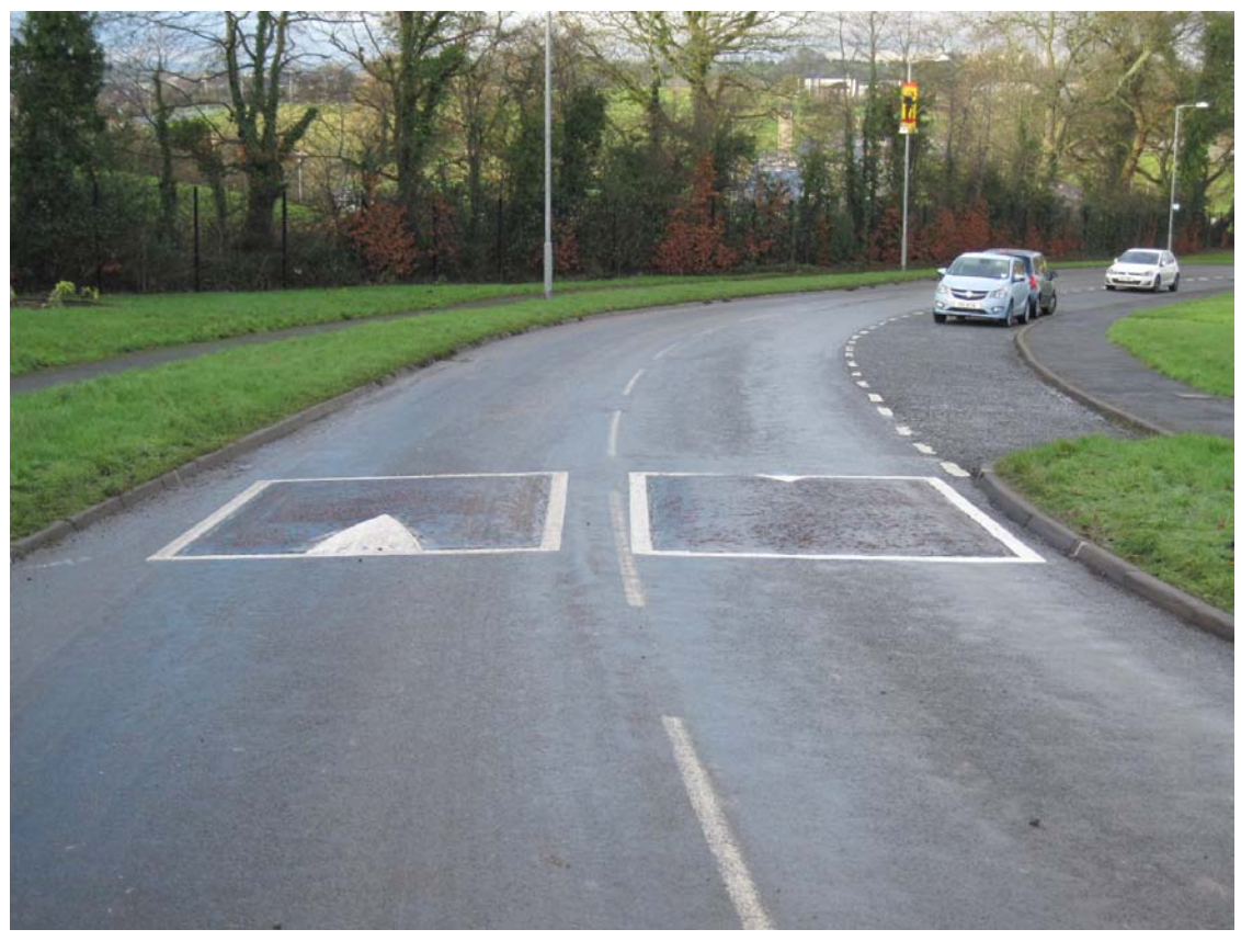
Loane Drive, Enniskillen – Traffic Calming provision