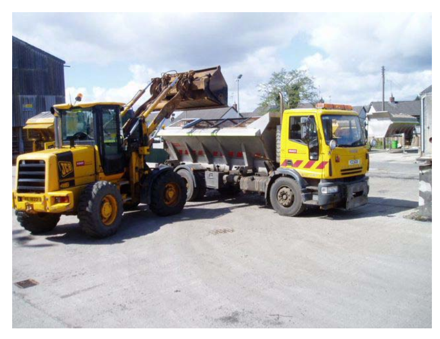
Loading a lorry for a gritting action

During the winter of 2015/16 there were 65 occasions when salt was applied to the 340km of roads on the gritting schedule using 3264 tonnes of salt, a decrease of 36% over the previous year when there were 91 salting actions. The first application of salt took place on 20 November 2015 and the last action was on 15 April 2016