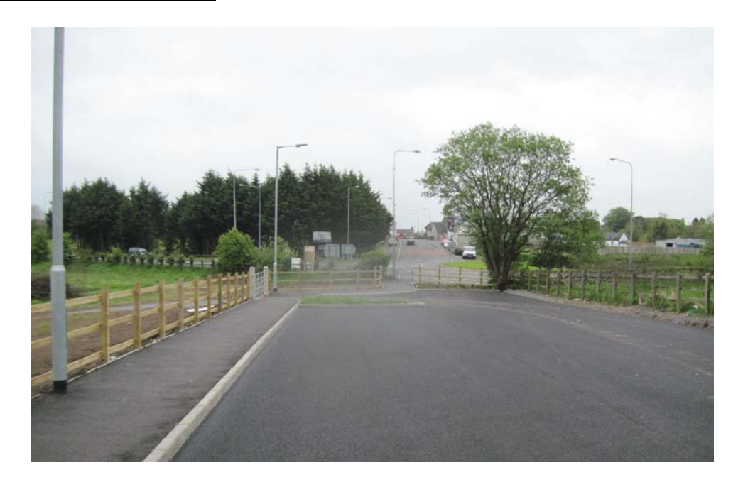
Gardiners Cross Road, Maguiresbridge – Park and Share provision