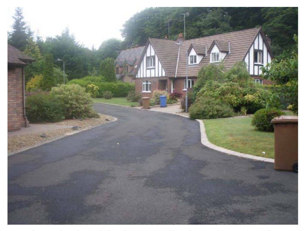
Recently adopted development at Hawthorne Grove, Omagh

We have been successful in adopting 8 private streets within developments and a total length of 3.78km has been added to the maintained network in the past year. These include: