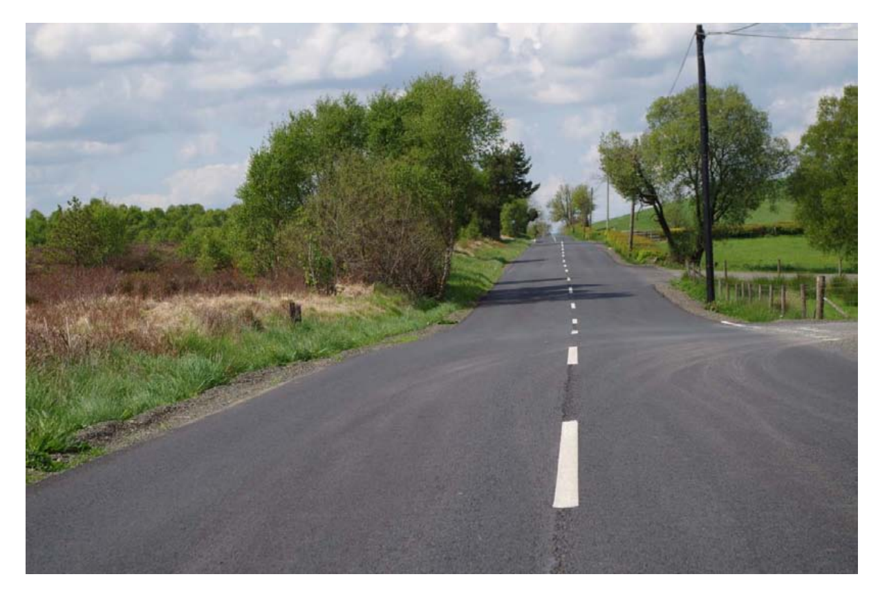
B158 Donaghanie Road