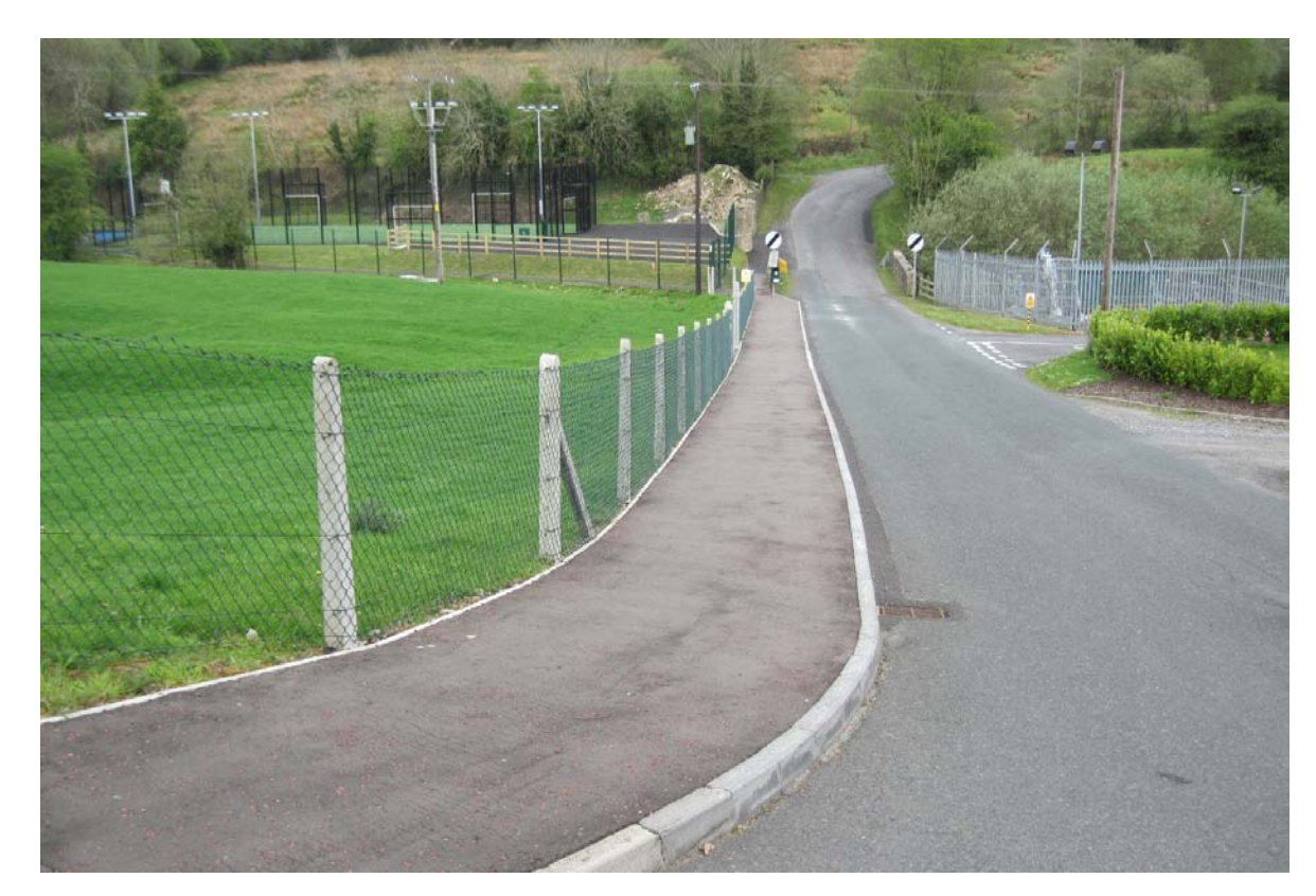
Kilsmullen Road, Lack – new footway provision