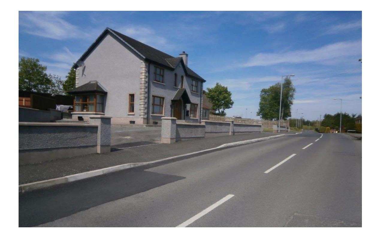
U1269 Killybrack Road, Omagh – infill footway provision