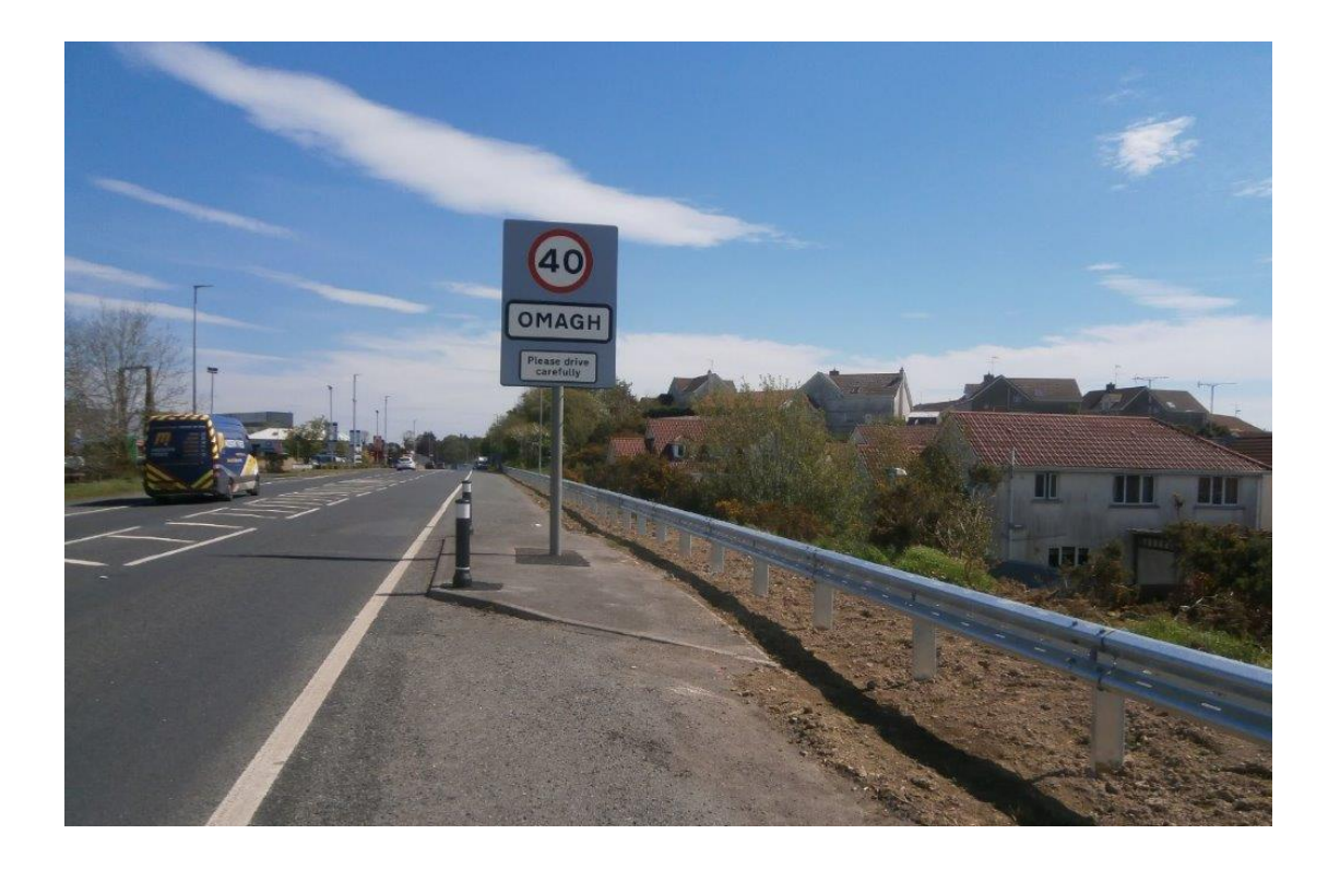
A32 Clanabogan Road, Omagh – Vehicle safety barrier