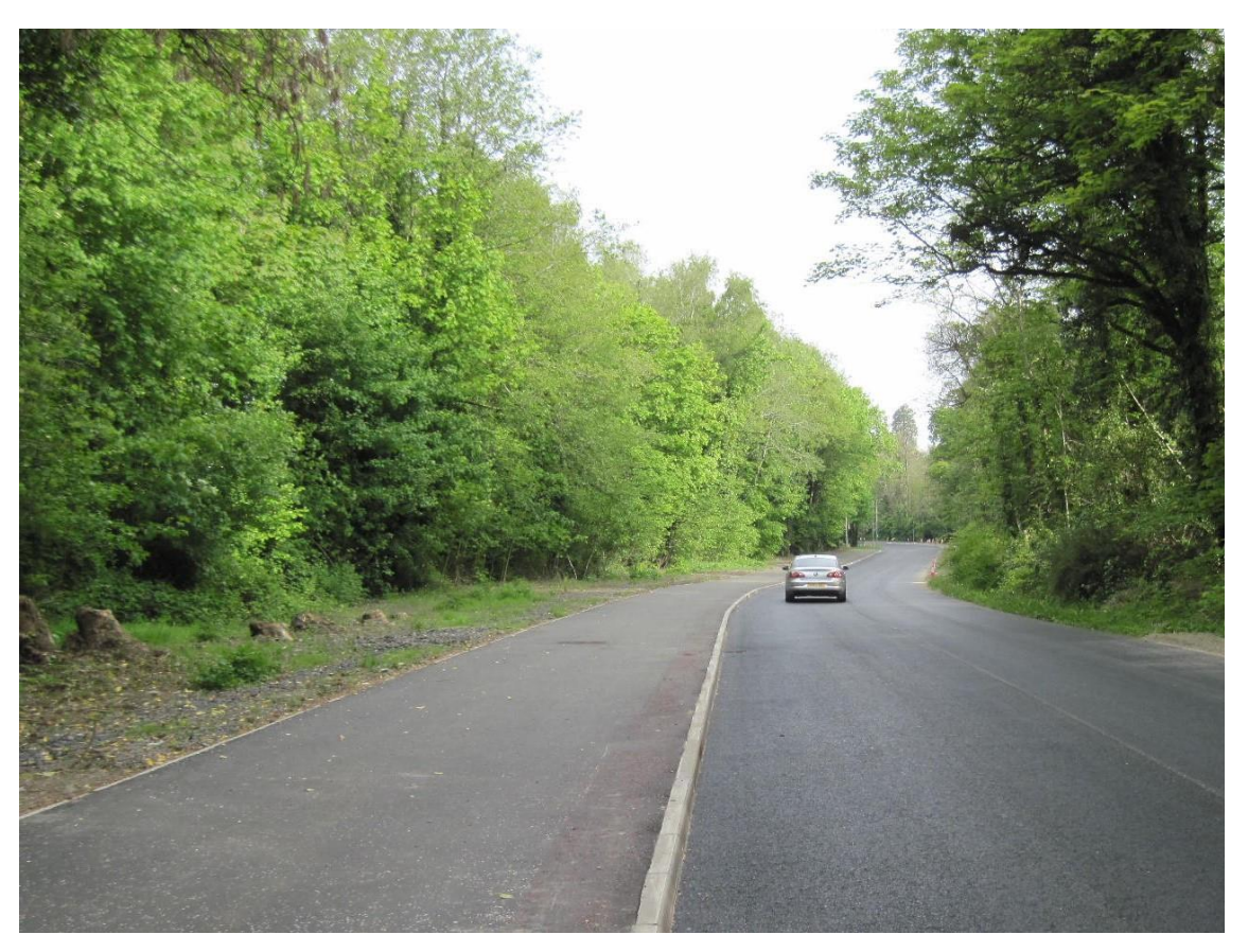
U6513 Lough Yoan Road, Enniskillen – Provided new shared footway/cycleway