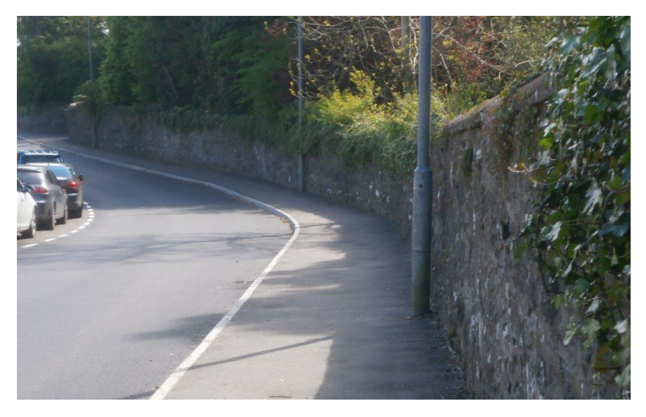
U3005 Brooke Street, Omagh – footway widening