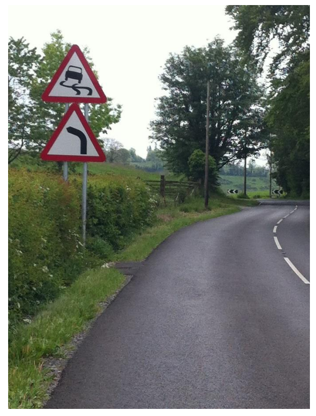
A34 Clones Road, NTB - provide new warning signs along entire route

A509 Derrylin Road, Enniskillen Upgraded speed limit signs and all repeater signs - 14 signs