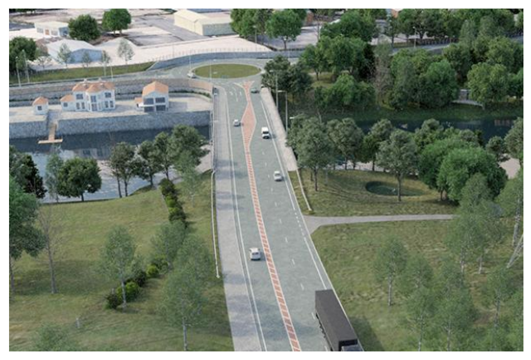
Artists Impression of Enniskillen Southern Bypass where it would link to the A4 Dublin Road (image from the Public Information Day held in April 2018)

The Department considered all the comments received and in January 2019, given the very low number of objections received to the scheme, decided that the scheme should move to the next stage of development without recourse to a public inquiry.