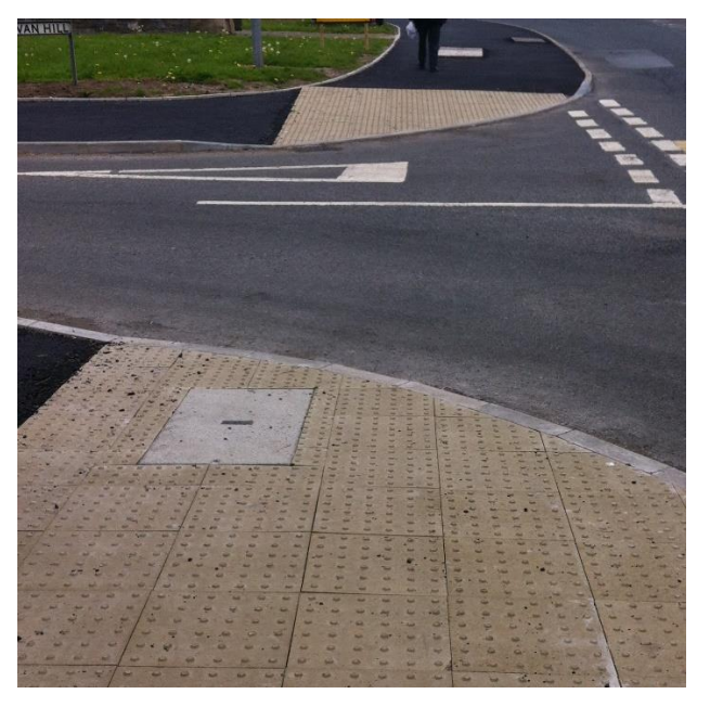
A34 Main Street (Silvan Hill) & Nutfield Road, Lisnaskea: provided shared footway/cycleway