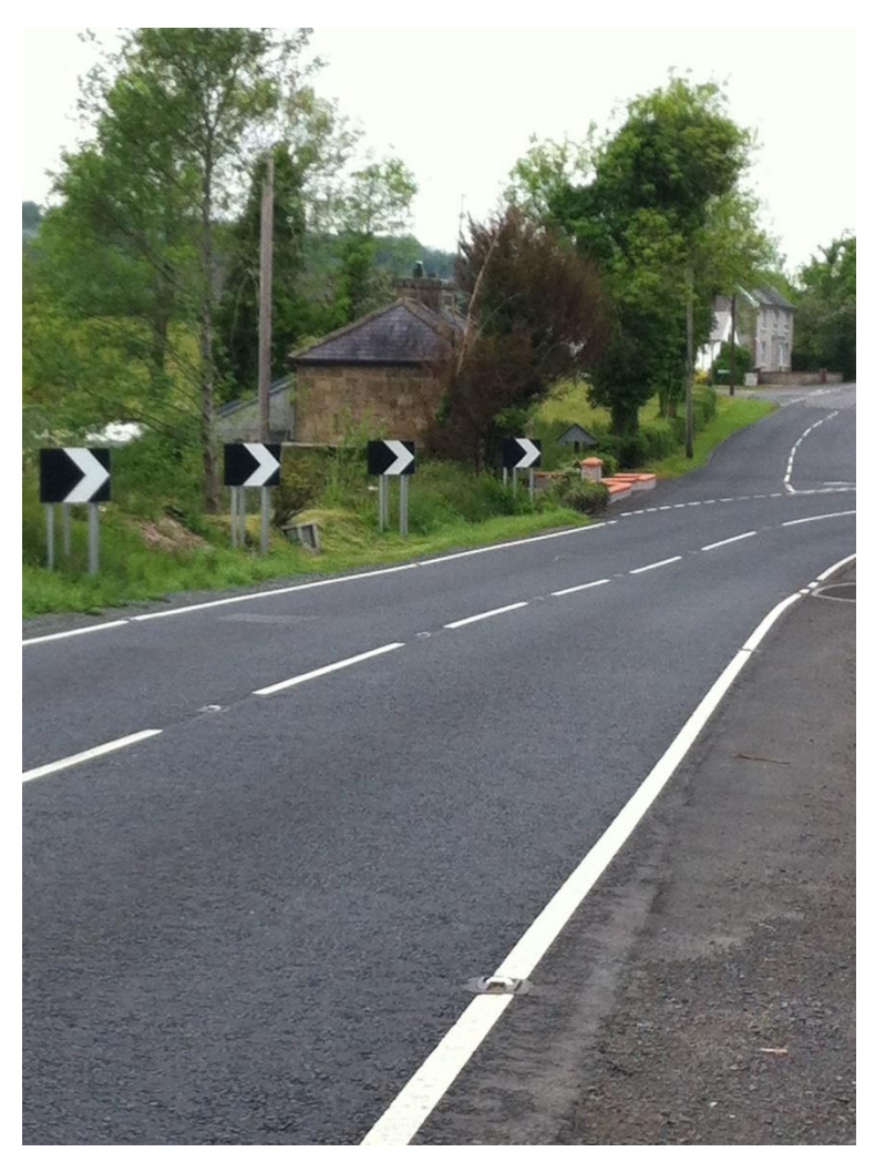
A509 Derrylin Road at "Fatt's Cross" – provided new chevron boards