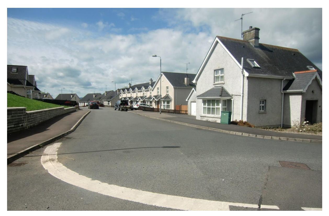
Recently adopted: Carnwood