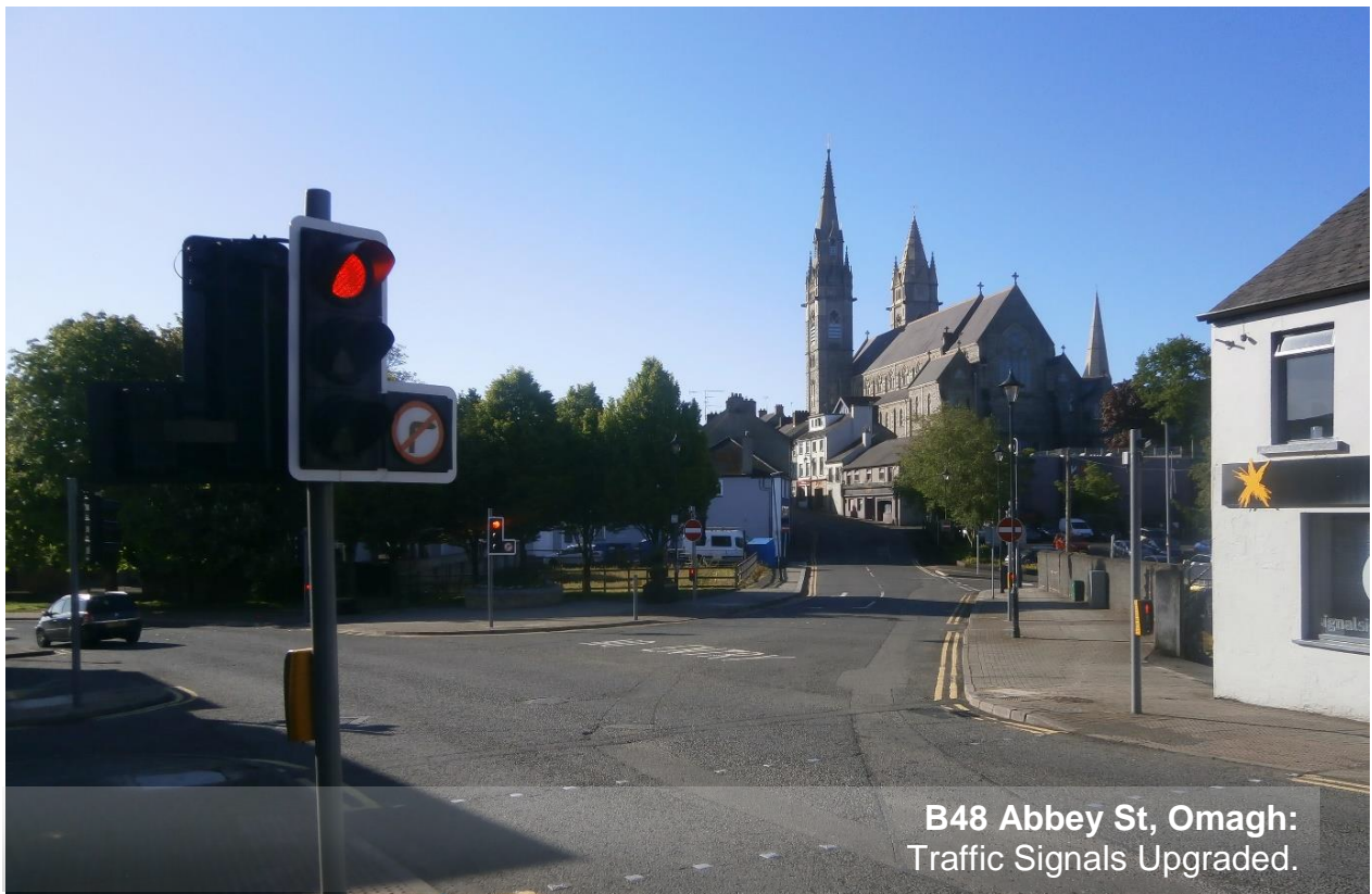
B48 Abbey St, Omagh: Traffic Signals Upgraded.