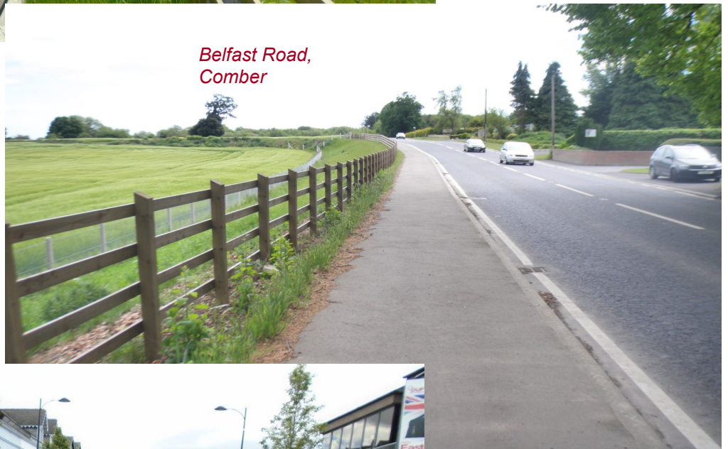
Belfast Road, Comber