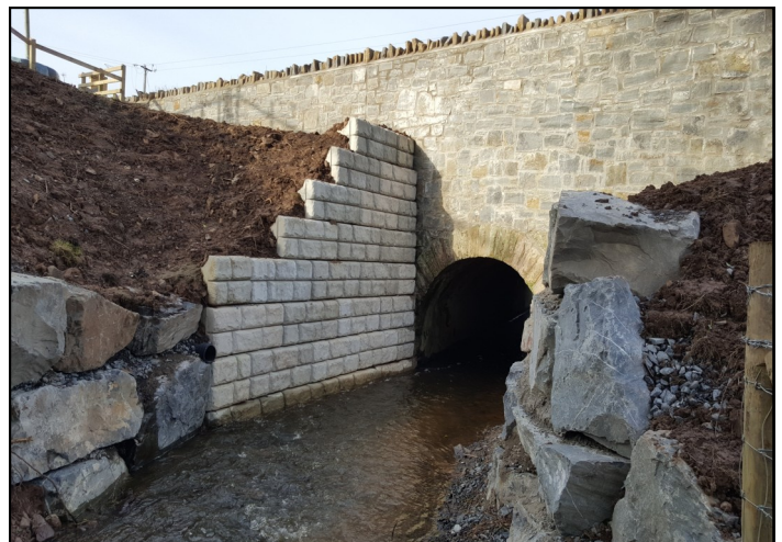
Ballygowan Road, Comber