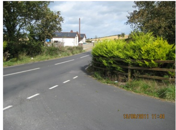
Photographs showing existing junction

If additional funds become available the following scheme will be progressed subject to agreement with landowners.