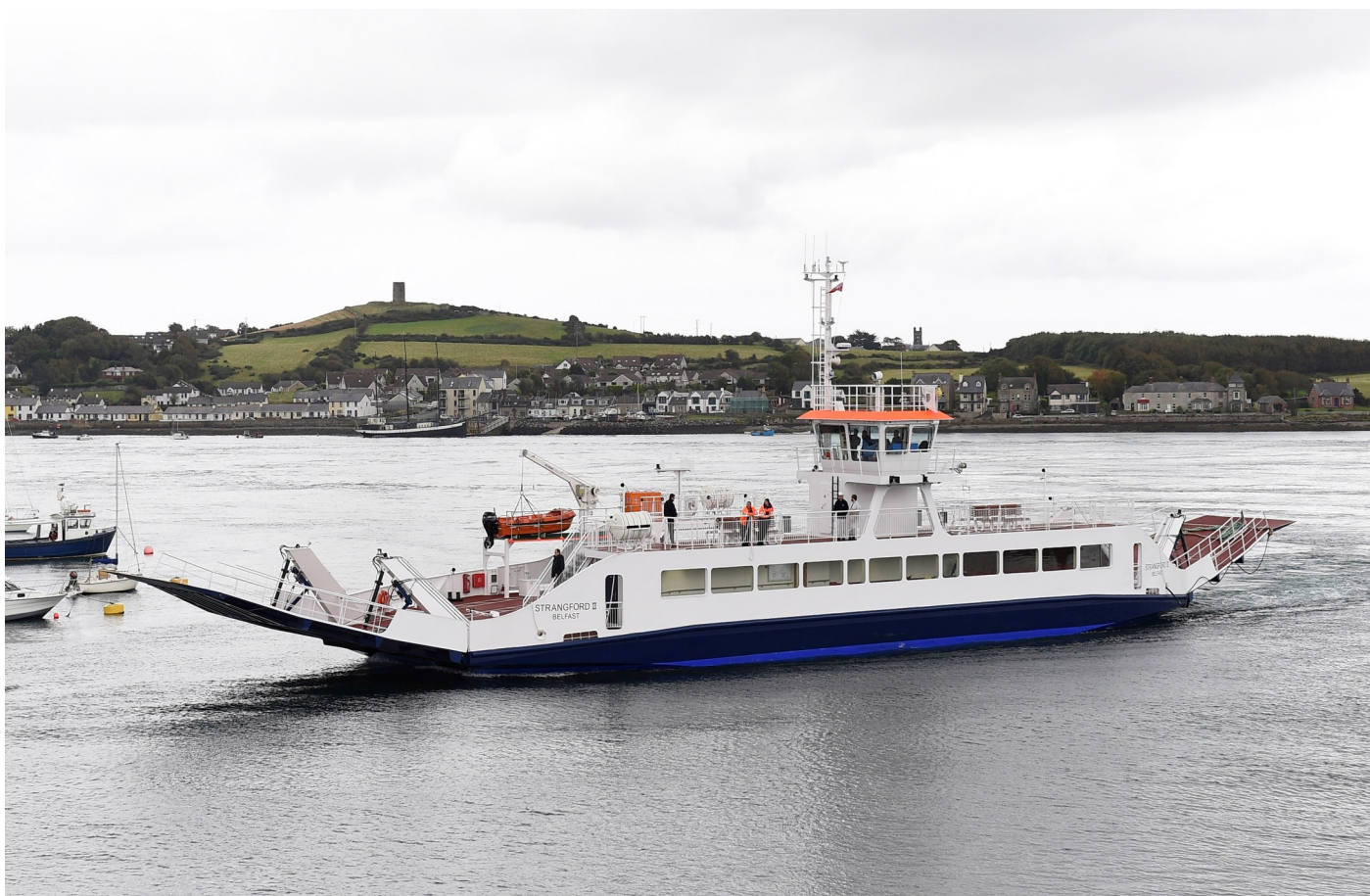
MV Strangford II