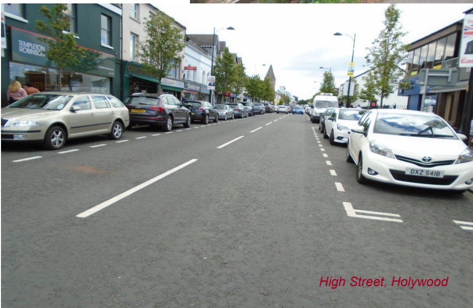
High Street, Hollywood