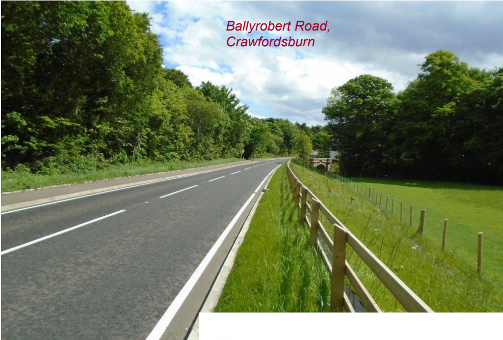
Ballyrobert Road, Crawfordsburn