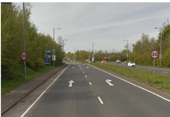
Before the scheme

A review of collision data provided by PSNI has identified rear end shunts as a common factor on collisions at this location. The provision of high friction surfacing is the preferred treatment for such incidents to raise driver awareness and improve safety on the approach to the roundabout. High friction surfacing was provided on the approach to the roundabout in 2016