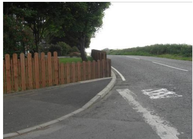
Photographs showing existing layout between Bailie Terrace and Avonmore Court