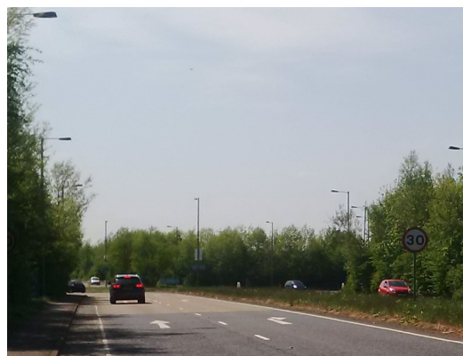
High Friction Surfacing provided