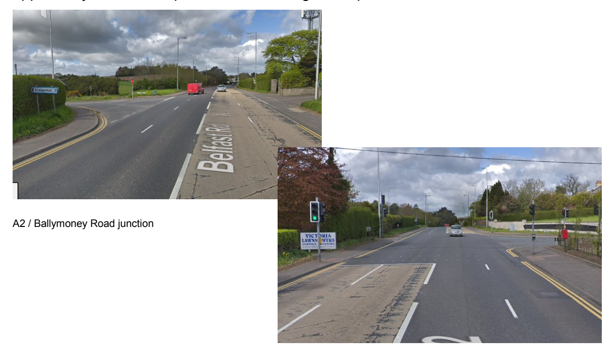
A2 / Craigdarragh Road junction

The provision of traffic signals will reduce the risk of collisions caused by right turn manoeuvres as motorists will be less likely to take risks when they know they will be given the opportunity to do so as part of the traffic signal sequence.