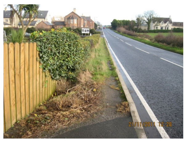
Original verge at Avonmore Court

This scheme was identified to improve accessibility and safety for pedestrians in Cotton and was split into 2 sections with the infill footway along the A48 Newtownards Road at the new development at Avonmore Court being delivered by the Department under Private Streets funding.