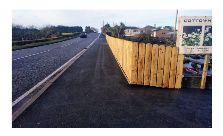
Footway provision completed Nov 2018

This section of the footway has now been successfully completed.