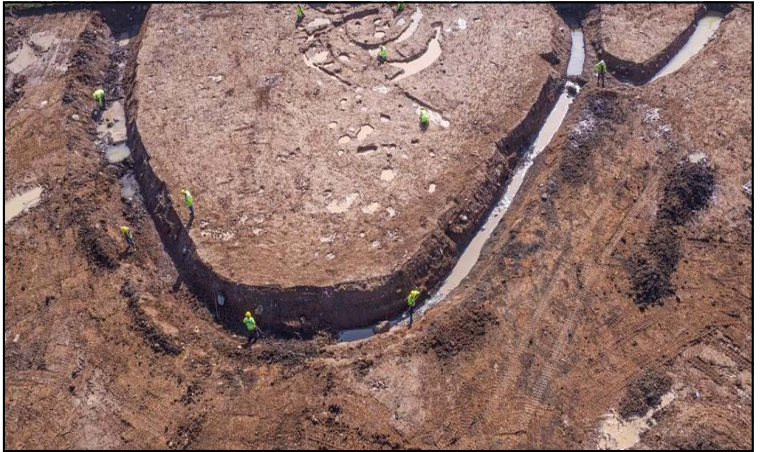
Archaeology Site — Enclosure in Artresnahan townland

The Department, in consultation with NIEA Historical Environment Division, has implemented a significant Archaeological Investigation Strategy to determine the sterility of the site prior to the commencement of any major earthworks. The investigation has recovered a number of important