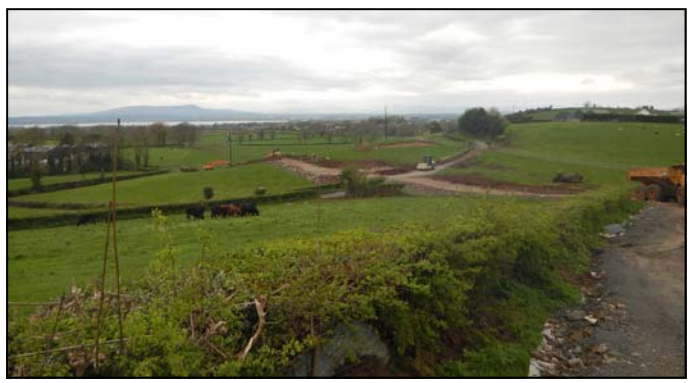
Earthworks commenced on the Randalstown to Toome section of the scheme.

On the 2 May 2017 the Department for Infrastructure announced its decision to advance main construction of the A6 Randalstown to Castledawson Dualling Scheme, representing an investment of £160 million. This decision followed the court's ruling in March to dismiss an environmental challenge. The court concluded that the Department had developed the scheme in a manner that was both lawful and rational. The Randalstown to Toome and Moyola to Castledawson sections are currently being progressed, with the remaining sections to advance following the outcome of an appeal specific to the Deerpark to Toome section which has been lodged and will be concluded in due course.