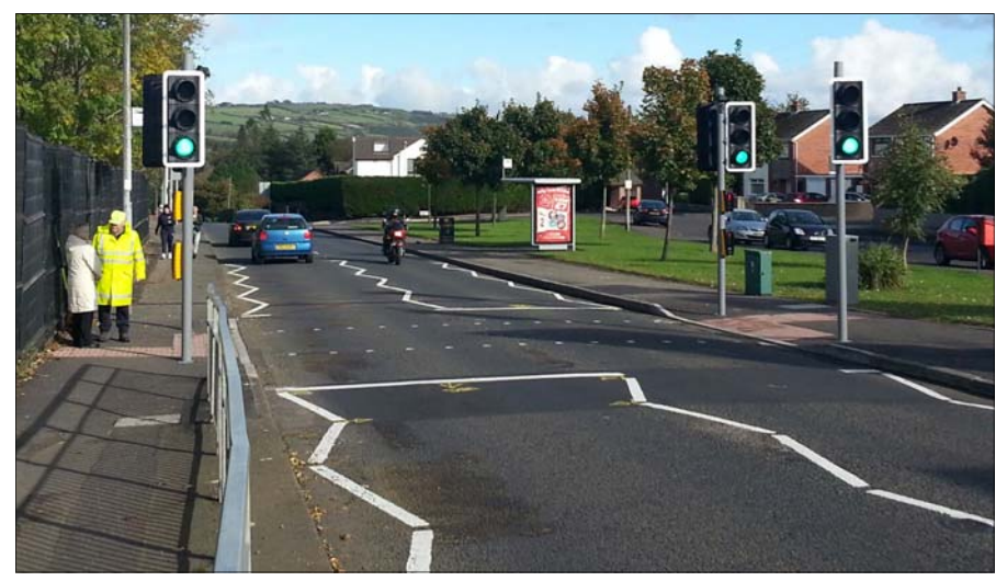
Manse Road Puffin Crossing.

A new puffin crossing has been provided on the Manse Road, Newtownabbey at the entrance to Mossley Primary School. This formal crossing provides a safe crossing facility for pupils and parents going to and from the school.