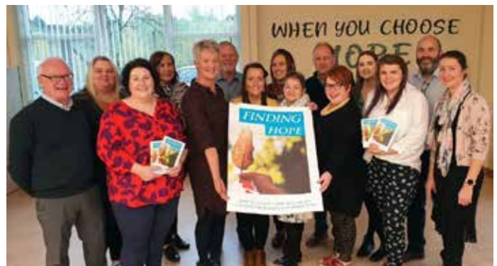
Western Recovery College members at the launch of Finding Hope , a guide to local mental health and wellbeing support

Our sincere wish is that everyone who reads the guide will take some comfort and hope from the knowledge that they are not alone in even the most difficult of times, and that everyone has the potential for recovery.