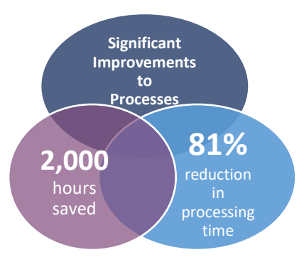
Phase 1 of the project saw significant improvements to the processes of making a forensic submission request. In addition, Police Officers no longer

Building on the work of the initial Submissions Gateway Project, a second Phase has been launched to develop this area further. A Terms of Reference for the work was produced in March 2022 and the objectives have been agreed. This is a collaborative project across PSNI, FSNI and PPS which will consult with the State Pathologists Department, Coroner's Service and representatives of the Victims of Crime.