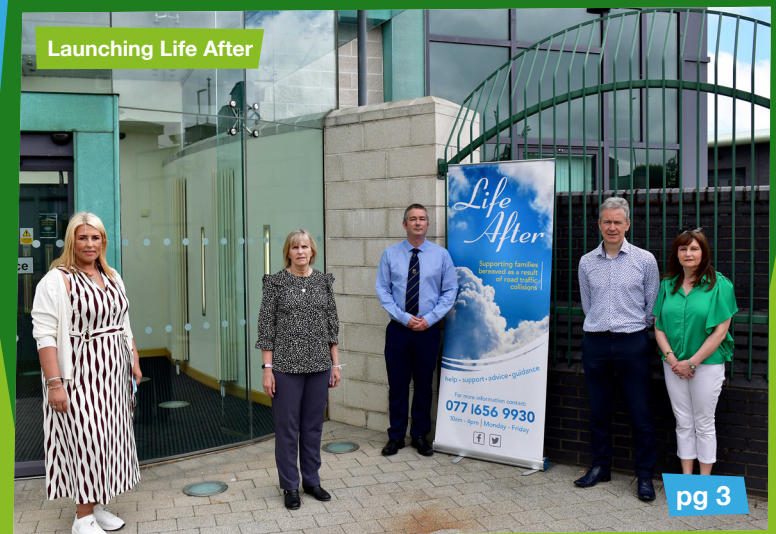
Launching Life After