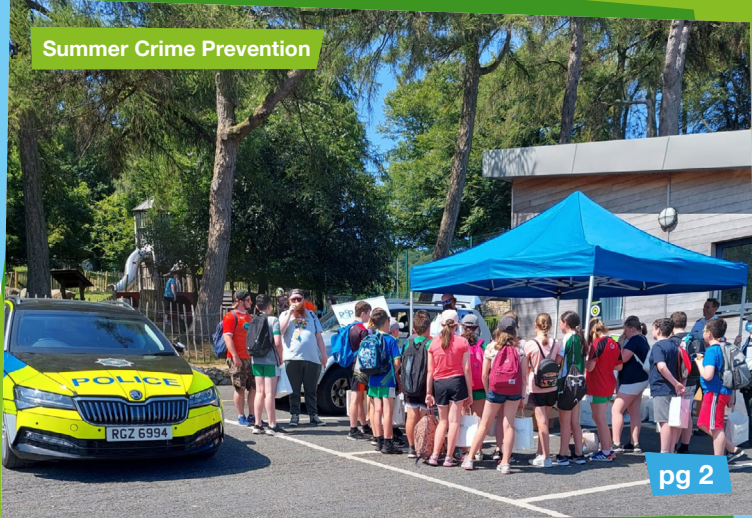
Summer Crime Prevention