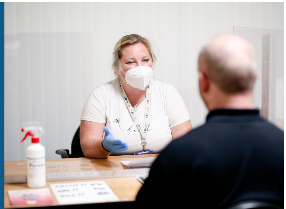
An example of COVID-style supervision

She added: "We also introduced a new screening tool, which all probation officers use to identify concerns in any case in respect of domestic violence or child protection. This tool flags up any concerns in a case at the earliest stage and enable us to put measures in to keep people safer."