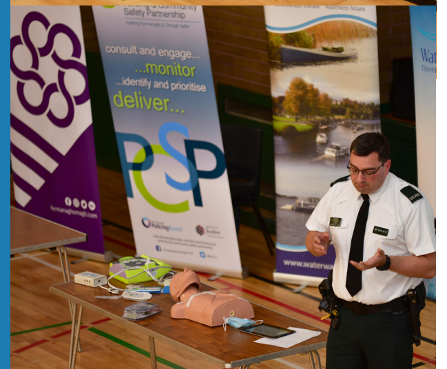
Representatives from RNLI and PSNI speaking at the event