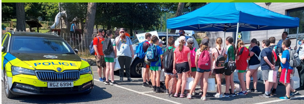
An impromptu Q&A session with PSNI and PCSP Officers and Magnet Young Adult Summer Scheme at Slieve Gullion