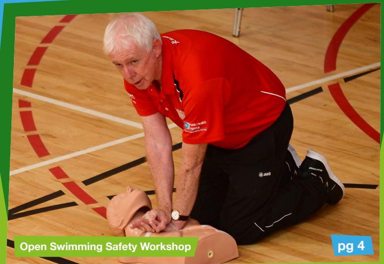
Open Swimming Safety Workshop