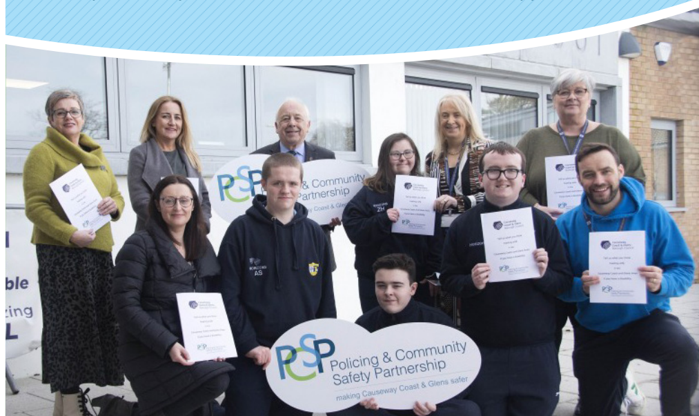
Pupils from Rossmar School join the launch of Causeway, Coast & Glens PCSP's consultation for disabled people and their carers along with representatives from the PCSP, Mencap NI and Disability Action.

Questionnaires have been developed with the support of a range of organisations, including Northern Health and Social Care Trust, Western Health and Social Care Trust, Rossmar School, Sandelford School, Mencap, Disability Action, Leonard Cheshire and Victim Support.