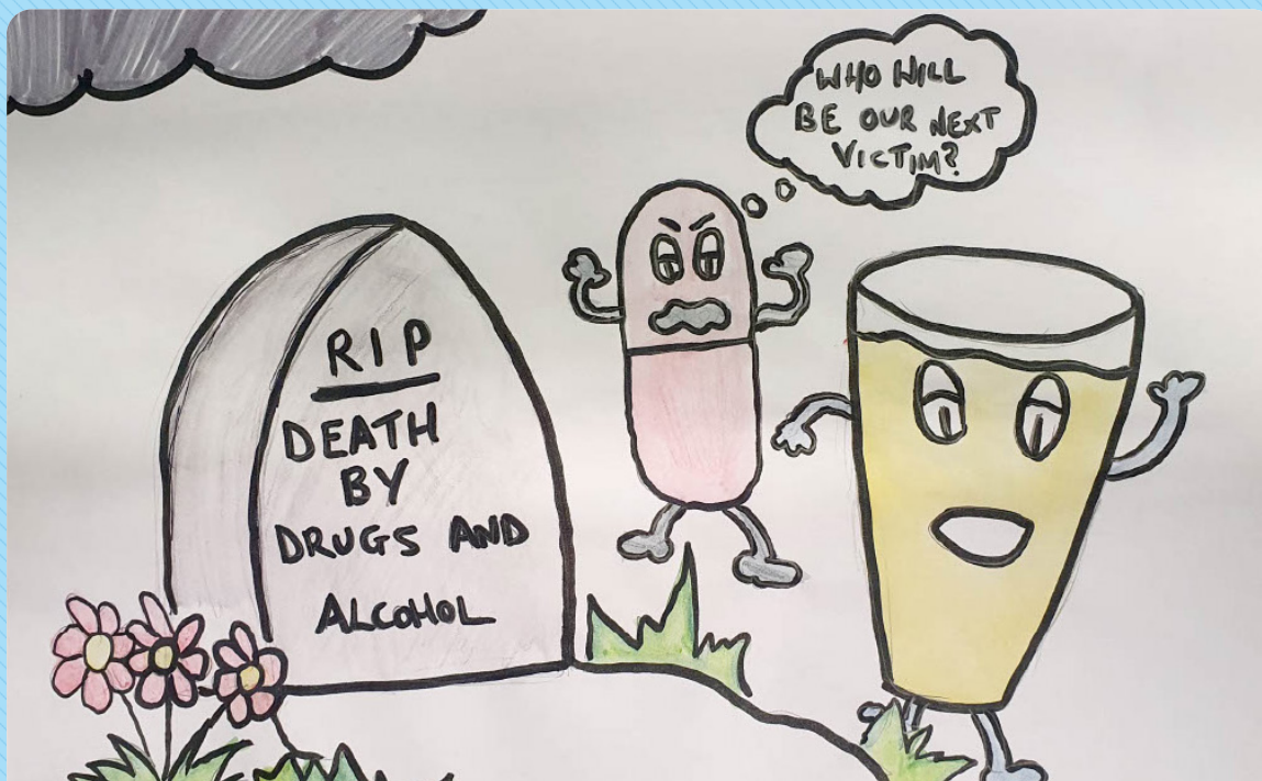
The winning poster

The competition was open to 13-18 year olds, with the winner promised a £50 voucher and every entrant receiving free cinema tickets. The poster competition was themed around the dangers, consequences and impact drugs and alcohol can have on a person, their family and friends, and the wider community.