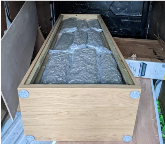
Image shows cannabis seized by officers from Organised Crime Branch

A man was arrested and later charged to Court for drug related offences