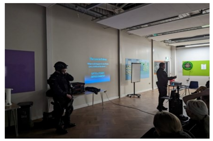
One of the engagement events

Delivered by operational officers from the Armed Response Unit (ARU) this project to educate children, specifically aims between the ages of 14-17 years old, about the dangers and consequences associated with gun and knife crime. Over the past 12 months, ARU officers have been running a series of engagement events with schools and youth clubs throughout Northern Ireland in relation to knife crime. The 'Guns and Knives Ruin Lives' project has engaged with approximately 2500 young people, many from disadvantaged communities. This project originally commenced in 2010 and has been well supported by schools, community leaders and the Board.