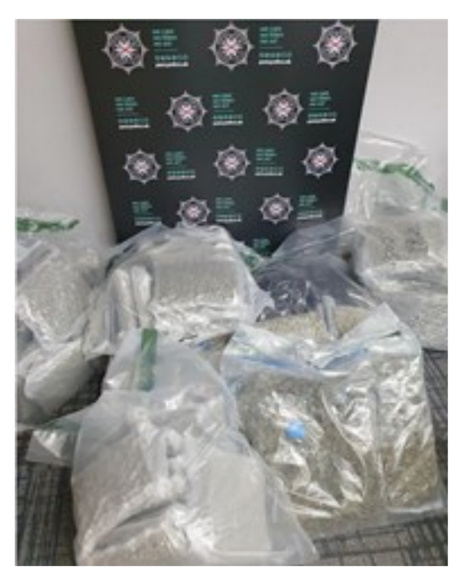
Pictured are drugs seized during the searches.

Two men, aged in their 20s and 40s, were arrested on suspicion of possession of Class B and possession of Class B with intent to supply. Both were later charged to appear at Belfast Magistrates Court.