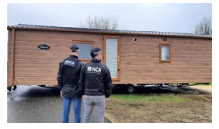
Officers seized the static dwelling from Ballyhalbert

Recovering this holiday home is an excellent result for the Paramilitary Crime Task Force, and an example of how collective efforts can disrupt the activities of paramilitary groups.