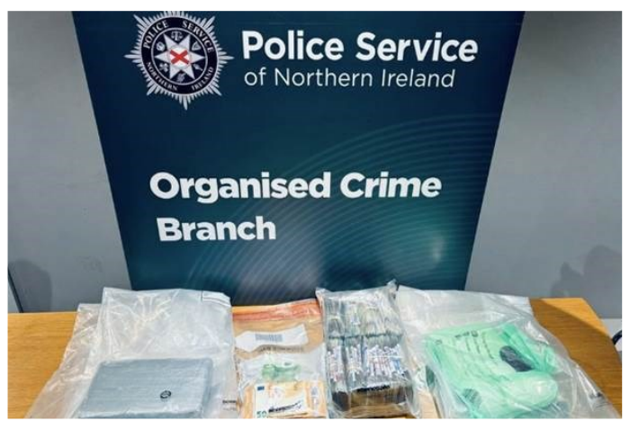
Suspected cocaine worth £200k seized alongside cash in Co Tyrone

On 19 March 2024. detectives from Organised Crime Branch made an arrest following the stop and search of a vehicle in Officers stopped a vehicle Dungannon. travelling on the Omagh Road and a search of the vehicle uncovered suspected cocaine with an estimated street value of £200,000 and cash in both Euro and Sterling with a combined total value of approximately £50,000. As a result, a 41-year-old man was arrested on suspicion of possession of a Class A controlled drug with intent to supply and possession of criminal property. He was later charged appear to at Omagh Magistrates Court.