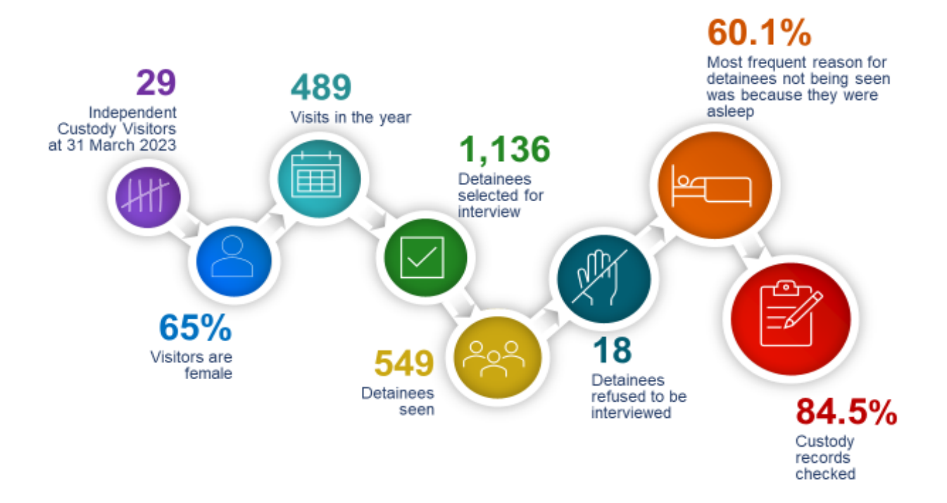
Figure 1 – Annual ICV Data Summary

This Annual Report is for the period April 2022 - March 2023 and highlights the statistical information available in relation to the Custody Visiting Scheme. It includes figures in relation to all visits, including those defined above. The report also provides information in relation to detainees in custody, the review of custody records and provides a breakdown of those detained in the Serious Crime Suite (SCS) at Musgrave Police Station (Antrim Police Station is also used as an SCS contingency suite).