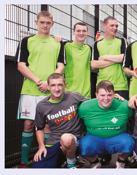
that is perhaps new or associated with a different community than their own."

"The programme will deliver storytelling workshops designed to tell the story of the sports and the origin of their clubs. The Irish FA will also work with the other two sports to deliver the Game of 3 Halves programme. This sees one game with one football, gaelic games and rugby being played in each period and encourage people to try a sport