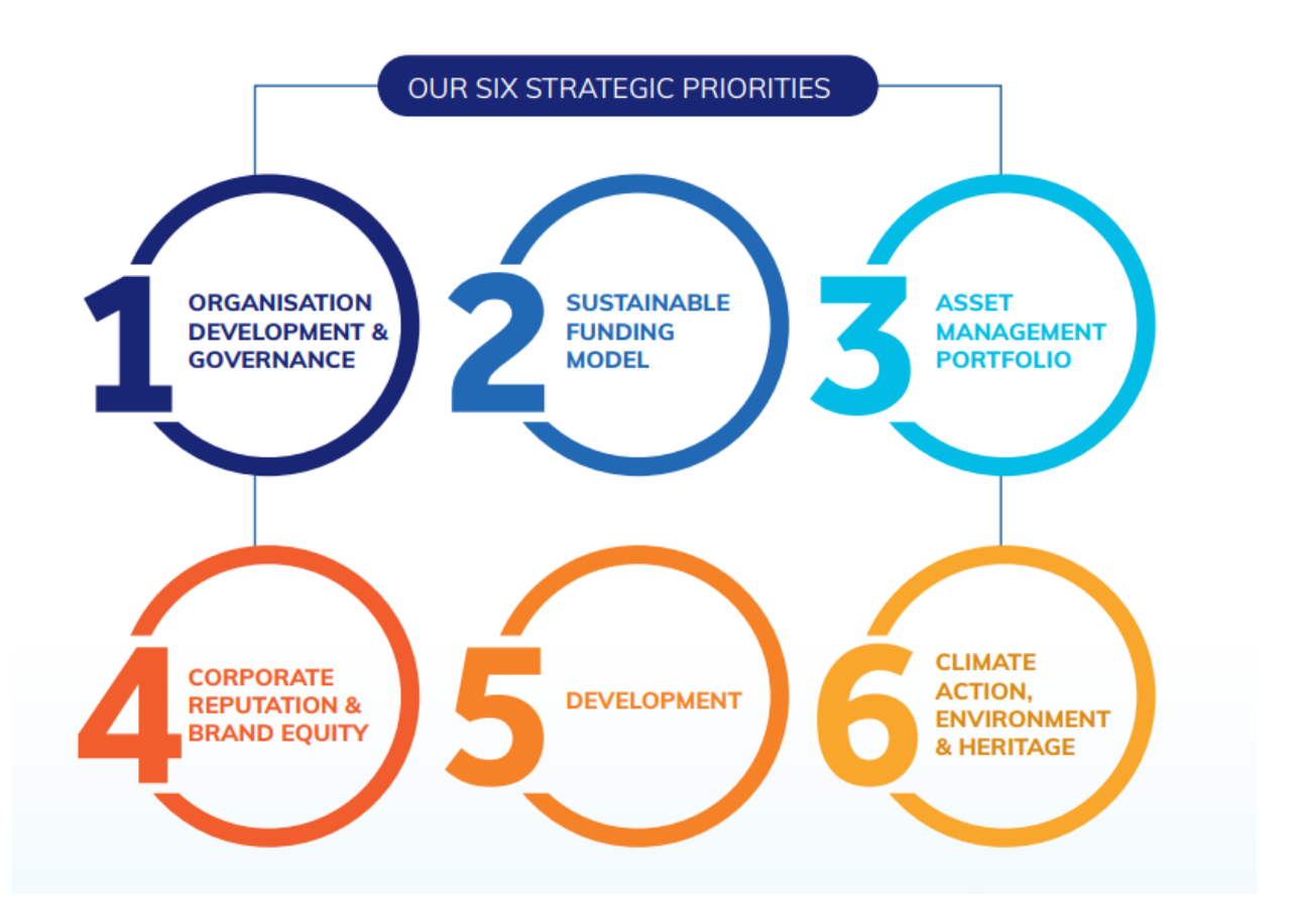
Figure 3-1 Six strategic priorities of ten-year long-term Plan

Waterways Irelands strategic priorities are the long-term aspirational priorities for the organisation over the next ten years. The six strategic priorities are shown below in Figure 3.1.