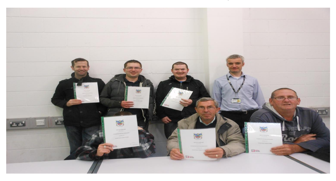
New Skills: Oil boiler service certificate recipients

This project provides additional support in education and training for neighbourhood renewal residents. It includes a bespoke programme of vocational skills and personal development training to assist young people to seek and secure employment / better employment, through participation in a training programme leading to the achievement of a nationally recognised qualification and the chance to obtain a driving licence. The project has been in place since 2012 and has continued to meet its targets (set out on pages 14 & 15).