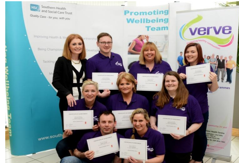
Portadown – Verve Centre Health Trainers