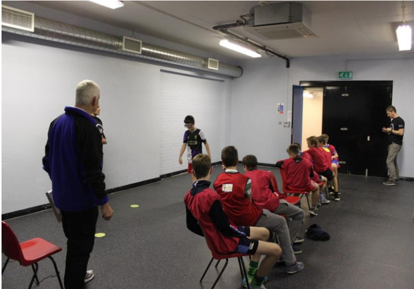
Participants on the Multi Use Games Area Olympics Event, August 2014