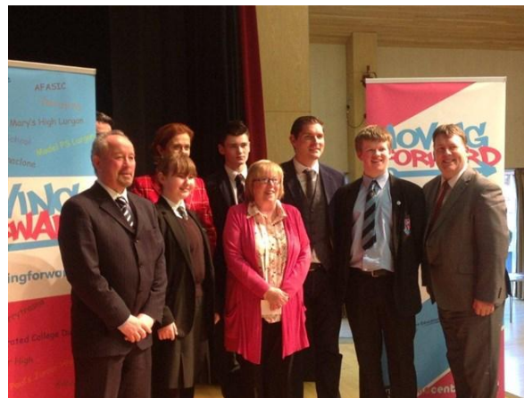
Participants from some of the schools involved in the creation of the Transitions App