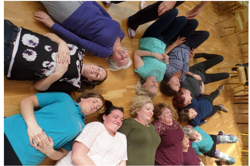
Drumcree Community Trust – relaxation group – March 2015