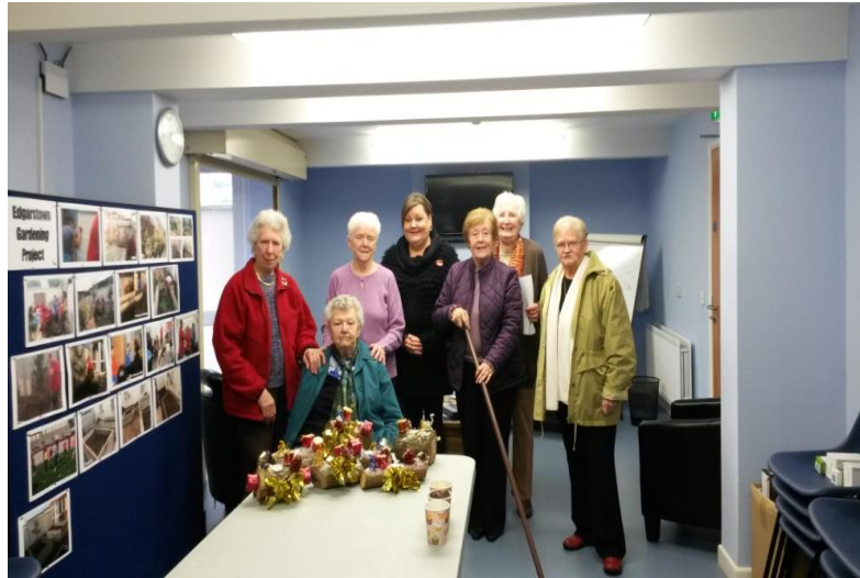
Edgarstown – Ladies Craft Group (programme funded through the Neighbourhood Renewal Promoting Health & Well Being project, delivered by the Southern Health & Social Care Trust)