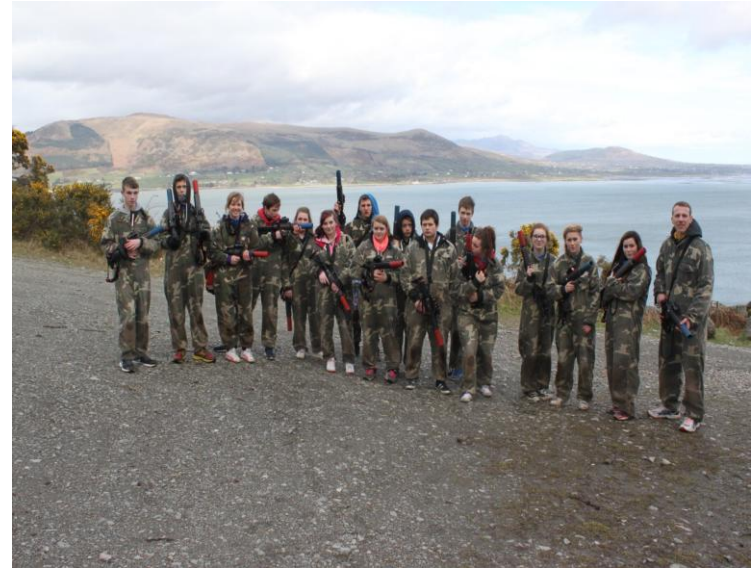
Carlingford Adventure Centre, DV8 Programme Residential, March 2015