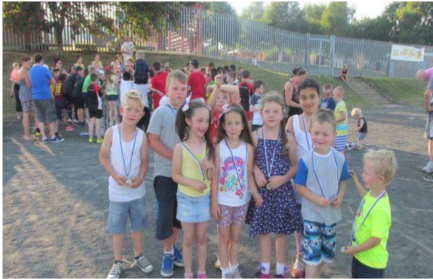
Drumcree Community Trust – mini-world cup at Ballyoran – summer scheme - July 2014