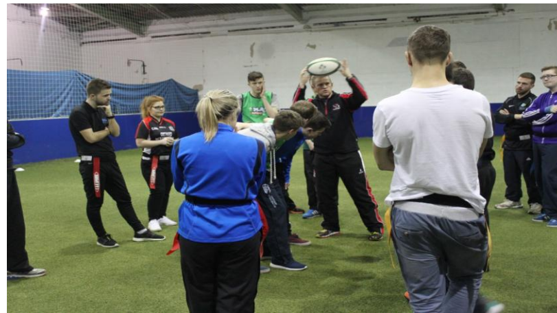
DV8 participants completing the Ulster Rugby Tag Rugby Award, February 2015