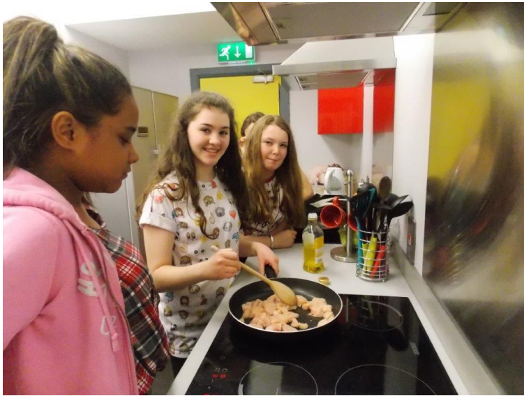
Girls participating in a Healthy Eating programme in St Mary's Youth Centre, Portadown, funded through the SELB Youth Engagement Programme.