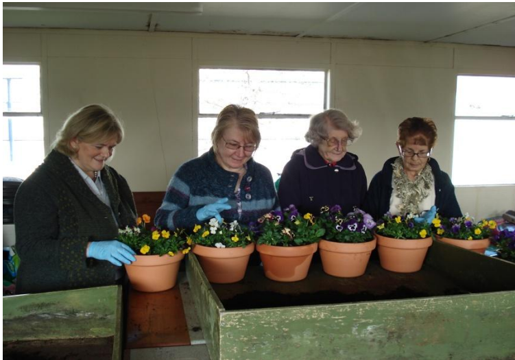
A group from Ballyoran, Portadown participating in the Grow It Project delivered by the Southern Regional College, funded by DSD Neighbourhood Renewal funding.