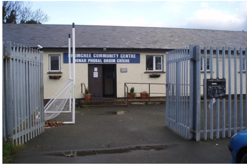
Newly refurbished Community Centre and extension to Sports Hall