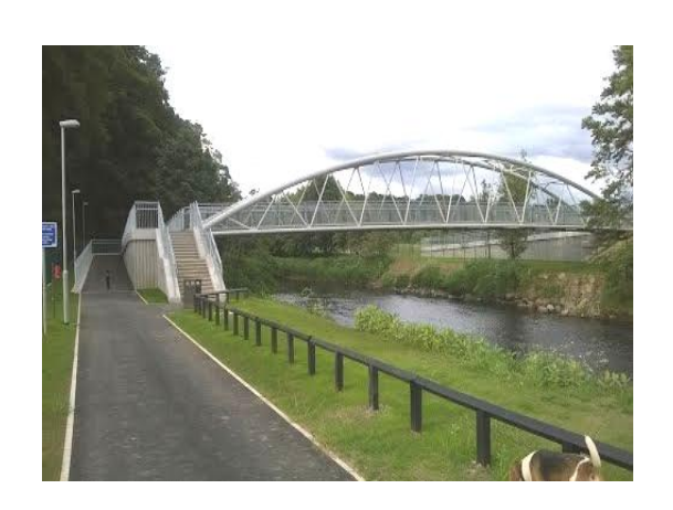
Phase 2 bridge completed in 14/15

Funding for the project was provided by the Department for Social Development through Omagh Neighbourhood Renewal and the Big Lottery Fund and was spearheaded by Omagh District Council. The 750 metre long pathway creates a connection for communities which previously required a journey around the town. The completion of this project enables a number of new initiatives to be rolled out to the residents in the Omagh area including social and physical activities such as walking clubs, opportunities for fishing and for young people to learn about nature and outdoor life.