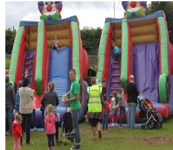
Leafair Family Fun Day