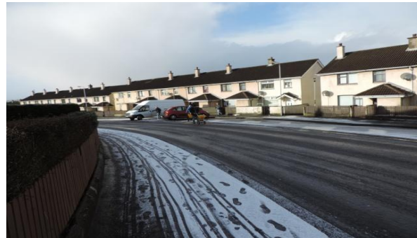
Path clearing as part of winter support