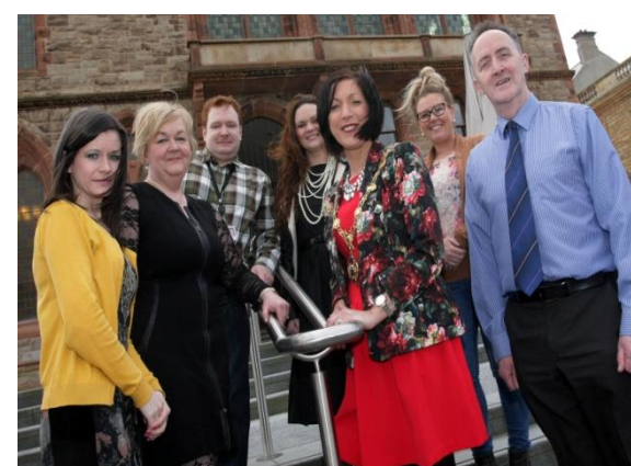
Events supported by the Community Co-ordinator and Engagement Officer for the Outer North NRA