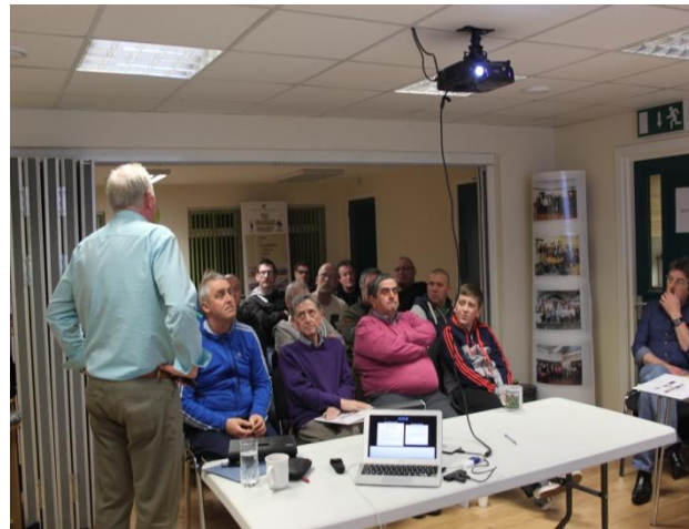
Men's Health Programme