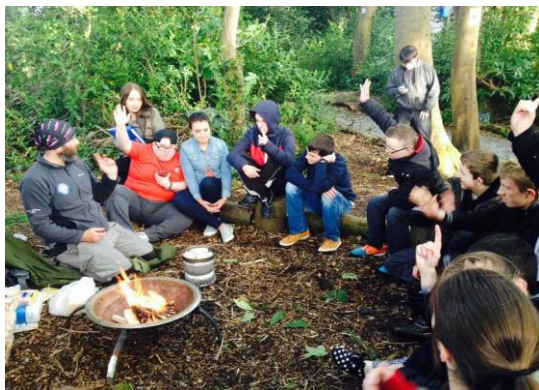
Dads and lads programme