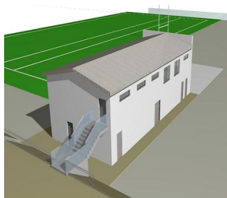
Image of the new Clubhouse