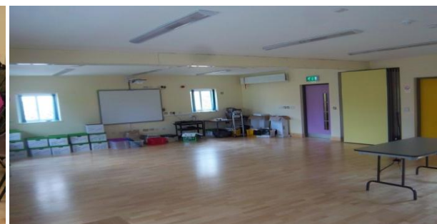
The newly refurbished Rainbow Child & Family Centre