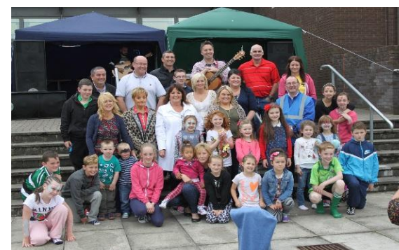
Some of the programmes delivered by Greater Shantallow Area Partnership as part of the Outer North Community Support Project