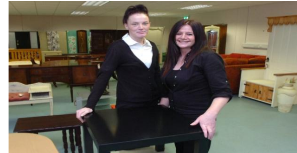
Trainees at the 4Rs