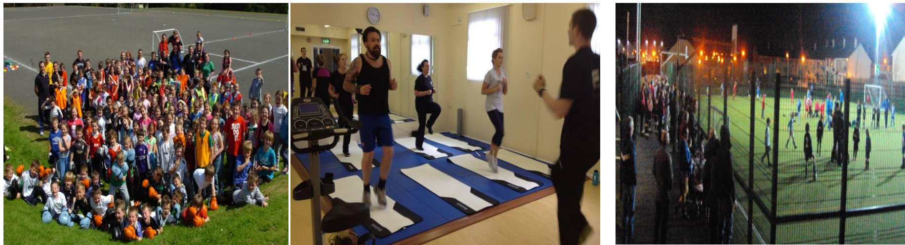
Various activities in the Outer North organised through the Active Citizenship Through Sport Project

These individuals are then supported within their local communities to establish and/or to support new or existing sport and physical activities that enable local people to participate in a range of physical activity programmes delivered by the newly accredited coaches / volunteers, increasing community involvement & community self-esteem.