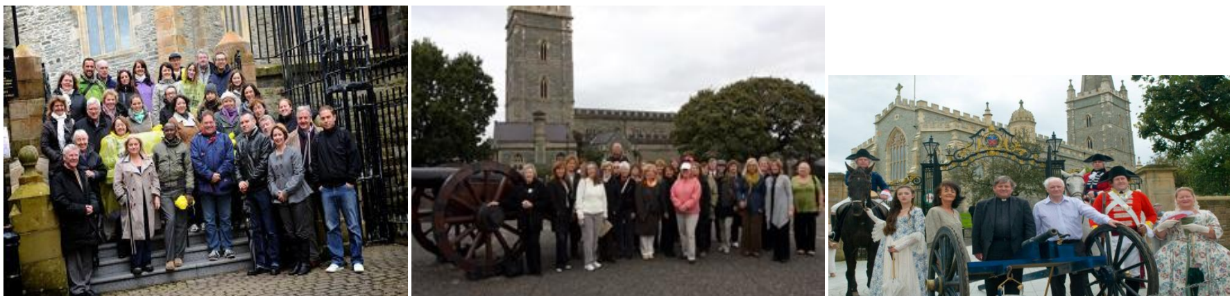
Visitors/Tourists to St Columb's Cathedral

This project provides a tourist guide service to promote St Columb's Cathedral as one of the most historic and cultural landmarks in the City, attracting local, regional and international visitors throughout the year and also offering a cultural and educational facility to local schools. St Columb's Cathedral Tourist Guides Initiative employs one full time and two part time Tourist Guides who provide a service to the local community and visitors to the City through the provision of informative tours on the educational, historical and cultural attributes of St Columb's Cathedral, a building which has played a significant part in the history and development of the City.