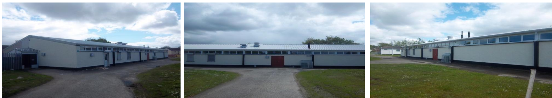
The newly refurbished St Brigid's Centre

The Centre already is a catalyst for active participation by local people. The refurbished centre will build on that activity and expand the usage of the Hall to support the delivery of programmes, activities and services to meet the needs of the community, to facilitate the demand for additional services to local families, to facilitate existing groups who presently use the centre to grow (enabling new organisations to be established, providing them with the space and support to develop their own agenda / services), to address intergenerational gaps and have a joined-up approach to services for all ages of the community. DSD Neighbourhood Renewal invested £303,246 capital funding into this project in 2014/15 with an anticipated total investment of £362,500.