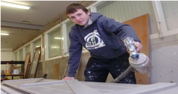
Trainee at the 4Rs

The project not only offers places to trainees interested in woodwork & painting but also offers training opportunities in administration, sales and customer services. The project works with local schools to get the message across on the benefits of re-cycling and also builds relationships with organisations such as the Foyle Down Syndrome Trust by giving placement opportunities to their clients. The 4Rs brings together 3 essential elements – Environmental (the 4Rs Reuse Workshop prolong the life of furniture and reduces the amount of waste going to landfill, thereby saving natural resources in renewing these goods and offering them for resale), Economic (the 4Rs Reuse Workshop helps reduce landfill costs on the local rate payer and produces low cost items available to public), Social (creating training opportunities and all proceeds from sales are reinvested into the 4Rs Reuse Workshop).