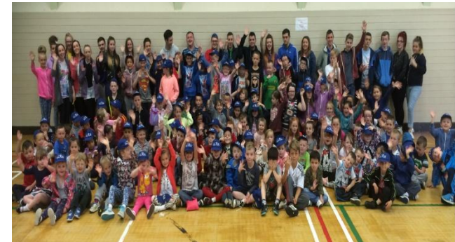
Youth Educated in Safety project