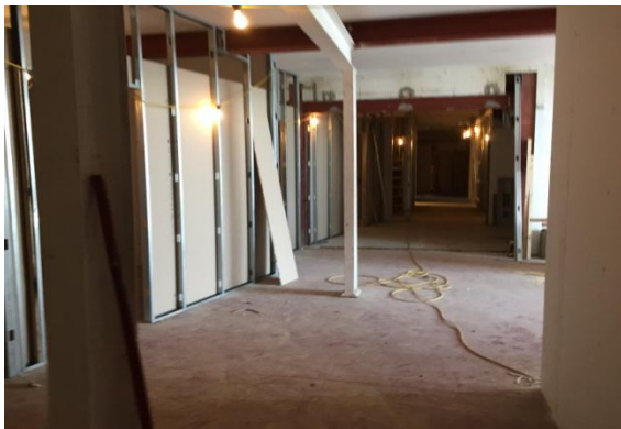
Refurbishment at Studio 2

Studio 2 is a youth and community focused arts space, located at Skeoge Industrial Estate in the heart of the Outer North area. Refurbishment will essentially see the establishment of a fit for purpose community arts facility that will service the creative needs of many artists in the area and facilitate the participation / access of approximately 1,500 local people on a weekly basis when completed (the current weekly usage is approximately 800 people per week on a range of programmes). DSD Neighbourhood Renewal invested £14,056 into this project in 2014/15 with an anticipated total investment of £212,500.