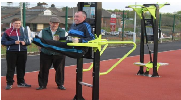
Mens Health Group at the Outdoor Gym

Health inequalities / poor health have been a fact of life in this and other disadvantaged communities for decades. The project has assisted in addressing actions within the Neighbourhood Action Plan by targeting issues linked to identified needs, the recent focus within the local action plan has been :- Mental Health & Emotional Wellbeing (self-esteem & health improvement targeting young women); MOT health checks; Mental Health Information sessions; Physical Health (men's health group; physical activity programmes targeting older people, children & women, gym and swim); Grow Your Own (Hobby Gardening); Healthy Eating (programmes for teens, parents & children, men's health programme); Alcohol & Drugs Harm Reduction; Winter Health Programme (older people / vulnerable people safe in home and signposting services, winter packs, volunteering services); Cancer Prevention (Action Cancer Big Bus etc...); Smoking Prevention (cessation & awareness programmes.); Cardiac – purchase of defibrillators, training programmes.