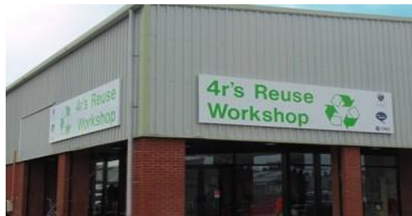
The 4Rs Workshop