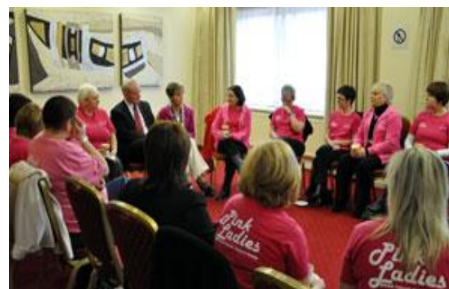
The Pink Ladies Community Cancer Support Group promoting their campaigns.