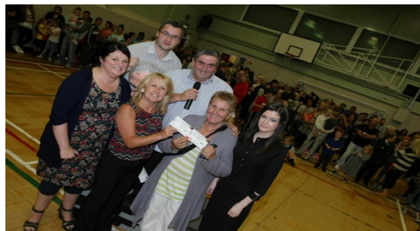
Strategy Manager in attendance at a number of events in the Outer North NRA