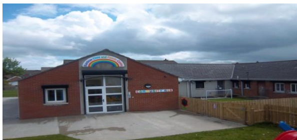
The Rainbow Child & Family Centre extension

These programmes and services will complement and extend the services that are currently being delivered from the Centre. DSD Neighbourhood Renewal invested £ 338,126 capital funding into this project in 2014/15.