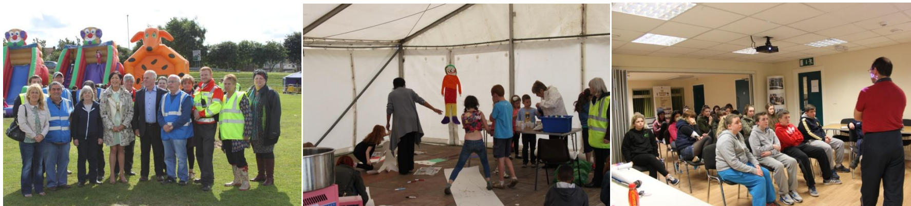
Events in the Outer North NRA supported by Community Restorative Justice

The CRJ mediation service helps resolve all types of neighbourhood disputes, seeks resolutions to youth related issues by employing intervention, preventive and diversionary methods or/and by signposting some of the young people to the outreach workers and other youth providers. CRJ supports victims of crime and help them make their homes securer through the Lock Out Scheme. CRJ provides a service for people with drug addictions and signpost them to the relevant organisations. The Outer North Coordinator sits on a number of Strategic and local Addiction forums, is represented on the PCSP and in tandem with the CRJ Chairperson, is involved in a number of local initiatives such as Festival at Moss Park, GSAP, Off the Streets' Initiative, Teamworks, Alternatives to Bonfires' Strategic Working Group and have dealt with other issues e.g. around the misuse of quads and fireworks, Winter Health Programme, attacks on the buses, anti-community activity in local tunnel.