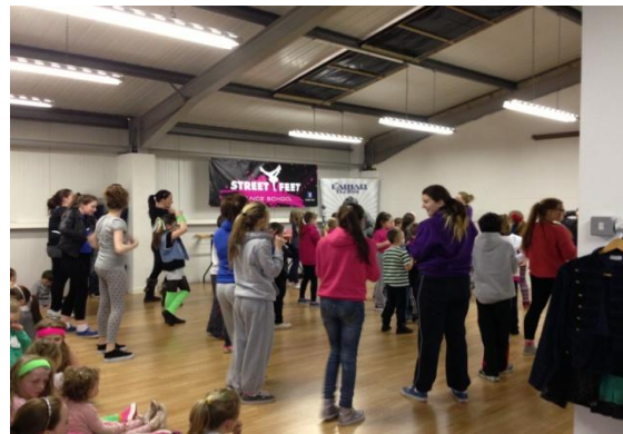
Dance class at Studio 2