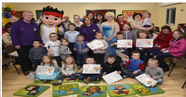
An event at the new centre