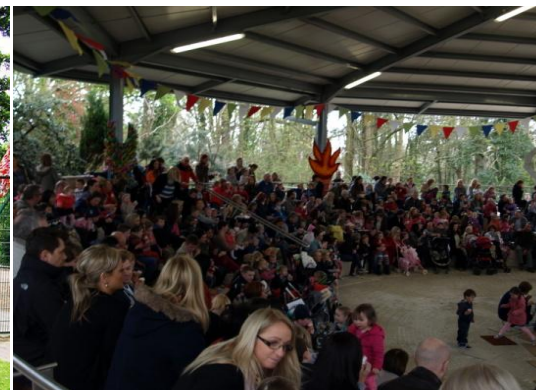
Cinema at the Playtrail