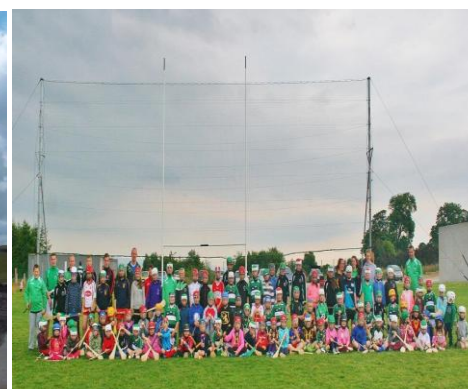
Training at Na Magha