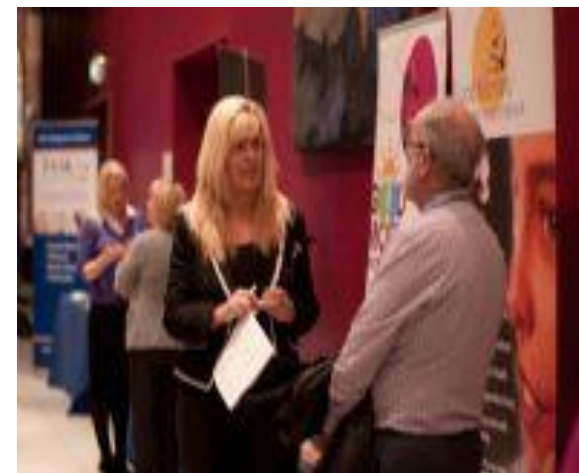
Examples of support and advice provided by the Good Morning North West service