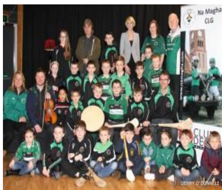
Na Magha music event

This project is the construction of Na Magha's new two storey clubhouse and changing rooms within the existing Páirc Na Magha in Ballyarnett Country Park. Funding approved by DSD, DCAL and Derry City Council has enabled the building of the pavilion which will further consolidate and strengthen the club into what should be an exciting and successful future. The facilities will provide a great opportunity for young people from the area to participate in sport, leading to improved social inclusion, healthier lifestyles and the strengthening of club links within the community. Additional enhancement works are planned to secure a banner-rail fence around the main pitch, upgrade of the practice pitch and floodlighting. Department for Social Development invested £507,189, with DCAL and Derry City and Strabane District Council both investing £50,000 each.