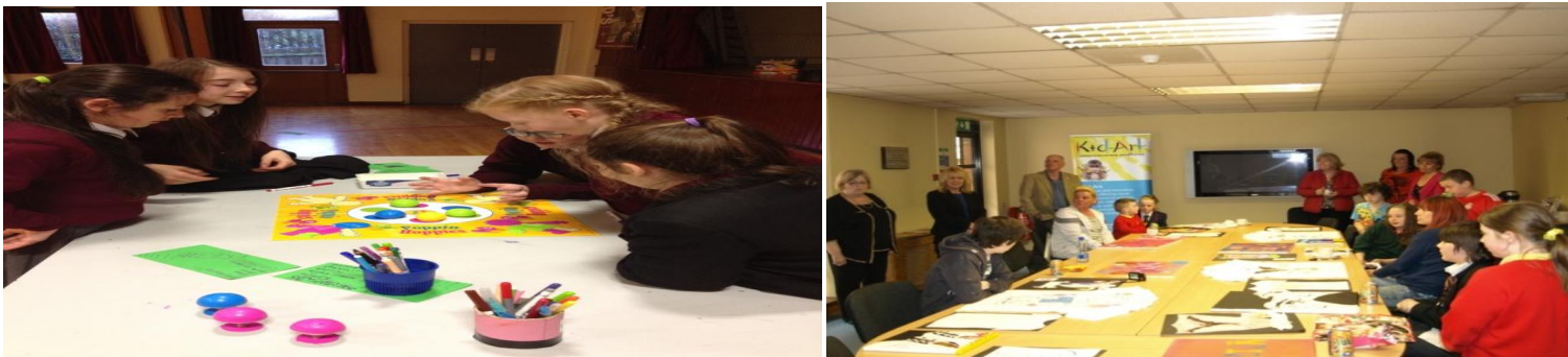
Support provided by the ETHOS Project

The collaborative working has led to the establishment of a family support hub that is recognised [within both the Statutory and C&V sectors] as a first point of contact for vulnerable families / individual family members within the Outer North. The project recognises that families with complex needs require the input of several disciplines in a coordinated approach to their support. The project focuses on the need for effective and responsive support that targets the whole family with an approach that is practical and localised. It develops parenting skills around general lifestyle choices and habits e.g. coping mechanisms, valuing education, healthy eating and physical activity.