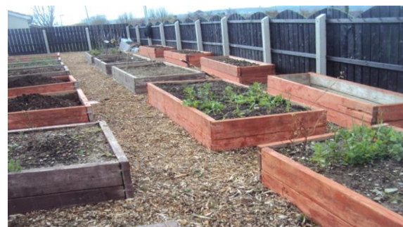
Grow Your Own Project in the Outer North