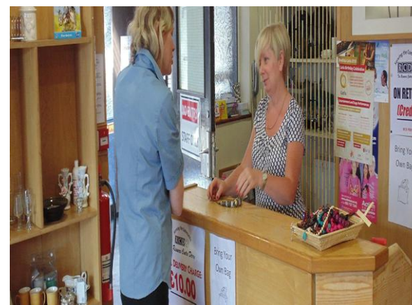
Various support services available at the Resource Centre Derry