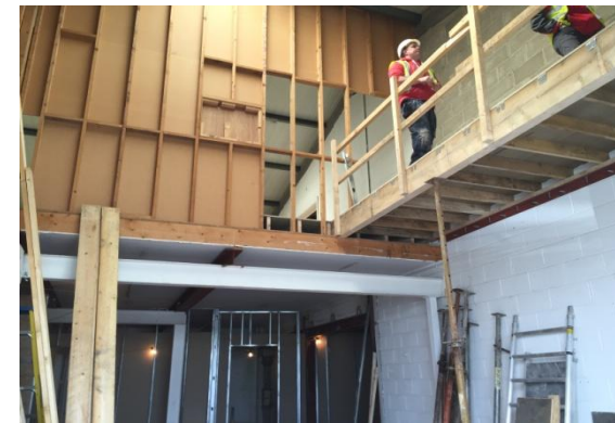
Refurbishment at Studio 2