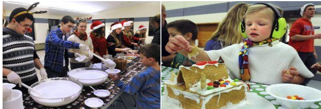
Some of the activities provided by Gingerbread NI

Gingerbread's services are targeted and support one parent families - the One Plus Centre offers a wide range of tailored, free services which provide a high level of support for one parent families in the City and surrounding areas – such as employability programmes which support lone parents to return to work and a professional & confidential advice service provided through a free phone help line, offering assistance with everything from dealing with relationship breakdown and managing debt to sorting out housing problems, returning to work and better off calculations. An on-site crèche is free for lone parents using the Centre's services, providing much needed respite childcare for vulnerable families. There are currently 30 families in the Outer North area who use this service. The One Plus Centre offers free membership to all lone parents in the area and a range of member services such as newsletters, regular mailings and the opportunity to get involved in consultation about matters important to one parent families. There are currently 45 lone parents from Outer North area who are members of the organisation.