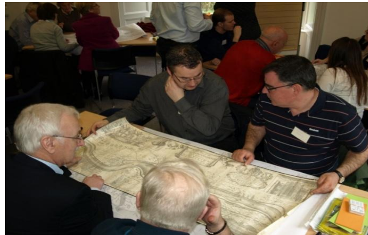
Ongoing collaboration regarding Community Capacity

On foot of a recent strategic review of all its community centres and assets, DCC identified 3 areas within the city as particularly deficient in terms of community centre provision – Galliagh being one. As part of DCC’s commitment to meaningful community / user involvement in the long term strategic approach of community centre provision, the focus of this project was to provide a dedicated financial support stream to facilitate a distinct service level agreement (SLA) being drawn up for the Galliagh area. The Greater Shantallow Area Partnership (GSAP) facilitated a process which supports existing Galliagh C&V groups whilst awaiting the development of a new council led community centre. Eight groups received support for the completion of new [organisational] Strategic Plans, a process assisted by Education Matters Consultancy. Five groups also received £3,000 each to assist with core costs to enable them to run a range of activities in the Galliagh area.