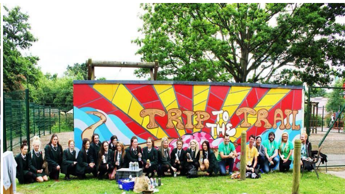
Trip to the Trail