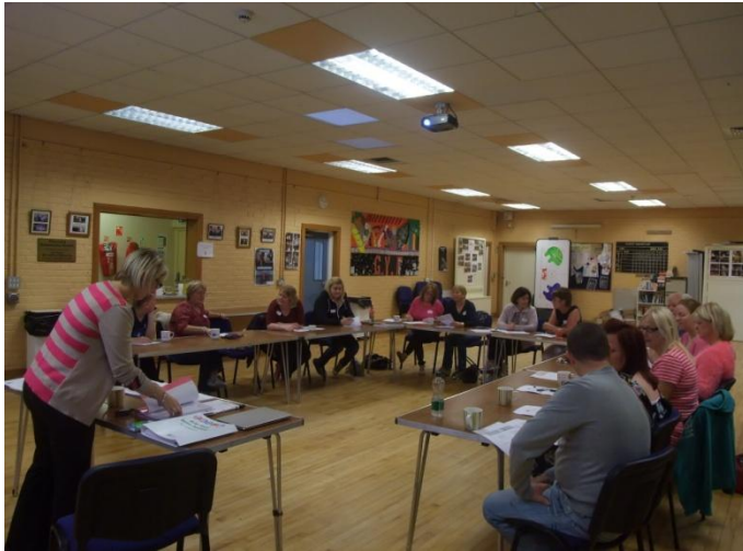
Food Hygiene Course