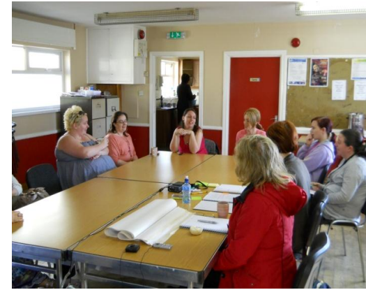
Parents Education Programme