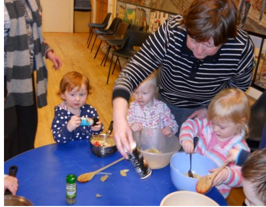
Lifestart At Schools Programme