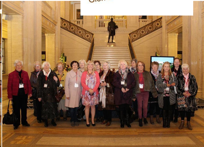
GDI Women's Groups visit to Stormont