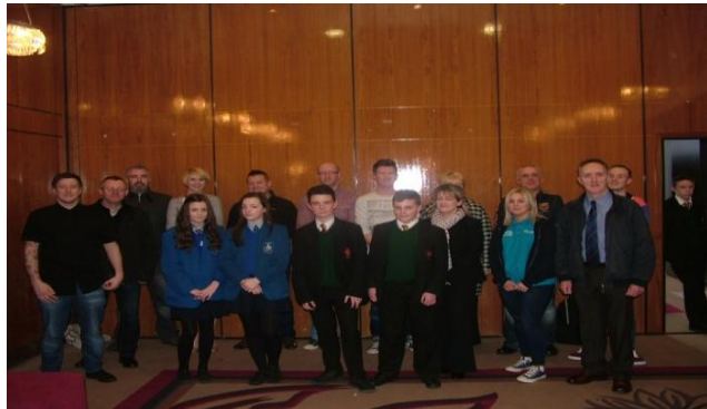
Outer West Youth Conference attendance.

The project also encourages young people to develop personally and socially with the aim of guiding them away from anti social behaviour and towards entering volunteering and training development opportunities leading to increase in labour market opportunities and to develop as individuals so they become involved in community life in a much more constructive and positive way. (The project is 100% funded by NWDO)