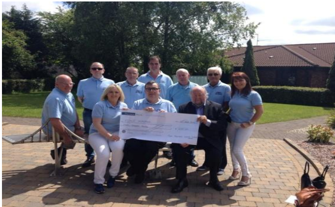
The Pink Panthers donating money to Foyle Hospice raised from Movember.

The Pink Ladies is a relatively new project that has already established itself within the Neighbourhood Renewal Area becoming the go-to service for cancer support and prevention services. The project is represented on the Health Working Group and has contributed to the action planning process.