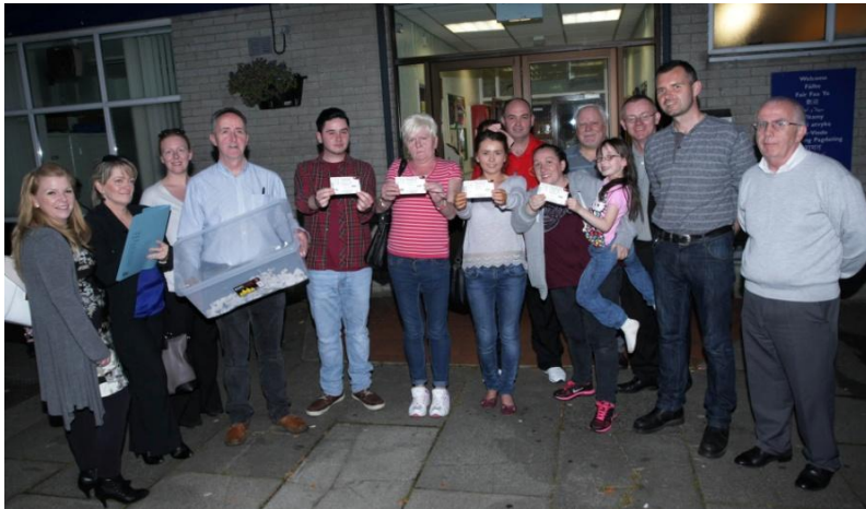
MTV Crashes Ticket winners from Outer West

The project was developed by the 4 Neighbourhood Partnership Boards (NPB) and Culture Company and approved by DSD at the end of February 2013. This project built capacity and maximised participation and community engagement by providing a continuing support structure that assisted local communities to access the myriad of opportunities that City of Culture legacy presented - sourcing funding, training and skills development, job creation, community-based tourism, partnership building, showcasing creative talent, volunteering, engaging young people in activities that combat anti-social behaviour etc.... and to further develop this support structure into the future. Foundations have been built to realise significant benefits across social and economic renewal targets, but primarily community renewal priorities identified in the Neighbourhood Action Plans.