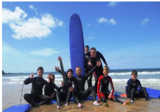
Youth Diversionary event