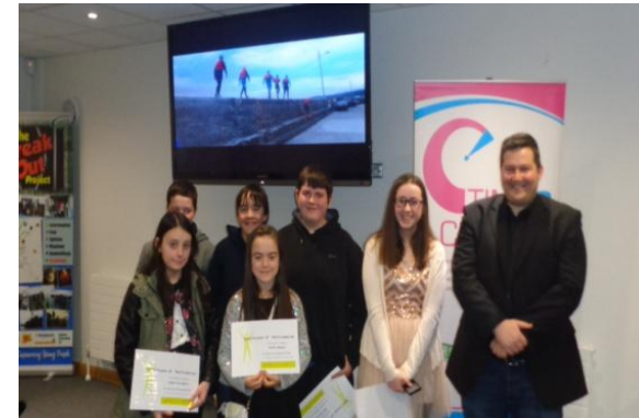
Rosemount Youth Creative Event