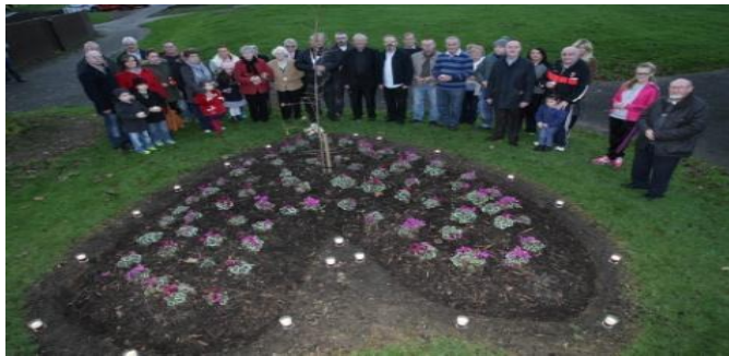
Memorial Tree Planting