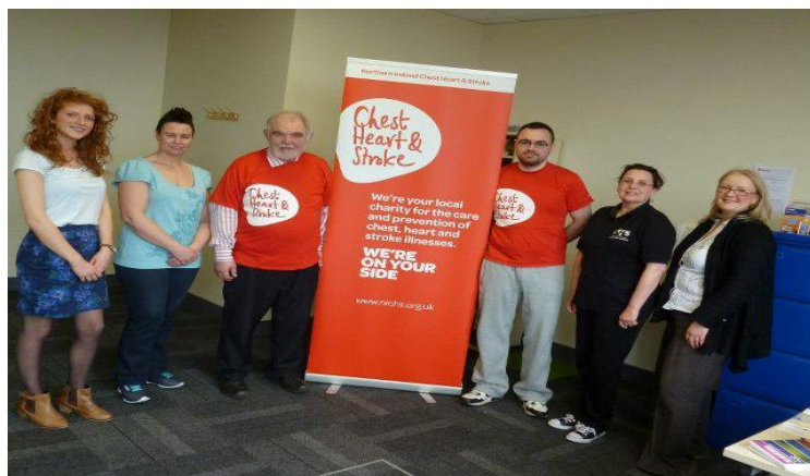
Chest Heart & Stroke Seminar/Session

The Neighbourhood Health Improvement Project has made a positive impact in the Neighbourhood Renewal Area supporting and developing existing work in the area. However it is felt that some consideration needs to be given to the delivery model. The development of a NHIP Health Action Plan in the area has allowed groups to identify local need and gaps in current service provision and tailor service delivery to meet need. The project has assisted in addressing actions within the Neighbourhood Action Plan under Community Renewal, Social Renewal and Physical Renewal.