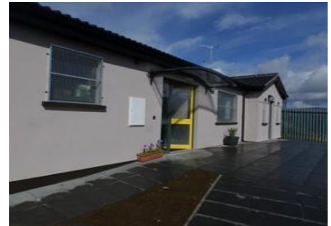
New Dunluce Family Centre building in the Outer West NRA funded by DSD