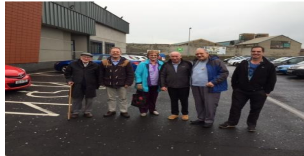
Residents Trip to Bowling Alley