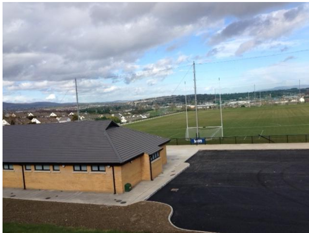
New Doire Colmcille Gaelic pitch/Changing rooms in the Outer West NRA part funded by DSD