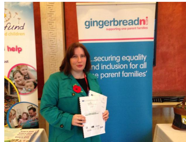
Gingerbread NI awareness events.