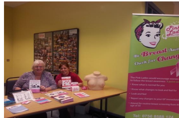
The Pink Ladies 'No Smoking' Campaign