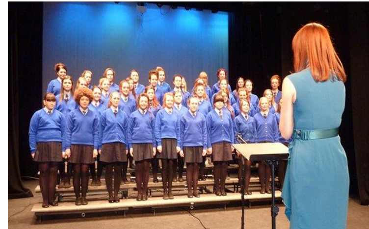
St Marys School Choir who took part in Choir of the Year