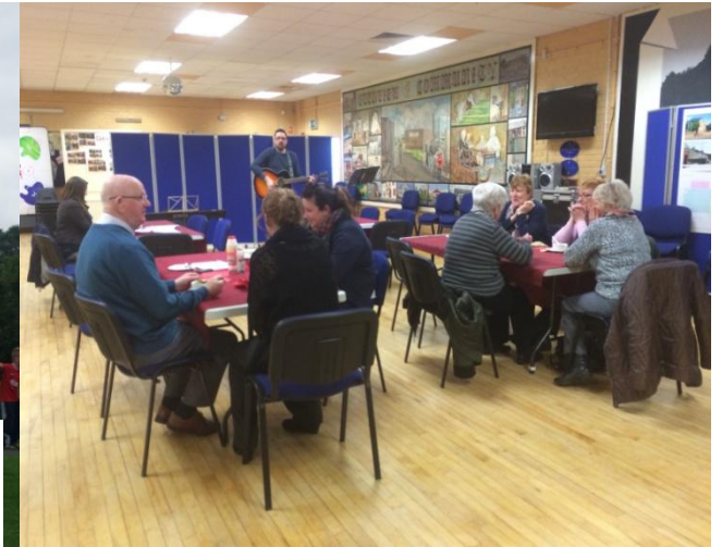
GDI Older Generations Social Event