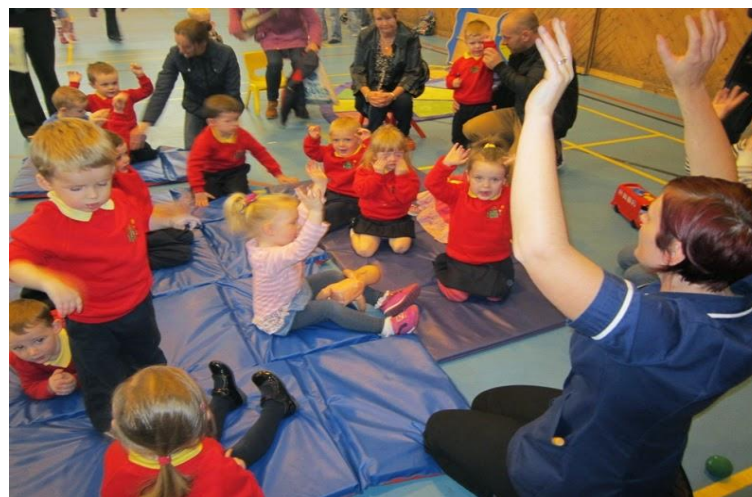
Community library activities

With the employment of a Full time Library Administrator this will continue to allow the Community library to open during the day and evenings as well as all day Friday and Saturday. This will facilitate residents of all ages from within the Outer West Area to avail of the educational services provided through this easily accessible and well-located building.