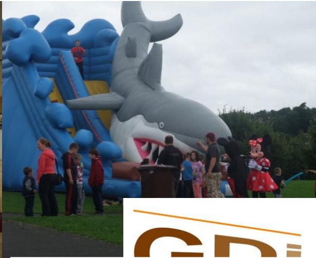
Family Fun Day