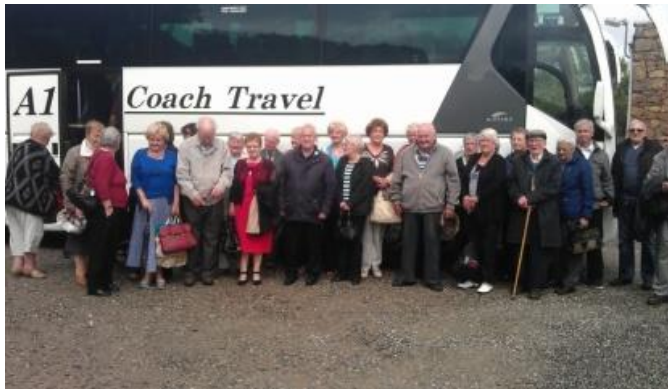
Older Peoples Bus Trip to Leos Tavern