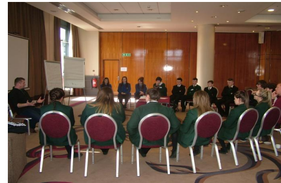
Youth conference Breakdown group sessions