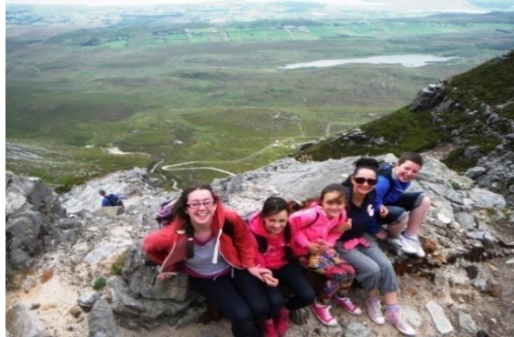
Youth Group Muckish Climb