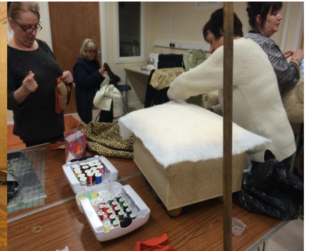
GDI Women's Quilting Group