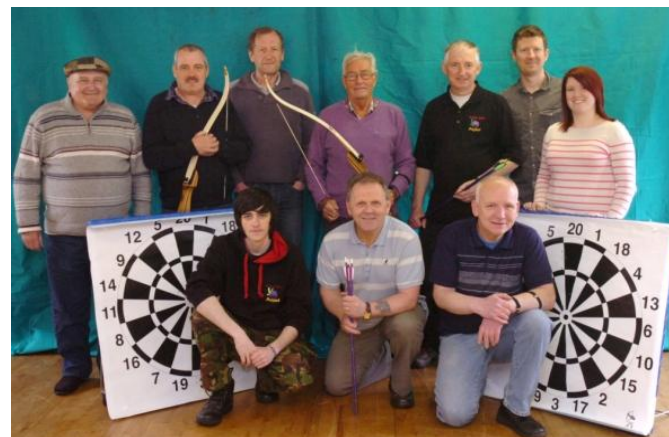
Mens Group Archery Session