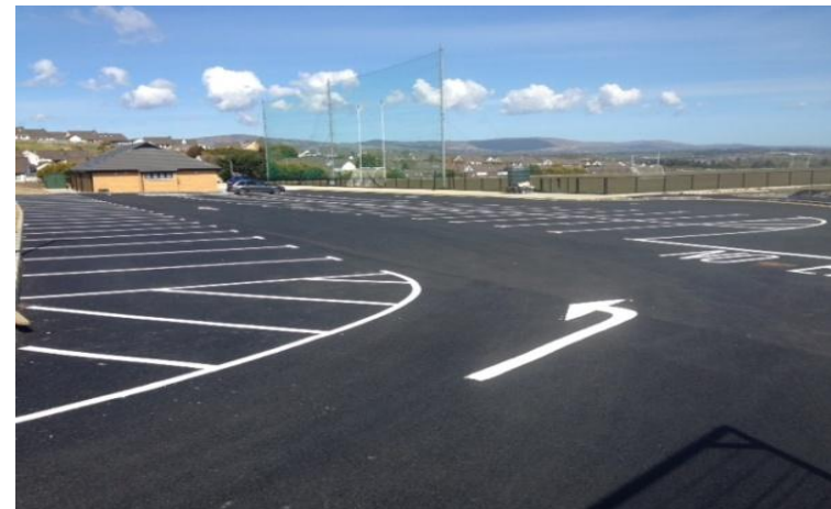
Photos of new changing facility building and view of surrounding car park.