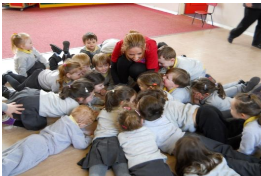
Dance & Movement Workshop