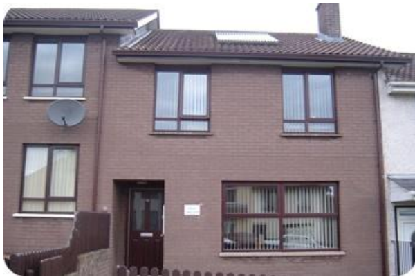
Old Dunluce Family Centre

See below pictures of Dunluce Family Centre and examples of services and activities provided through this Project: