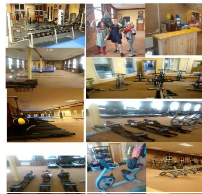
New Fitness Factory Community Gym, Rosemount in the Outer West NRA funded by DSD