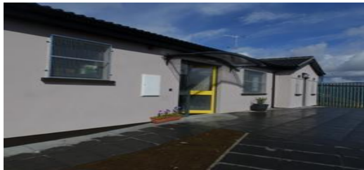
Dunluce Family Centre – New building