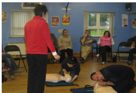
First Aid Classes