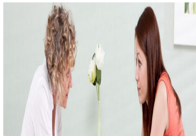
Counselling and Complementary Therapies