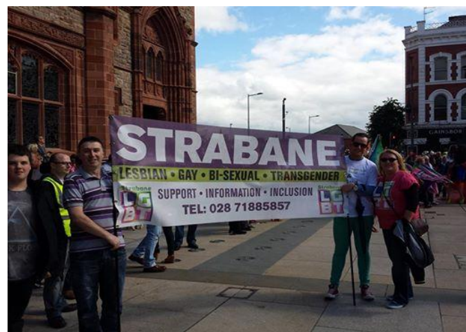
Foyle Pride Parade