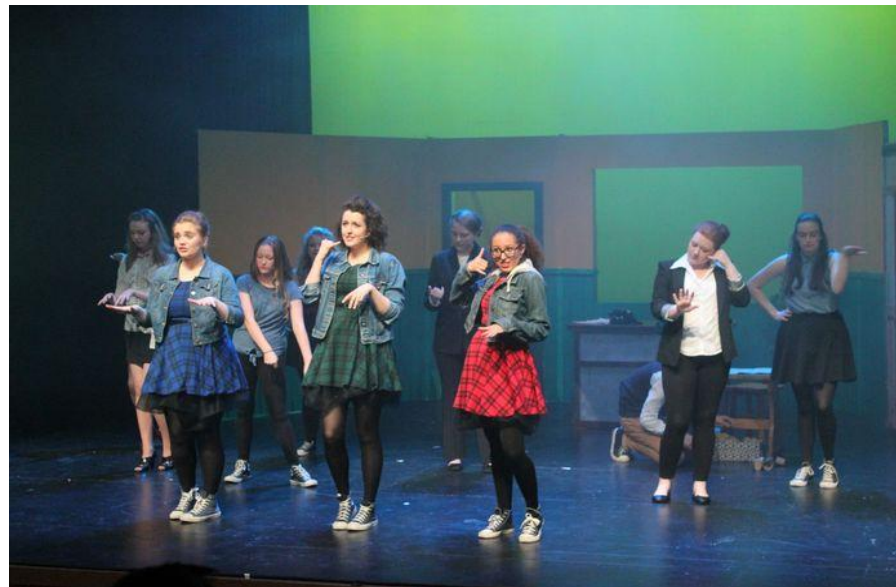
Theatre & Performance Skills