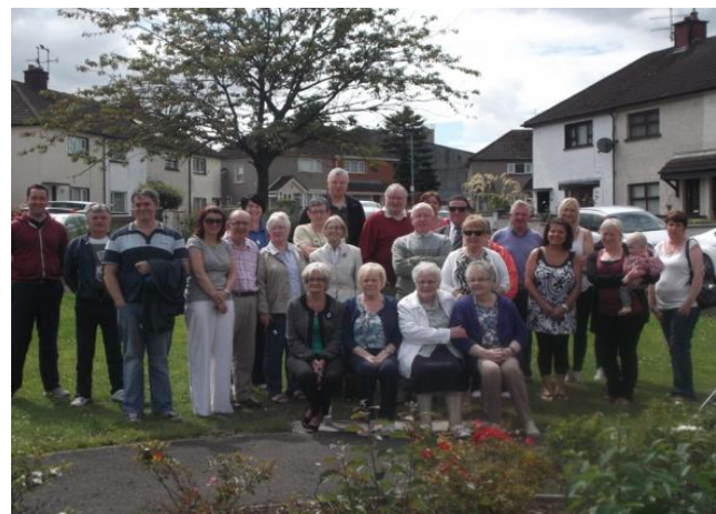
Celebrating the Installation of a Memorial Bench