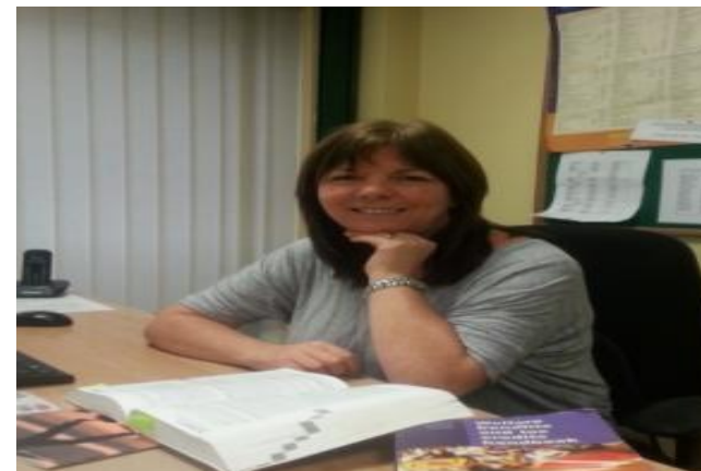
Strabane CAB – Generalist Advisers