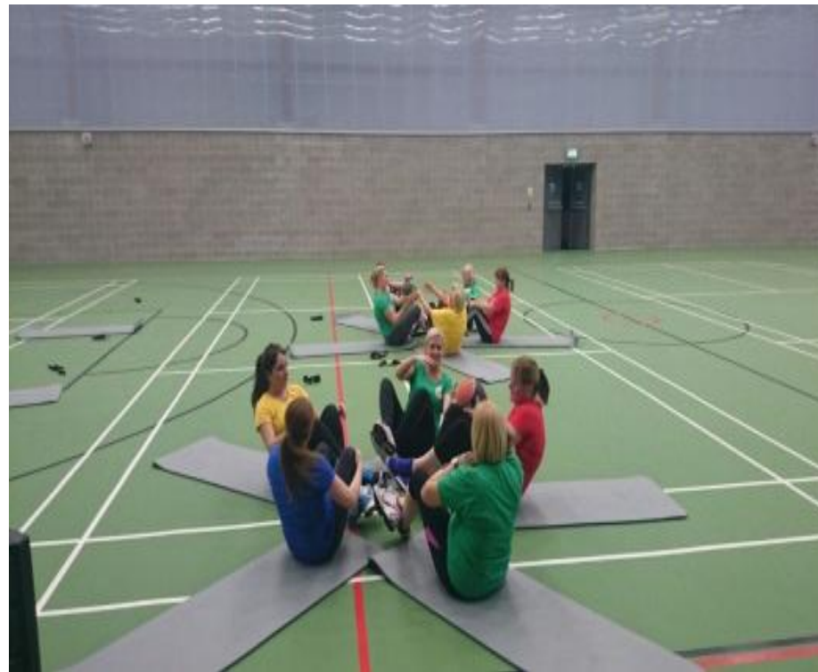
Biggest Loser Programme