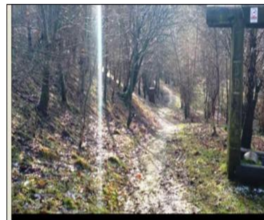
'Burn Walk' Outdoor Education Park