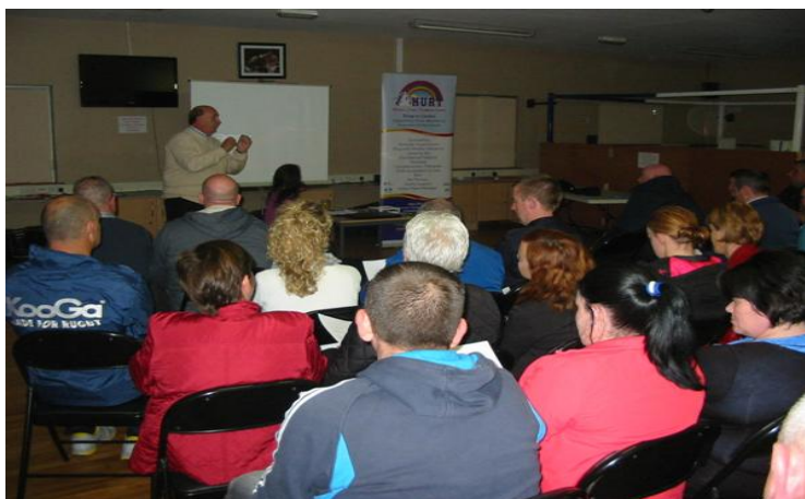
Misuse of Prescription Drugs Workshop