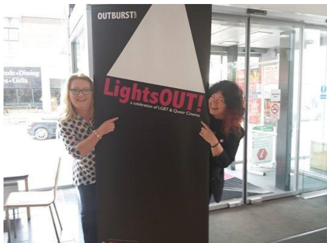
Launch of 'Gay Best Friend', Community Relations Week