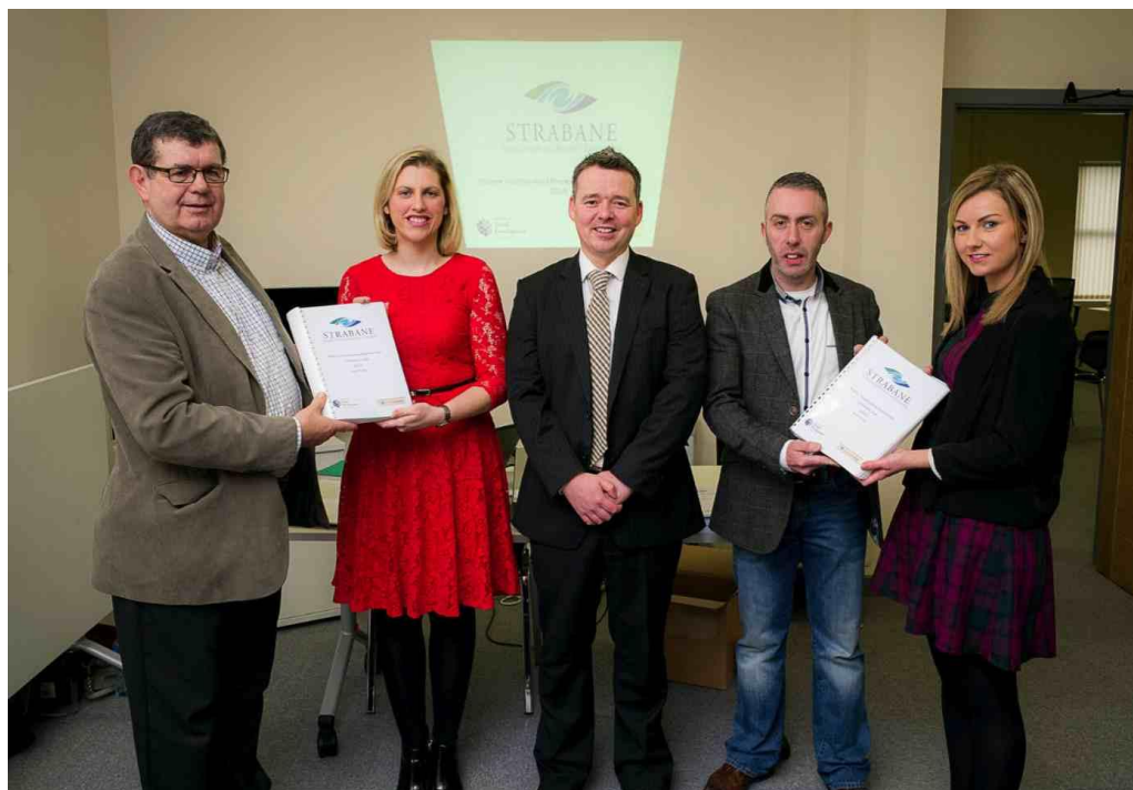
Official Launch of the Strabane NRA Community Audit, January 2015.

Strabane District Caring Services was appointed as the lead organisation to carry out a community audit for the Strabane Neighbourhood Renewal Area (NRA). The project took nine months to complete and sought to update information across five key renewal themes – community, economic, health, physical and social renewal. A total of thirty volunteer peer researchers were recruited and trained to carry out the door to door questionnaires and 660 households (out of 2,400) were surveyed