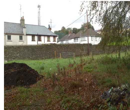
Premises and green space that will shortly be developed into a new Community facility and allotments