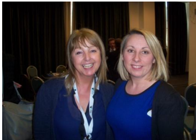
Criminal Justice Support Worker and colleague