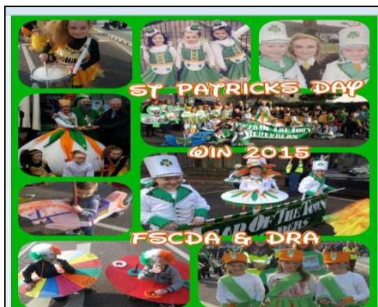
St Patrick's Day Parade

The community centre delivers social and recreational activities such as bingo, local community fun days, senior citizen's lunch etc.