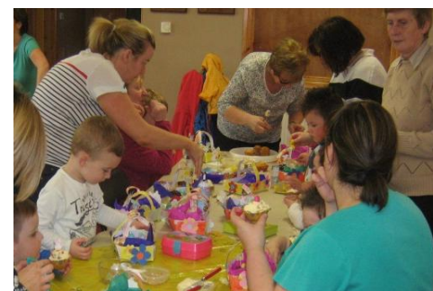
Play & Stay Club