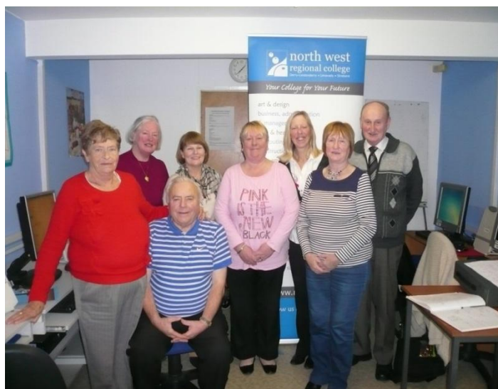
Successful ICT and Essential Skills Students