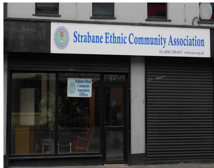
SECA's new town centre premises