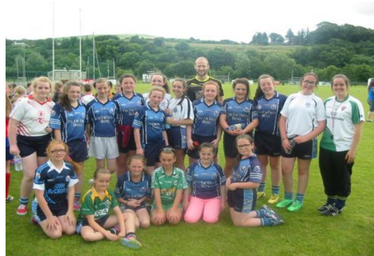
Summer Coaching Camp at Sigerson's GAA