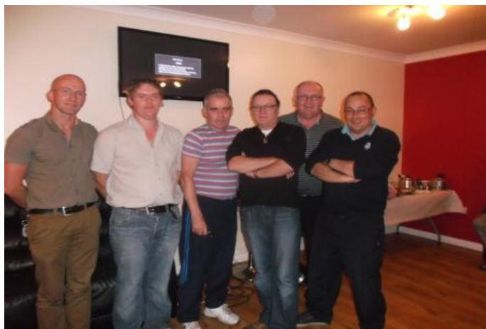
Social Justice Project