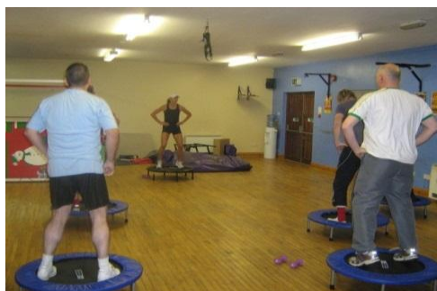
Physical Activity Programmes