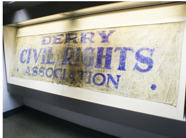
An Exhibition from The Museum of Free Derry

The aim of the project is, through a non-profit social economy initiative, to provide a focal point for visitors to the Triax area from what was a previously derelict building into a flagship building with education and meeting facilities that will be of use to the entire community. It is a central part of the tourism product in the area and it also helps stimulate and sustain employment in related projects and local small businesses. The museum encourages reconciliation through fostering greater understanding, acknowledgment and acceptance of the different perceptions and experiences of different communities by tackling the ongoing social problems that pertain to the area such as sectarianism and trouble at interfaces by educating people about the root causes and highlighting the consequences.