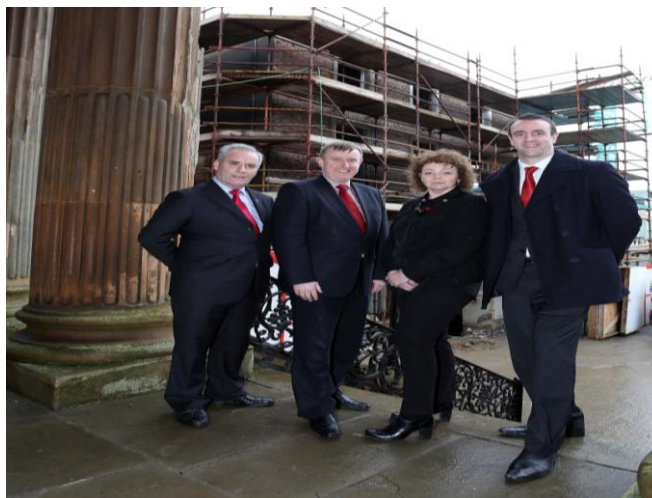
Ministerial Visit during construction

This capital project was delivered as a result of Departmental Partnership support from DSD, DCAL and DOE.