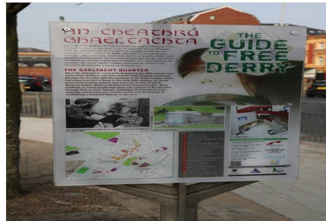
Signage in the Irish Language

The aim of the project is to establish a vibrant Gaeltacht Quarter, focused on economic regeneration, cultural tourism, environmental awareness and healthy living with the Triax ~ Cityside Neighbourhood Renewal Area and in particular within the Bogside and Brandywell area of Derry. The Gaeltacht Quarter project will promote this geographical area rich in Irish language and cultural activities by promoting Irish language, festivals showcasing performance arts, fine art, craftworks, poetry, traditional, contemporary and ethnic-diverse music alongside cultural heritage tours and awareness exercises.