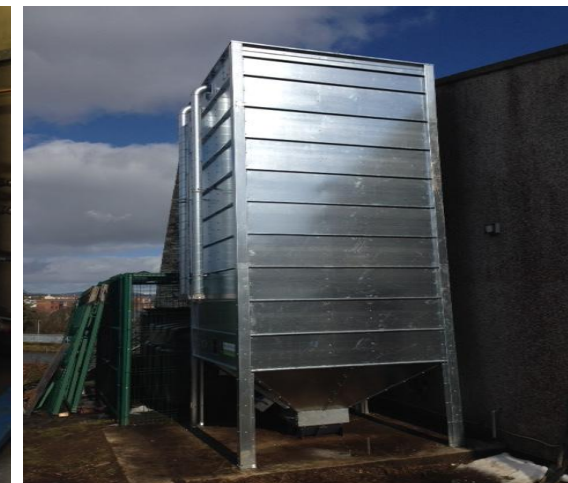
Upgraded Heating System