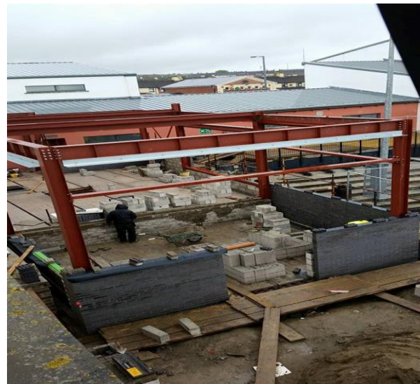
Extension Work to Existing Building.

The Old Library Trust received Neighbourhood Renewal Capital Funding to build an extension to the existing building providing a new Health & Wellbeing Suite for excluded and marginalized groups. The construction is due to complete mid 2015. This new wellbeing suite will bring substantial benefits for the local community and particularly those who are excluded and marginalized by providing a purpose built facility for the delivery of tailored physical activity programmes and services. This funding will also play a pivotal role in positioning OLT to sustain its programmes and services in a difficult and challenging funding environment in the years ahead.