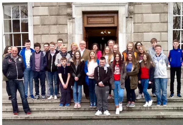
Visit to Dail Eireann

The Cathedral Youth Club is one of the key community projects in the Fountain Estate and has recently celebrated 40 years in existence. They play a key role in many of the Triax sub-groups representing the views and aspirations of the residents of the Fountain. Cathedral Youth Club works continuously to break down barriers and build relationships across the interface - a highlight of the past year has been visits to both Stormont and Dail Eireann.