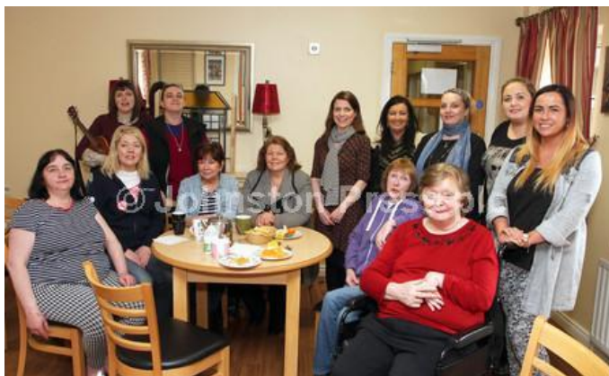
Coffee Morning/Support Group meeting at Dove House

During 2014/15 and following evaluation it was recognised that the Advocacy aspect of the project needed to be enhanced and built upon. The project worked with 125 women and 8 men. These individuals were supported and signposted to a range of agencies such as Women's Aid, ZEST, Divert, Rowan Centre, Pink Ladies, Northlands, ATU Gransha, Men's Action Network and the Rainbow Project. The project has been involved in a number of community-based campaigns and has recently trained 13 volunteers.