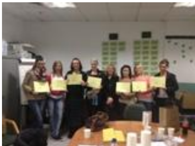
Trainees completing their “Marks & Start” training

The Triax NPB has had some engagement with Gingerbread but would welcome more involvement with Gingerbread NI through increased partnership working within the NRA to create more awareness to residents as to what support is available to assist in this organisation assisting to deliver on NAP priorities.