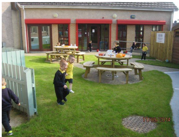
New outdoor play area and gardens

With this being the 25th year of providing childcare, learning and family support programmes to the community the group are particularly delighted to have been successful in securing a new outdoor play area and gardens funded by Cornerstone City Church, which has allowed the expansion of the environmental projects carried out by the children and adults and also provides a safe equipped play area for users of the centre.