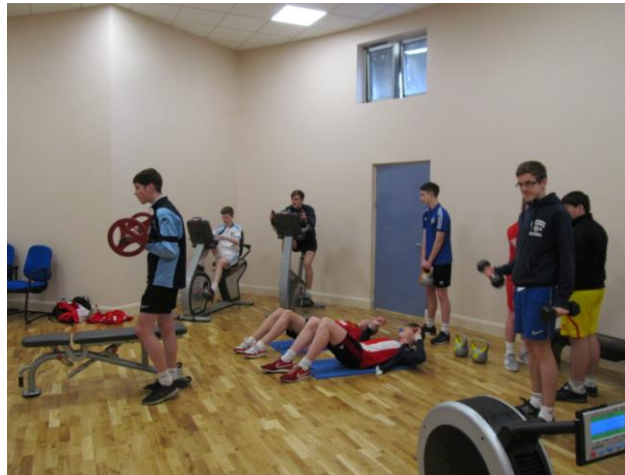
Teenage and Young Adult Physical Exercise Programme

The NHIP Project in the Triax area has been the catalyst for bringing the Triax Health Sub-group together and build collaborations and partnership working throughout the area. Alongside this, the NHIP project has funded numerous new and innovative programmes ranging from Talking to your Babies, Teenage and Young Adult Programmes, Mood Maters and Grow Your Own.