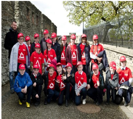
Local School Children participating in the Social Education Project

Project delivery is through local schools in the area providing an opportunity for children and young people to consider the impact of anti-social behaviour within their community. The Social Education Project works with the Triax Community Safety partners and has worked in numerous schools across the Triax area.