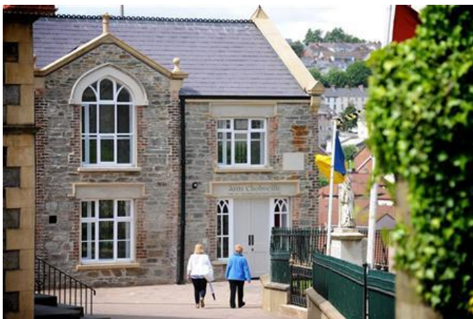
Saint Columba’s Heritage Centre

The Saint Columba’s Heritage Centre is located in the restored listed school building in the grounds of the Long Tower Church. The Saint Columba’s National School, known affectionately locally as the “Wee Nuns’ School”, dates from 1813 and after major restoration provides a centre to promote the heritage and history of Saint Columba, the city’s founding father.