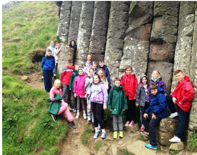
Cross Community Outing

Central to the work of TRIAX NPB is the regeneration of the Fountain Estate and this project is central to that aim. Without the Transport Links Project there would be a real danger to the very existence of the school and without the school there would be a real danger to the long term viability of the estate.