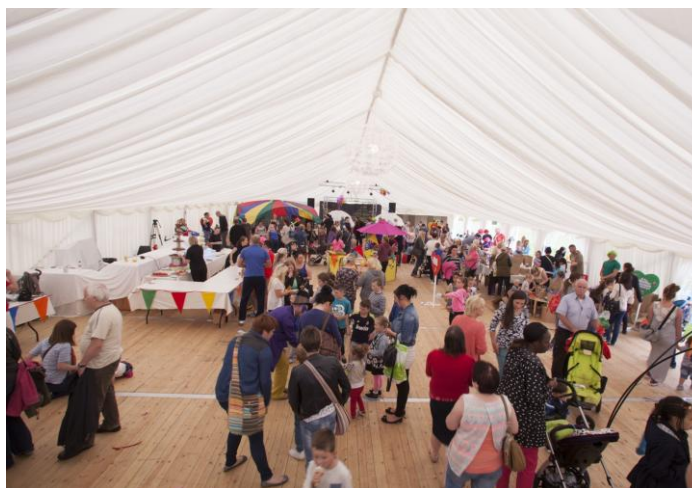
Community Event held in Community Marque

The Triax Community Engagement Project organised and facilitated over 60 programmes and events in 2014/15 and engaged 1000s of residents. The highlight events of 2014/15 were Welcome to the Bogside for the Walled City Marathon, Creative Creggan, Hall of Horrors and Freezin Christmas Pantomime and a number of family engagement events.