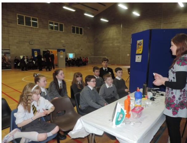
Youth attending a Health & Safety initiative

The YES Project coordinated and delivered a number of workshops to school children in the Triax area and has developed partnerships with all the local schools, CRJ, Triax NMT and a number of Statutory Agencies. 305 schoolchildren from the Triax Area took part in these workshops. Two youth projects also participated in the YES Midnight Soccer League.