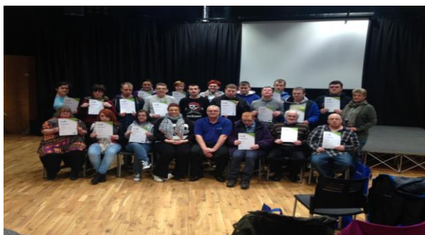
Presentation of Certificates