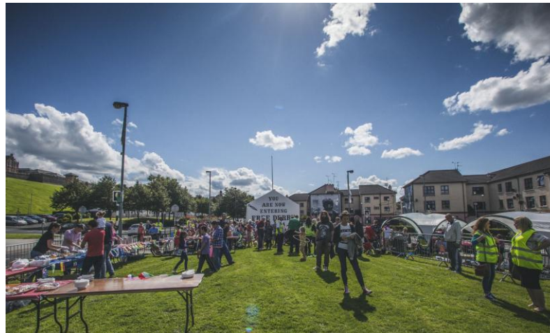
Big Bog Barbeque

The Volunteer Investment Project (VIP) promotes active citizenship through engagement with individuals living in the Triax ~ Cityside Neighbourhood Renewal Area. This year 8 volunteers accessed full time employment as a direct result of entering the VIP programme and gaining the necessary skills. 108 new volunteers were recruited who completed training and personal skills development. 42 volunteers were placed in various organisations to support their finance department, sales teams, childcare, reception duties, stewarding and construction. Without the VIP Project it would be difficult to run big participatory events like the Jog in the Bog, Big Bog Barbeque and numerous other community led events.