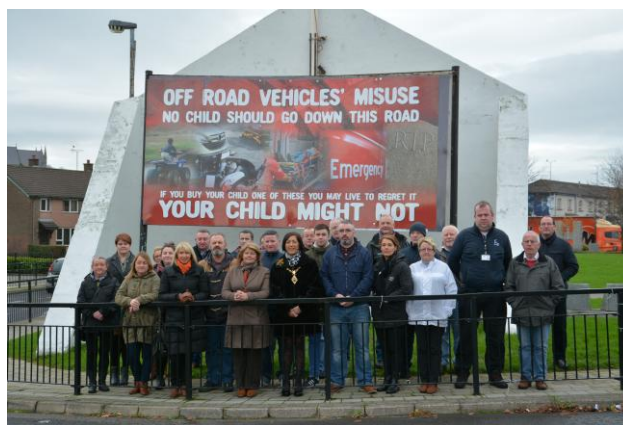
Launch of the “Off Road Vehicles Misuse” campaign

CRJI are the key community safety organisation in the Triax area and co-ordinate a lot of the community safety initiatives in this community. They chair both the Community Safety Team which meets fortnightly and the Community Safety Forum which meets quarterly. In 2014/15 they worked closely with residents and statutory providers on a range of issues including interface issues, Anti Community Activity at Derry City and alternatives to Bonfires. CRJI have provided Bogus Caller and child protection training for older and vulnerable residents and community workers. During the past year they have also been involved in over 300 Mediations across the city.