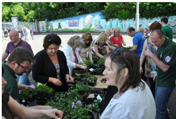
The Wan Big Garden Workshop

The TNMT focus continues to be the physical and social environmental needs of residents, which ensures people live in a safe, clean and welcoming environment. The TNMT was central to the delivery of a number of Community Safety Initiatives throughout the year including the Big Bog Barbecue. The Wan Big Garden saw a number of open air hanging basket workshops across the area. The project provided over 700 hanging basket to residents while providing opportunities for the TNMT to engage with residents on a range of issues.