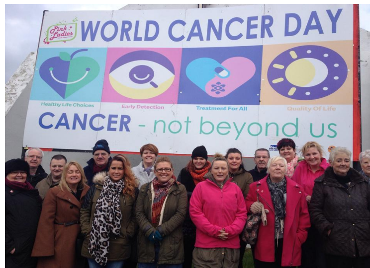
Launch of “World Cancer Day” Campaign

The Pink Ladies has been part of the community health infrastructure in the Triax area since their inception in 2005. They play a key role in the Triax Health Sub-group and work closely with many partners in this community. The Pink Ladies ran and collaborated in a number of campaigns and programmes across the Triax area over 2014/15 including World Cancer Day, Cancer Carers, Smoke Free Communities, Breast Cancer Awareness Month and Men’s Cancer Awareness.