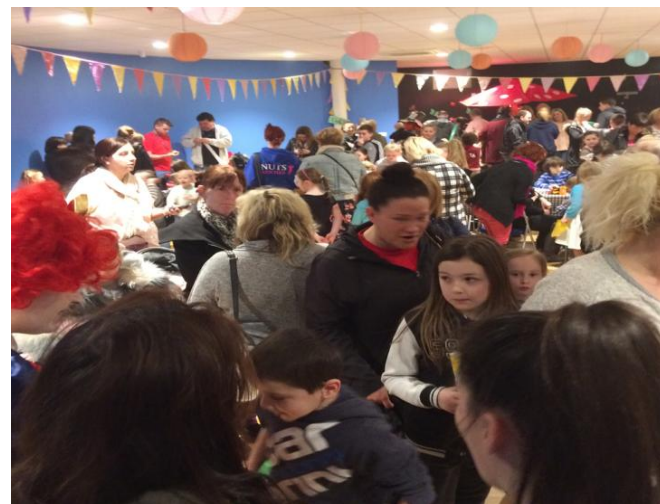
Service Delivery – Community Event