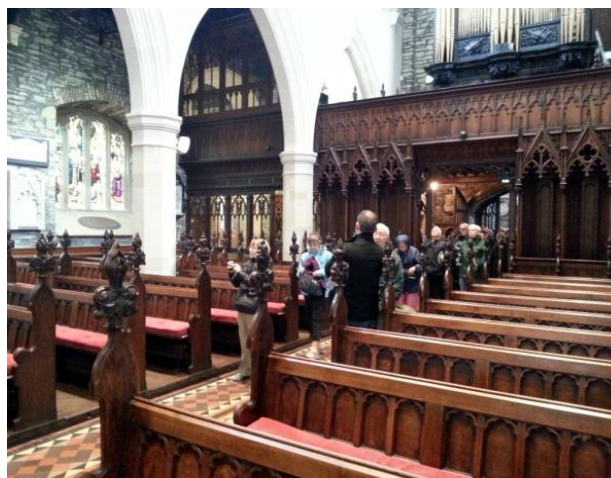
Tour of the Cathedral

This project provides a tourist guide service to promote St Columb's Cathedral as one of the most historic and cultural landmarks in the City which attracts local, regional and international visitors throughout the year and also offers a cultural and educational facility to schools. St Columb's Cathedral Tourist Guides Initiative employs one full time and two part time Tourist Guides. St Columb's Cathedral – Tourist Guides Initiative project provides a service to the local community and visitors to the City through the provision of informative tours on the educational, historical and cultural attributes of St Columb's Cathedral, one of the most historical buildings in the City.