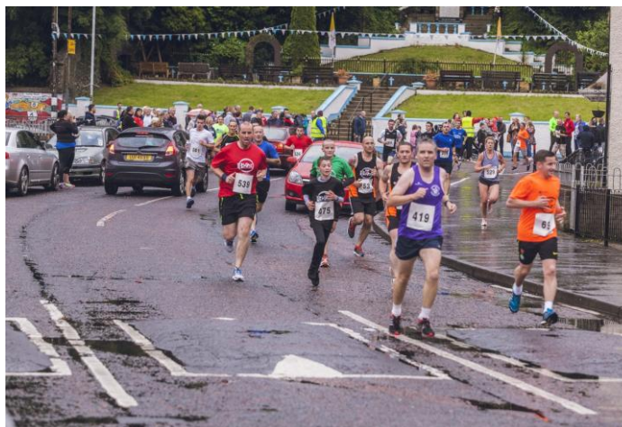
Walled City Marathon

Triax Health Sub-group working with Derry City Council, WHSCT and the PHA have developed a comprehensive Health Action Plan. The Active Citizenship Through Sport project has contributed to this Action Plan by supporting programmes aimed at young people, Men's Health and Older People. This is one of the best examples of Community Statutory Partnership working together to deliver services based on identified need.