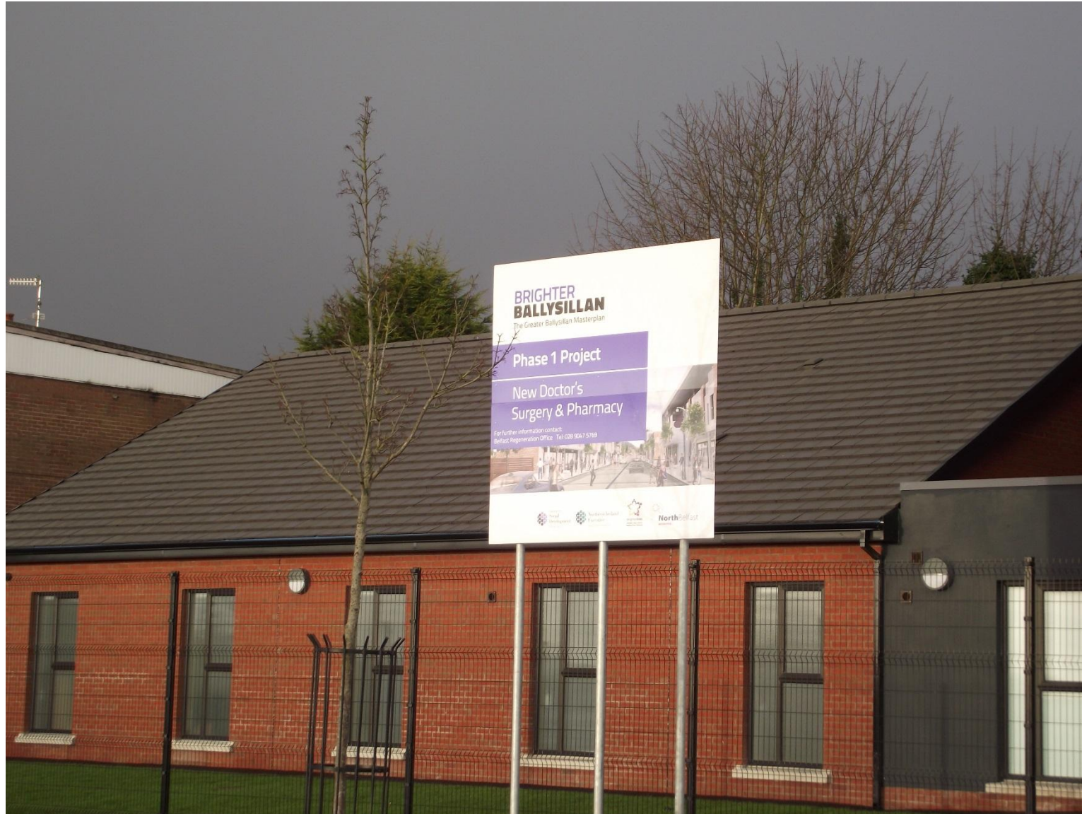
One the many examples of public realm works taking place in Ballysillan and Upper Ardoyne