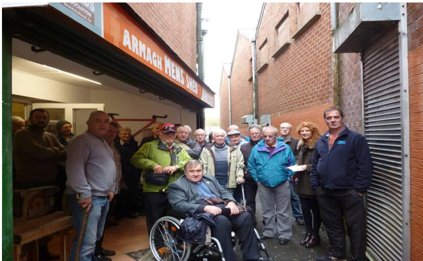
Irish Street & Top of the Hill Men's Shed visit to Armagh