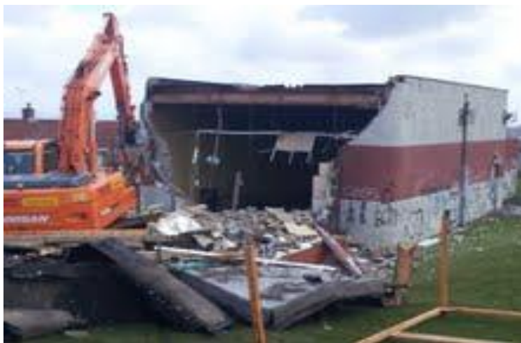
TOTH Community Centre demolition