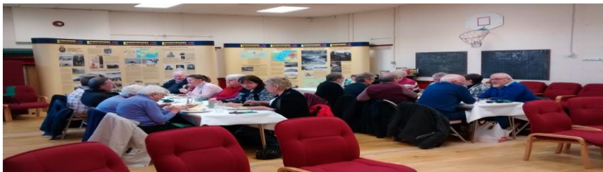
Irish Street Luncheon Club