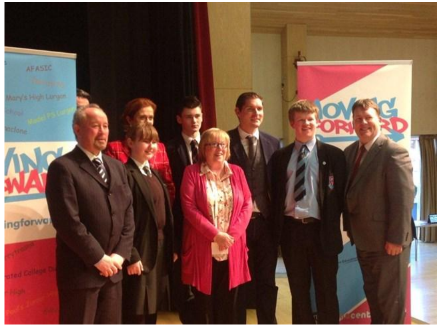
Craigavon – Transitions programme delivered by the Southern Education and Library Board Education Welfare Service. Picture includes participants from some of the schools involved in the creation of the Transitions App.

people make the transition, by attempting to allay any fears and concerns they have through the sharing of experiences and learning of others. It will also aim to assist in the improvement of attendance levels, levels of educational attainment and general engagement in school.