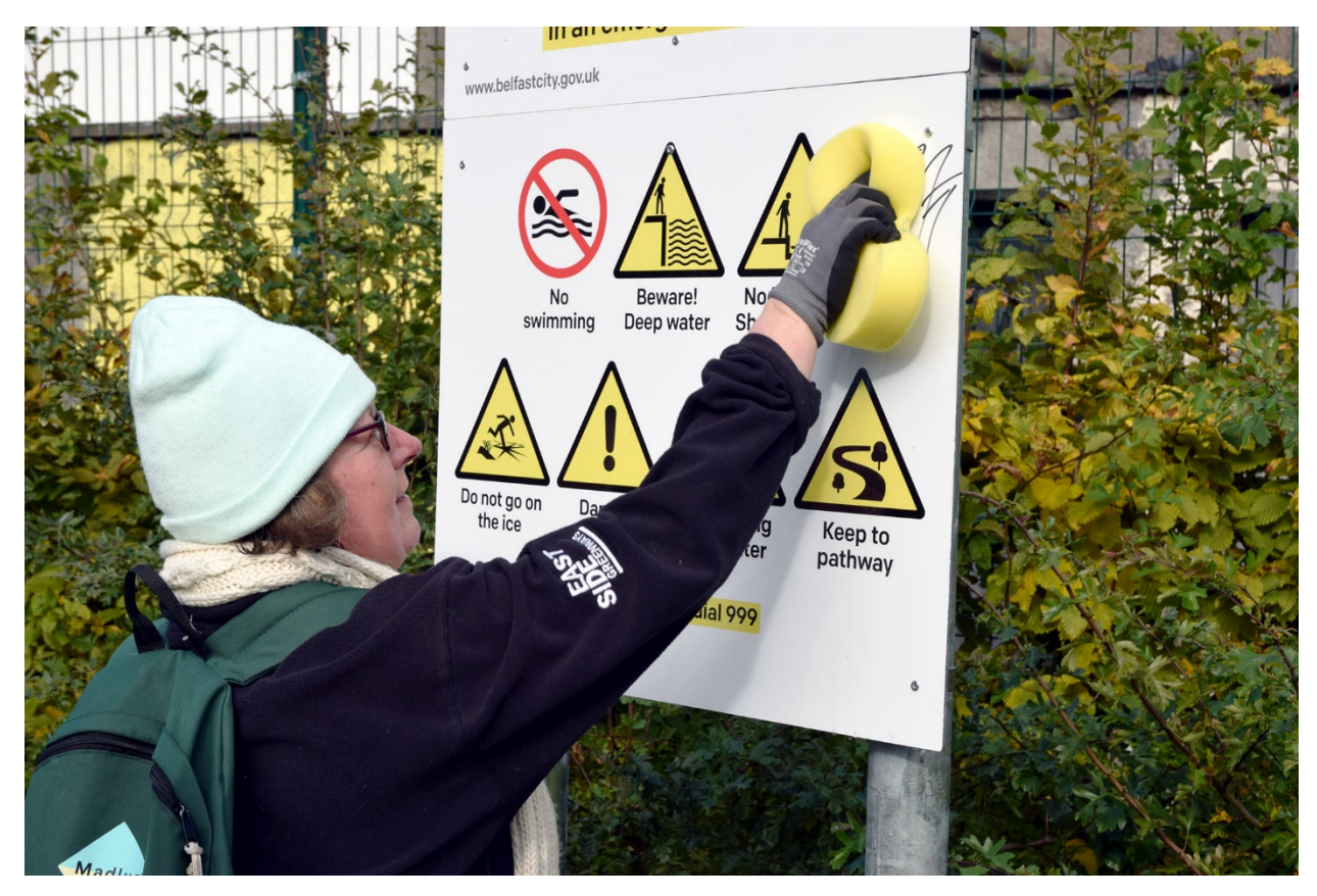
Volunteers out on the Greenway regularly helping keep it litter & graffiti free

The final action outlined within the Community Renewal theme relates to local delivery of the Belfast Community Safety Partnership Strategy. While considerable resources are being deployed in the area for community safety initiatives and community safety staff; communication is at times poor and not all communities within the NRA could articulate their issues. The NP plans to work more closely with Belfast City Council on this issue to ensure that activities supported are both well targeted and link effectively with other local projects and plans. The EastSide Greenway Manager also raises any issues of concern at the East Belfast District Policing and Community Safety Partnership.