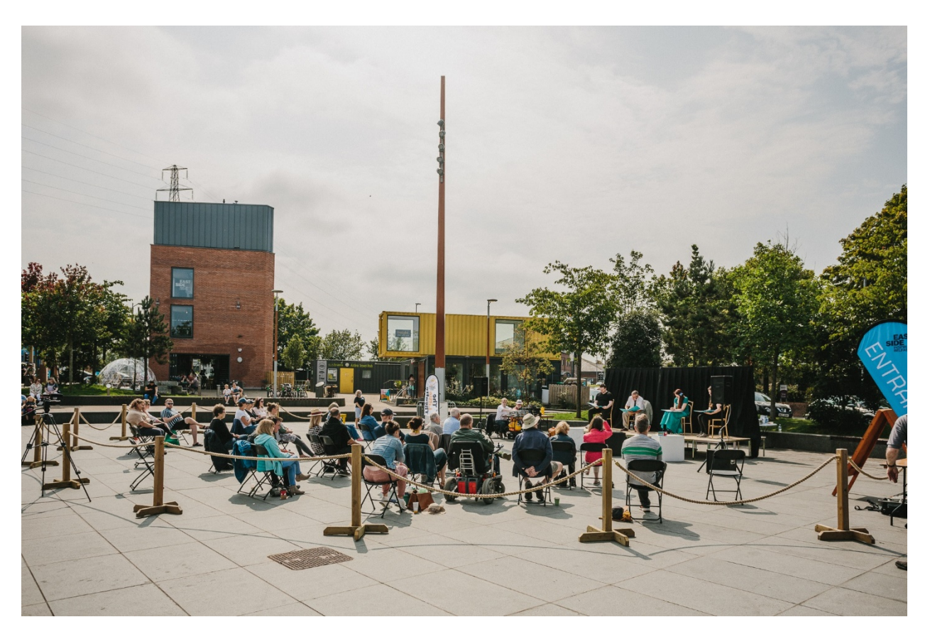
Late Lewis outdoor show in C.S. Lewis Square