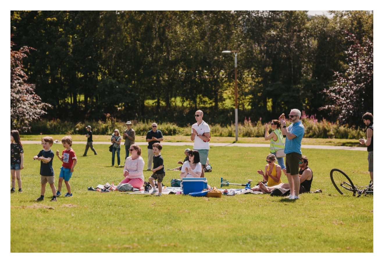
Samba in the park with BeatnDrum from the Eastside Arts Festival