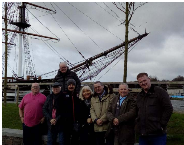
Women in History on the Famine ship at Dunbrody at Co. Wexford