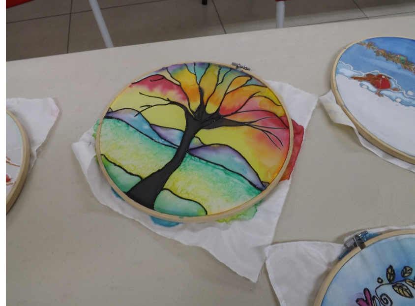
Campsie residents enjoy activities such as mindfulness and arts and crafts

The Campsie Garden project continues to go from strength to strength, with residents growing fruit, vegetables and flowers which are then distributed throughout the Campsie area. In 2019, the Hub successfully gained £800 funding from "Live Here Love Here" to purchase equipment and materials, which enabled the residents to deliver gardening workshops and grow a more diverse range of organic produce. A further £500 funding was received from Community Cash to purchase further equipment and training. The flowers grown in the garden are put in baskets and hung throughout the Campsie neighbourhood for the enjoyment of all residents.