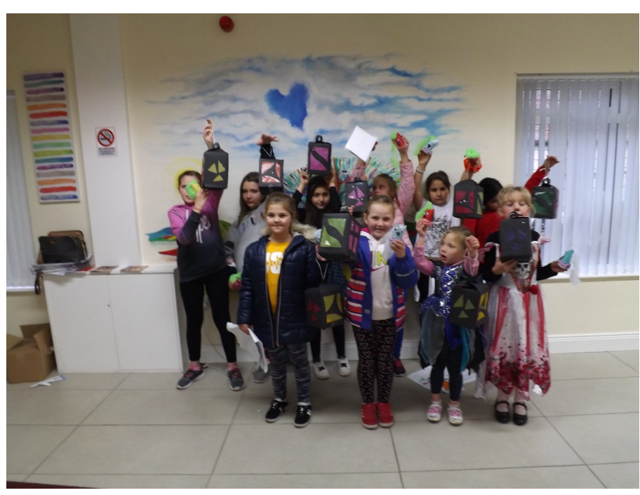
Campsie back to school programme