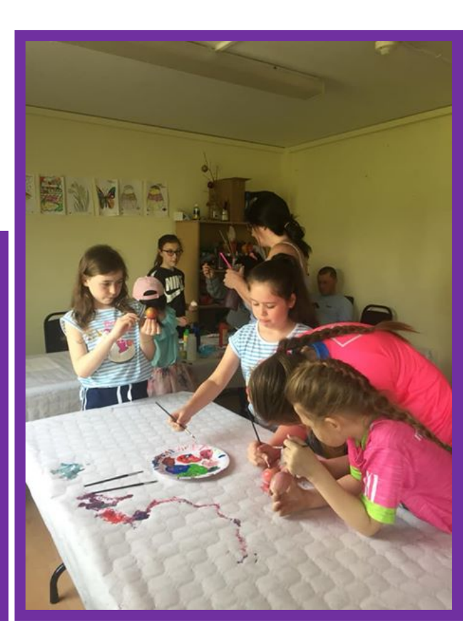
Kids enjoying an Easter programme in one of the Community Houses