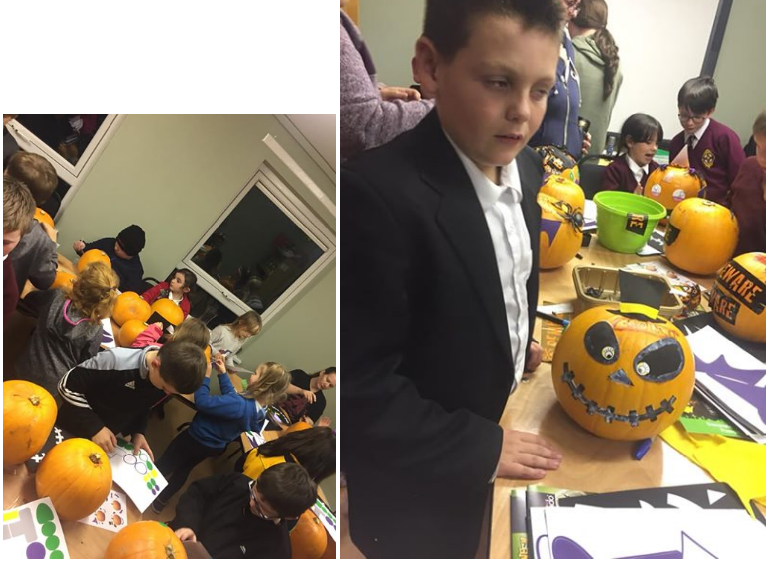
Pumpkin making at Halloween