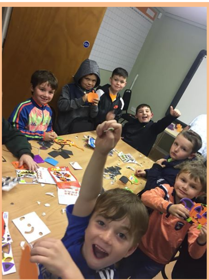
Arts and crafts proved popular with the kids