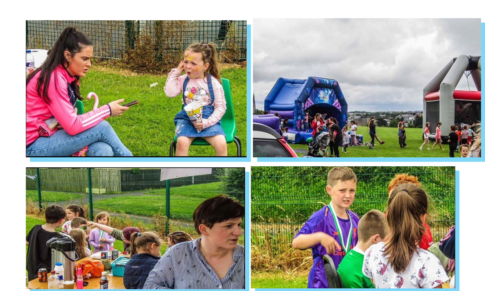
Family fun day in Mullacreevie