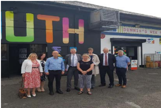
Key Stakeholders at Meenan Square