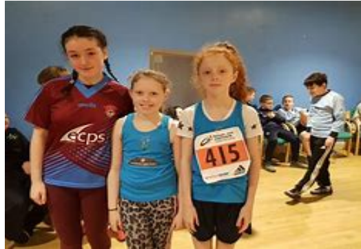
Jog in the Bog participants