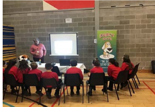
YES Project at Long Tower