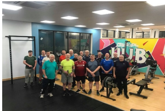
OLT Men's Health Group