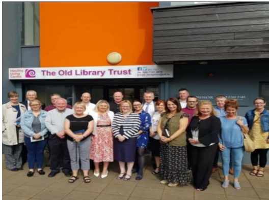
Head of Civil Service meets Creggan Community Forum

Triax is also heavily involved in the Urban Village Programme for the Fountain/Bogside area and the Communities in Transition Programme in the Creggan and Brandywell areas.