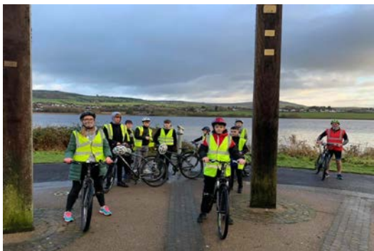
Youth Cycle out the line