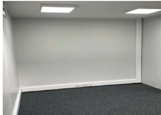
New facilities at OLT