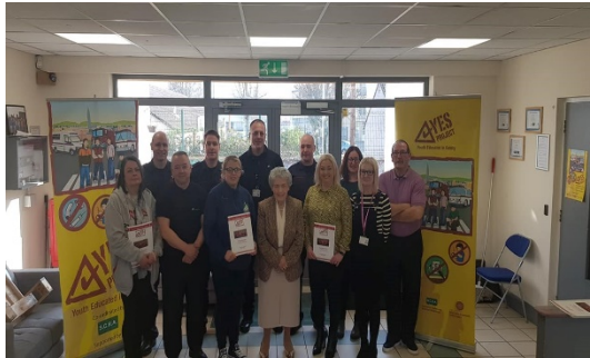
Community Safety Wardens with partners at YES Project