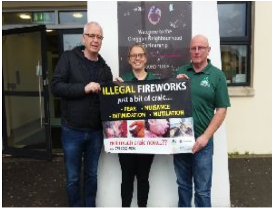
CRJI Campaign Launch