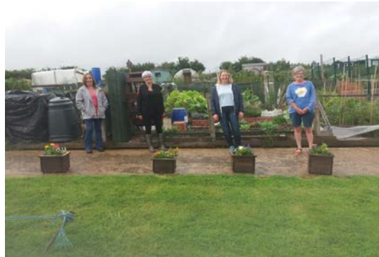
Growers at Ballymagowan