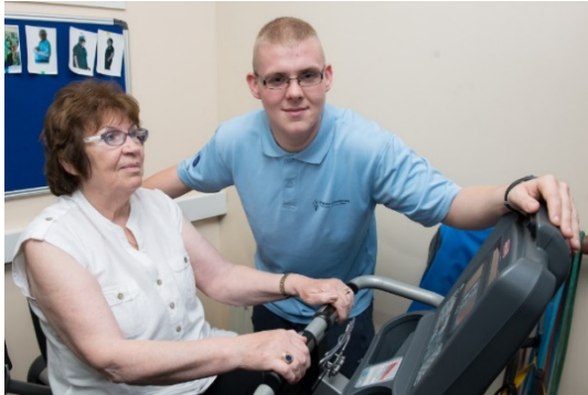
G.P. Exercise Referral Programme