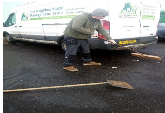
Community Clean Up