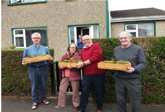
Residents get their Flower Boxes

and the Flippit Project are in the process of developing an Equine Therapy Centre at the Ballymagowan Urban Park.