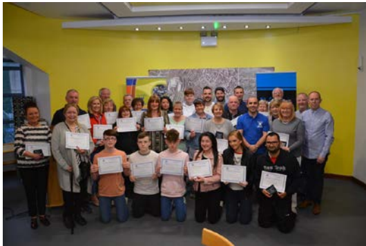
Volunteer Certificate Presentation