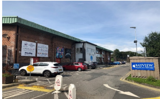
Completion of Medical Centre at Rath Mor