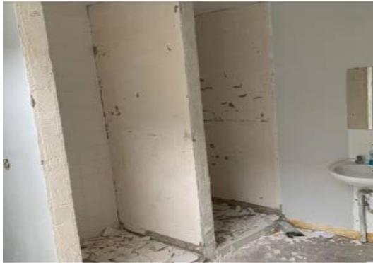
Before construction at OLT