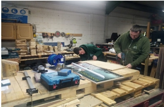
Staff working in workshop