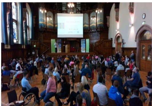
Conference facilitated by Youth Engagement Project