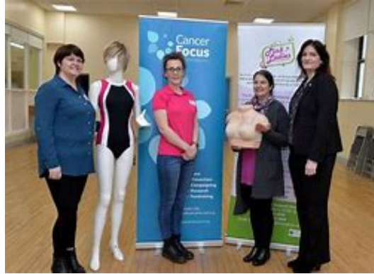
Pink Ladies at information session