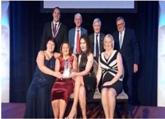
Pink Ladies receive award