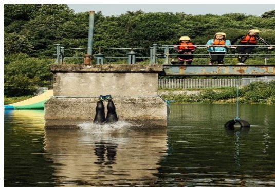
Young people getting ready for Pier Jump