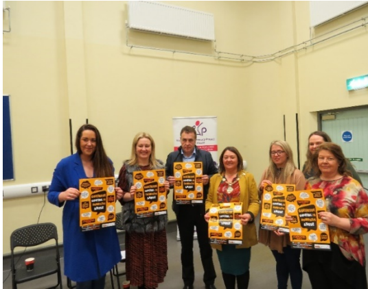
Local Councillors at Advocacy Campaign Launch