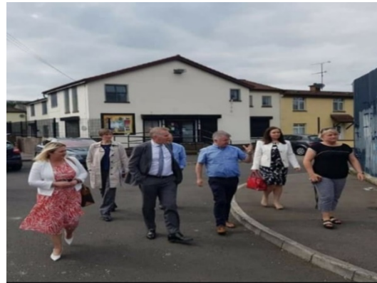
Head of Civil Service at Meenan Square