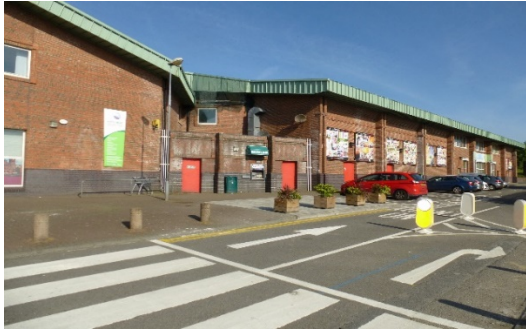
Before construction at Rath Mor