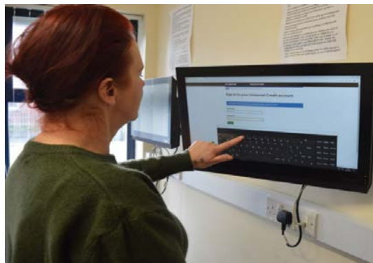
Staff demonstrating online benefits portal