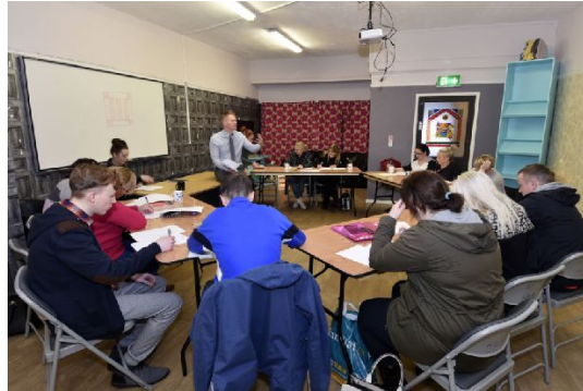
Community Education Class at Dove House