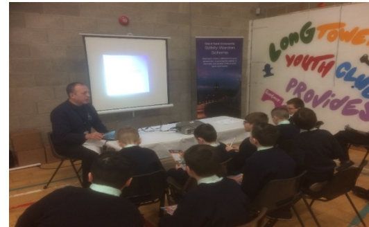
Community Safety Warden engaging with pupils at Long Tower YC