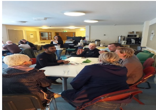
Small Worlds Event