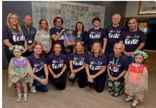
Volunteers at Feile Launch