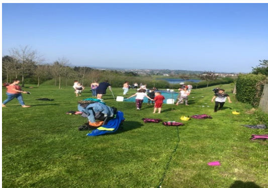
Family fun day at Creggan Country Park