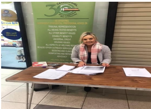
Staff at Advice Information Session