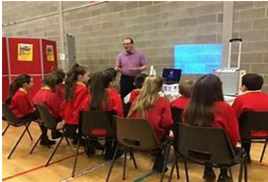
CRJI at YES Project