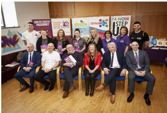
OLT Management and Staff