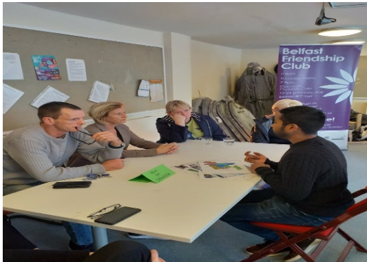
Workshop at CPTT