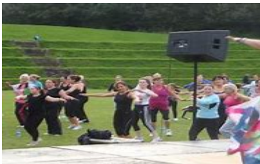
Zumba at Gasyard