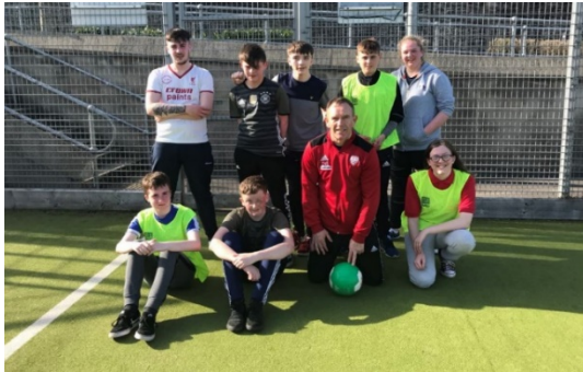
Young People at MUGA in Fountain