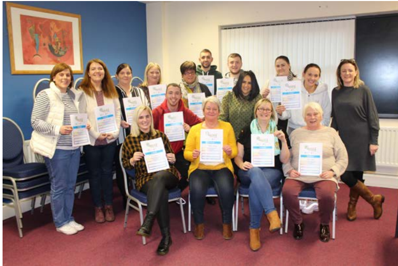
Good Morning North Belfast Mental health first aid course participants