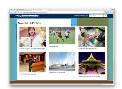
An Seomra Nuachta

An tÁisaonad works in collaboration with Irish-medium schools and with staff in St. Mary's University College and other institutions, to combine an approach of both experience and research to the application of resourcing schools. An tÁisaonad has produced pioneering Irish-medium resources such as reading schemes for