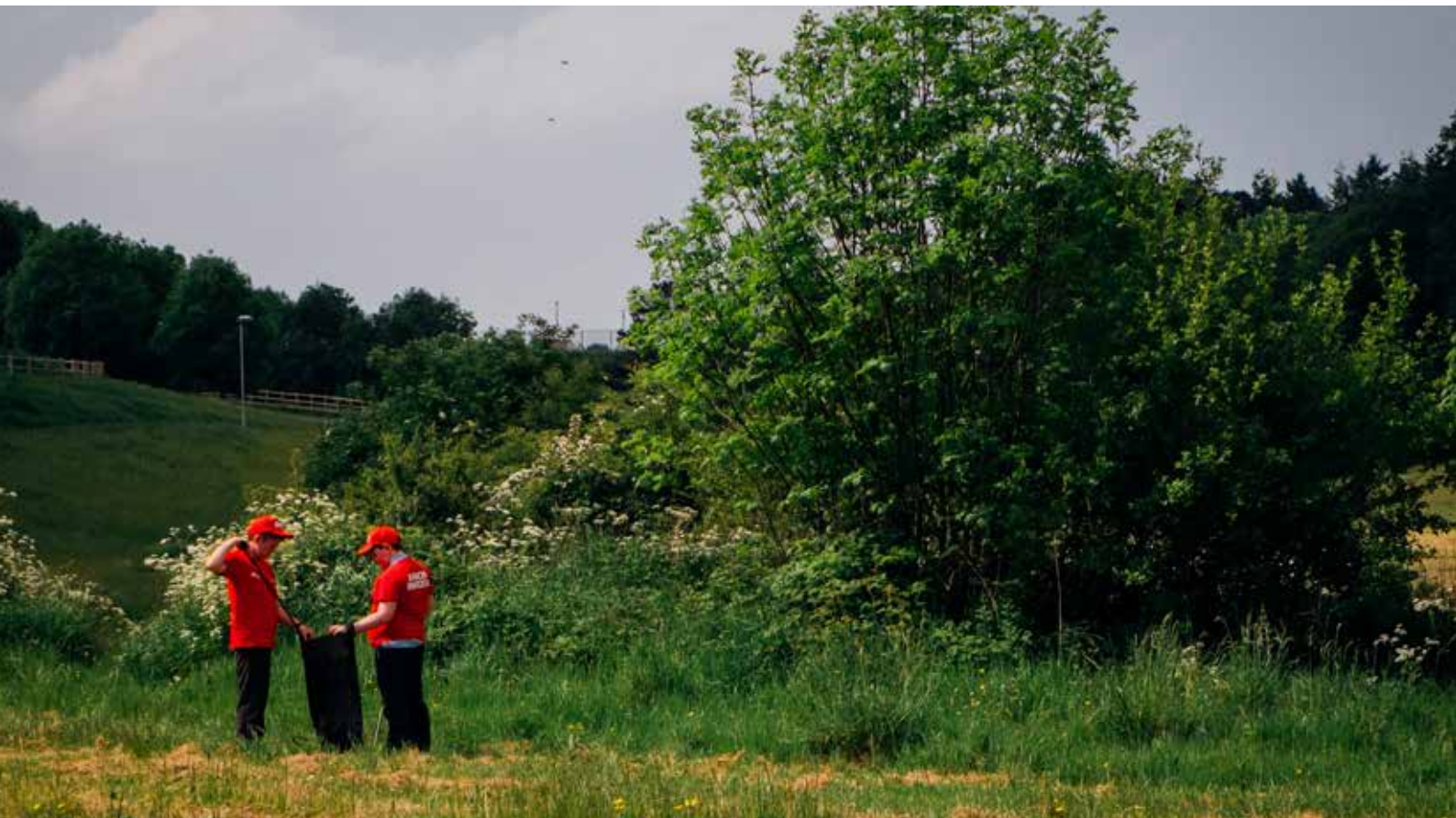
Junior Wardens in the North West helping to keep the countryside tidy.