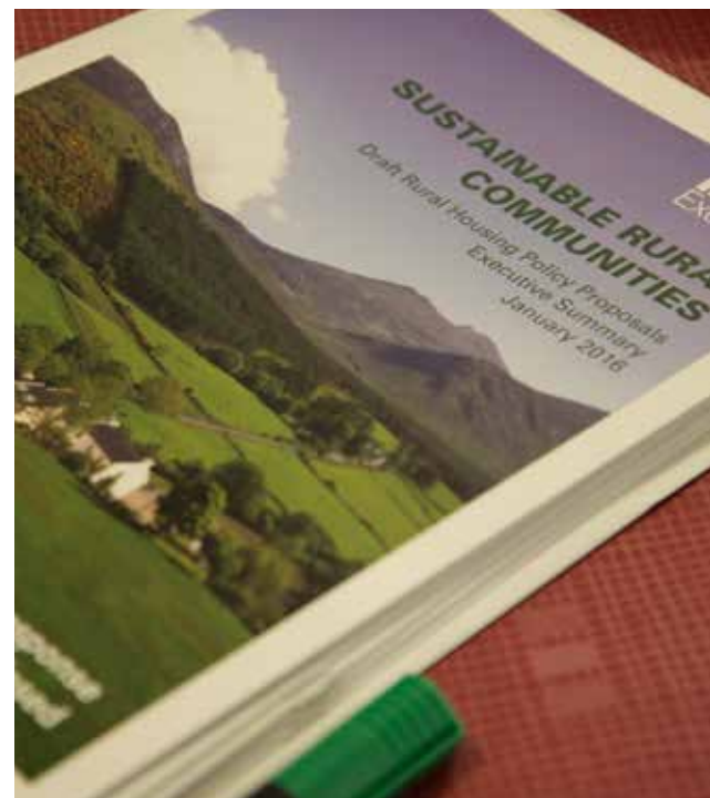
Draft Strategy document