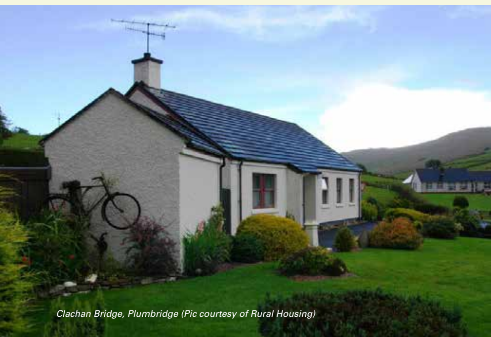
Clachan Bridge, Plumbridge