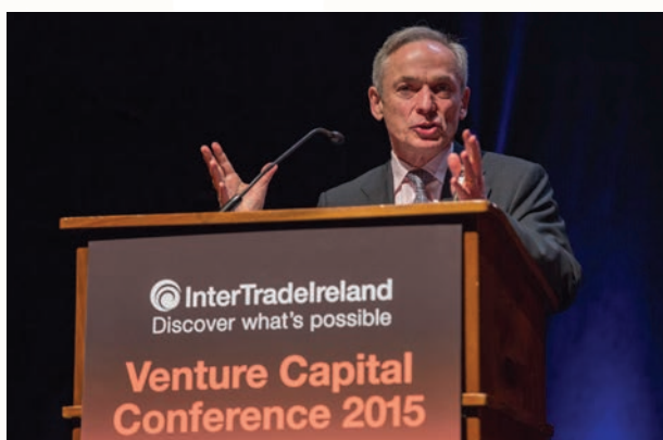
Minister Richard Bruton TD speaking at this year's Venture Capital Conference in Dublin

Dublin attended by several hundred delegates. In 2015, 12 workshops and 20 advisory clinics were held at various venues across the island. A total of 761 SMEs attended the events during the year.