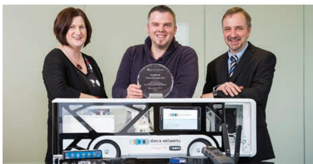
Dublin based Davra Networks receiving FUSION Exemplar Award

Each year a number of projects are selected as 'FUSION Exemplars' to showcase the achievements of the projects and benefits to the companies, academic institutions and graduates involved. For 2015 the exemplar projects were carried out by ABC Nutrition (Clare) with Ulster University, CDEnviro (Tyrone) with Trinity College Dublin, Davra Networks (Dublin) with Southern Regional College, Gallagher's Bakery (Donegal) with CAFRE and Malone Farm Machinery (Mayo) with South West Regional College. During 2015 the FUSION team visited over 160 companies and InterTradelreland has approved 68 projects for support. A total of 58 projects have commenced this year, with each creating a valuable graduate job. In 2015 companies that had previously completed FUSION projects reported a business value of £27m/€33m and a jobs impact of 352.