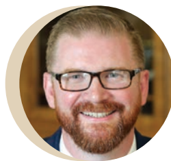
Simon Hamilton MLA MINISTER FOR THE ECONOMY