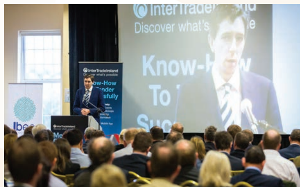
Minister Simon Harris TD speaking at Dublin Meet the Buyer event

the LEOs to increase SME participation through introducing a 'Lite' version of the programme. Four half day workshops have been delivered.