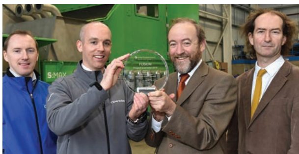
Tyrone based CDEnviro receiving FUSION Exemplar Award

Each year a number of projects are selected as 'FUSION Exemplars' to showcase the achievements of the projects and benefits to the companies, academic institutions and graduates involved. For 2015 the exemplar projects were carried out by ABC Nutrition (Clare) with Ulster University, CDEnviro (Tyrone) with Trinity College Dublin, Davra Networks (Dublin) with Southern Regional College, Gallagher's Bakery (Donegal) with CAFRE and Malone Farm Machinery (Mayo) with South West Regional College. During 2015 the FUSION team visited over 160 companies and InterTradelreland has approved 68 projects for support. A total of 58 projects have commenced this year, with each creating a valuable graduate job. In 2015 companies that had previously completed FUSION projects reported a business value of £27m/€33m and a jobs impact of 352.