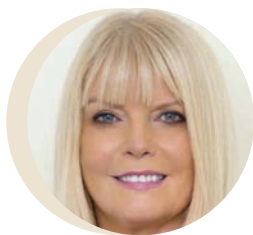
Mary Mitchell O'Connor TD MINISTER FOR JOBS, ENTERPRISE AND INNOVATION