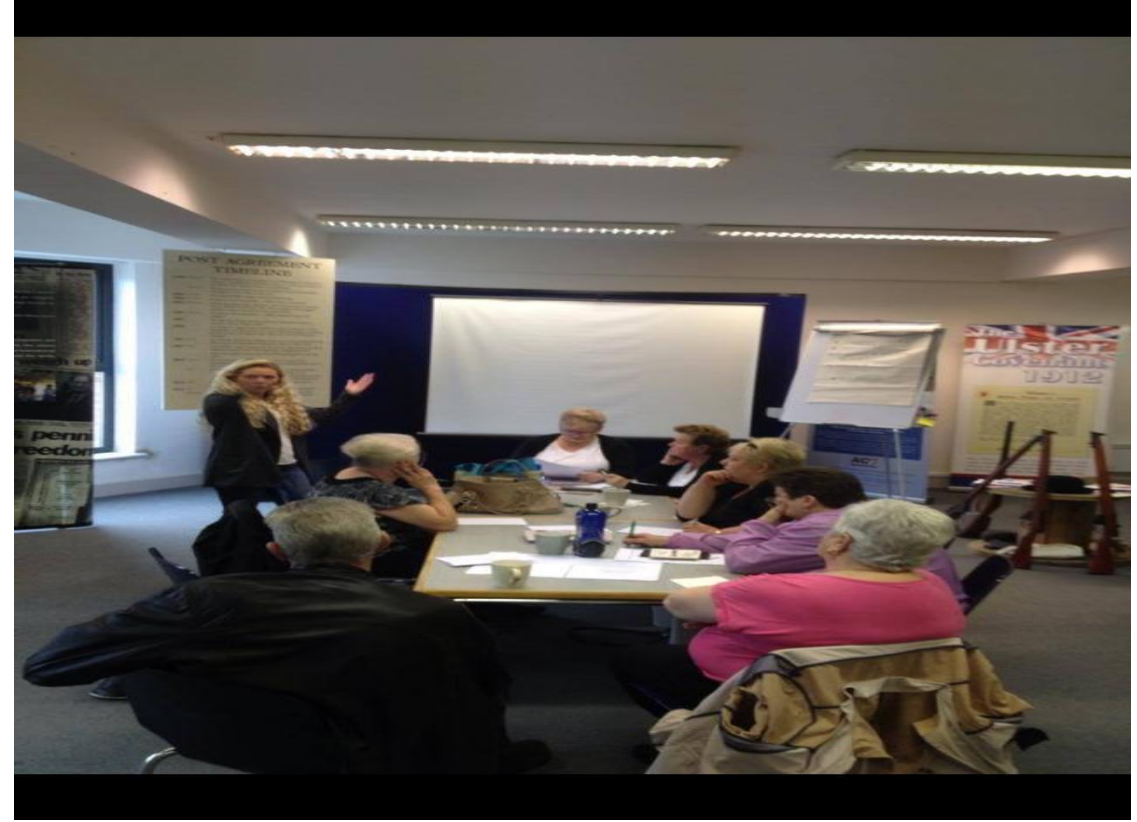
Picture of Loughview Community Action Partnership members participating in Lobbying workshop

An example of a programme that was facilitated by LCAP was a lobbying course for older people which consisted of a series of workshops generic to lobbying and ended with a practice visit to the Assembly.