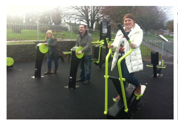
Gym Equipment at the 'Round O'