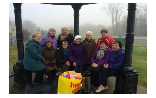
Devenish Health Project Walking Group