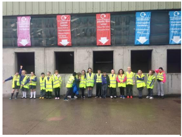
Enhancing the homework experience through opportunities including nature walks and a visit to the recycling depot.