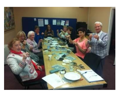
West End Communities Centre Arts & Crafts Classes