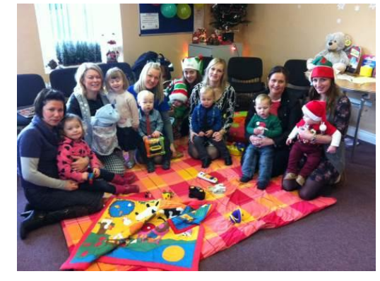
Parent and toddler group at the West End Communities Centre