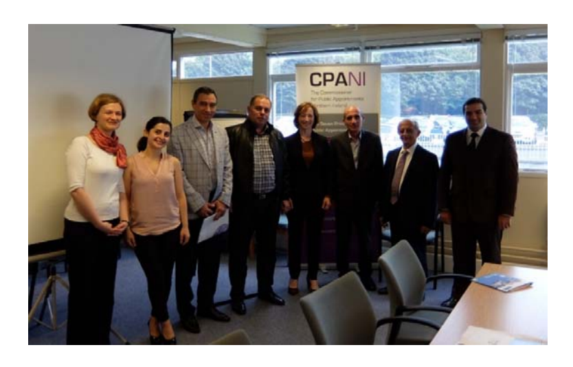
Pictured left: The Commissioner met with a delegation from the Armenian National Assembly.

The Commissioner has continued the CPANI outreach programme engaging with a wide range of organisations and individuals interested in public appointments. This outreach is intended to target currently under-represented groups, as well as people from a wider business, industry and third sector background, to inform them of the opportunities available across the boards of public bodies. This is