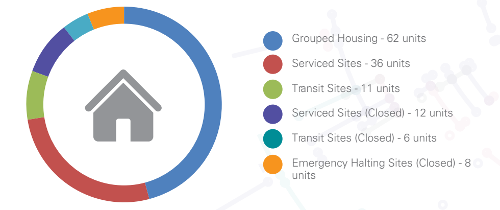
Figure 3: Traveller-specific accommodation provided by housing bodies in Northern Ireland (2020)

No reliable statistics are currently available on the number of Traveller families residing in settled social or private housing; however, research would indicate that around 87% of Irish Traveller households in Northern Ireland live in this type of accommodation.