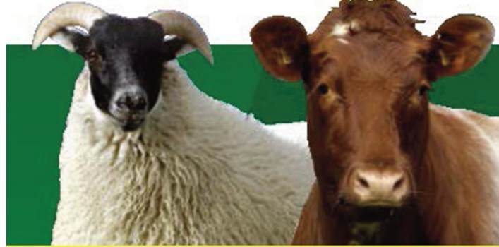
Dates and registrations of courses are listed online SIMPLY - Click ENROL and complete register