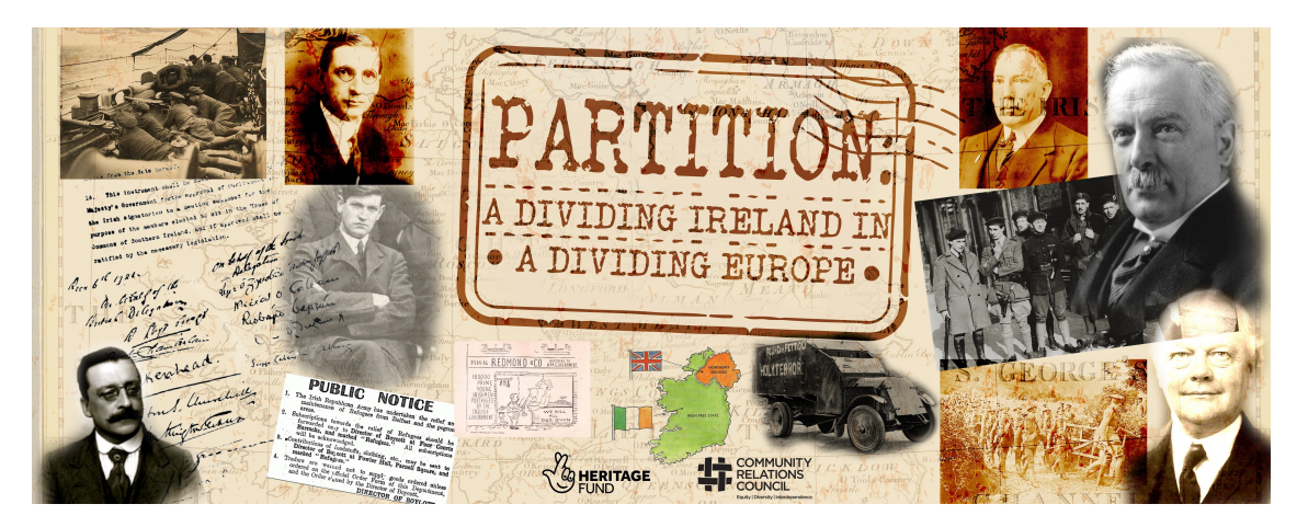
PARTITION: A Dividing Ireland in a Dividing Europe 21st November, The Glenavon Hotel, Cookstown

A one conference to facilitate community based organisations explore and discuss the upcoming centenary of Partition.