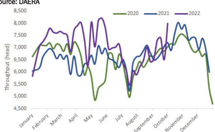
Figure 1: Weekly prime cattle throughput January 2020 to September 2022

2021. Mature bull throughput totalled 4,709 head to week ending 01 October 2022, which was up 754 head or 19 per cent from 2021 levels. Both calf and mature bull processings remain at very low levels in comparison to the number of prime cattle and cows processed