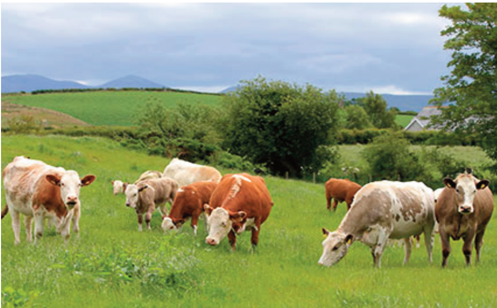
Image 1: The agri-food industry in NI will continue to look ahead and plan the significant measures and support that will be needed to help the sector reach the target of UK Net Zero by 2050.

"The implementation of this initiative has seen a sea change in the way that many farmers view greenhouse gas emissions and the issue of climate change. But, in many ways, it is still a work in progress and continues to offer production agriculture with viable solutions, when it comes to securing the future sustainability of the industry as a whole." The GHGIP action plan for the period 2016 to 2020 contained five core activity areas: