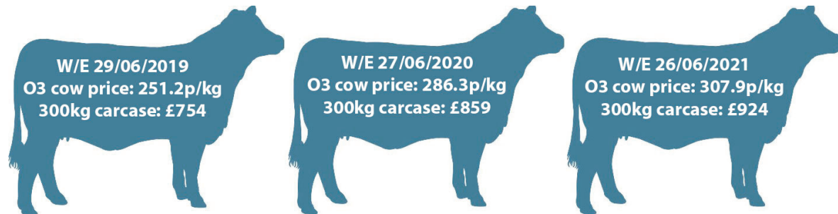
Figure 1: O3 cow price in NI during the week ending 26 June 2021 and the relative weeks in 2020 and 2019.

Cow exports from NI for direct slaughter totalled just over 600 head during the last 12 weeks with 94 per cent being exported to ROI and the remaining six per cent making the journey to GB. This is an increase of 195 head from 2020 levels and decrease of 179 cows from the same period in 2019.