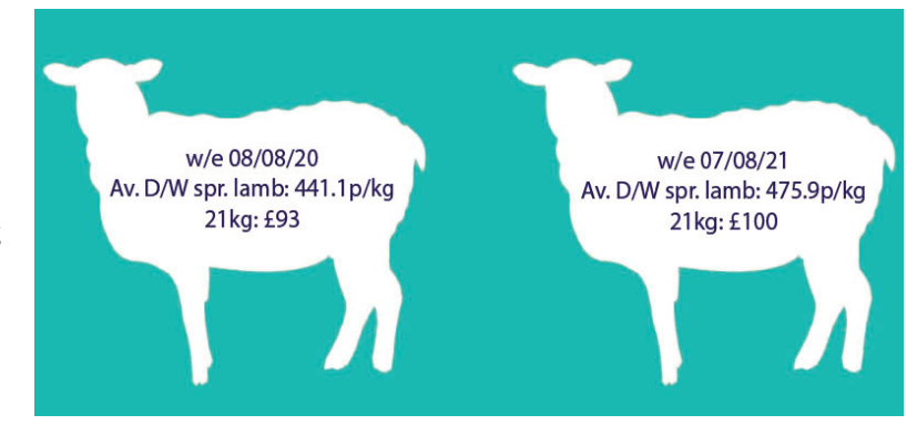
Figure 2. Deadweight lamb price in NI during the week ending 07 August and the corresponding period last year.

region last week. This was a decrease of 2,866 head from the previous week when 7,801 lambs made the journey to ROI processing plants. This brings lamb exports from NI to ROI for direct slaughter during the last six weeks to 34,034 head which have accounted for 36 per cent of total lamb output from the NI sheep flock.