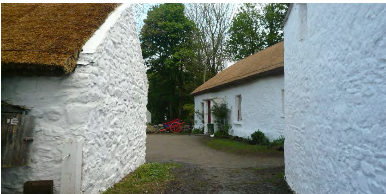
Vernacular grouping, Thomas Mellon Homestead, Omagh

8.10 It could be argued that no Statement of Significance can ever be complete or totally objective. However, it must try to express the heritage interests identified fairly and not be influenced by consideration of any changes being proposed. Different people and communities may attach different weight to the same heritage interests of a heritage asset at the same time. Judgements about heritage interests, especially those relating to the recent past, tend to be influenced by current perspectives, which will likely evolve over time. Therefore, it is important to acknowledge that Statements of Significance can change with time as new evidence emerges, or perceptions of the historic context of the heritage asset change.