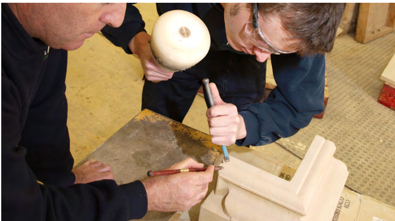
Stonemasons at work