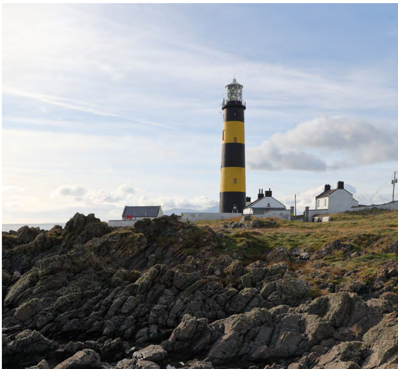
St John's Lighthouse Killough

The principles are not predicated for use only on designated assets. The significance of heritage assets vary greatly. When they have been assessed as meeting the criteria threshold for designation 1 they become formally protected for the public interest; however, the principles apply to both designated and non-designated assets.