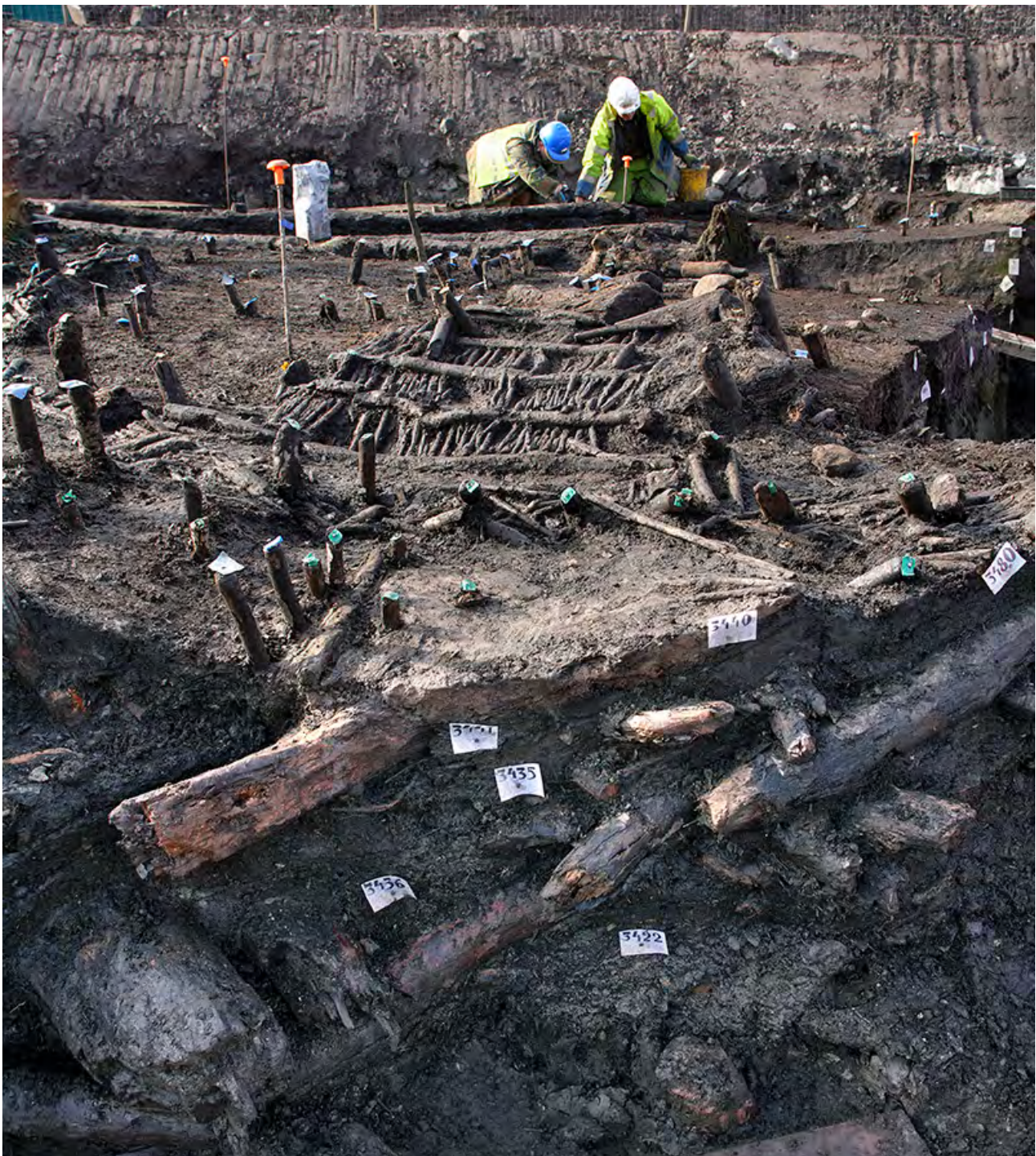
Excavation at early Christian crannog, Drumclay

The above headings are not exhaustive, and are provided as guidance in the assessment of ‘significance’. Many of the named heritage interests will apply to the assessment of the significance of statutorily protected heritage assets. Criteria for their designation is however derived from legislation.