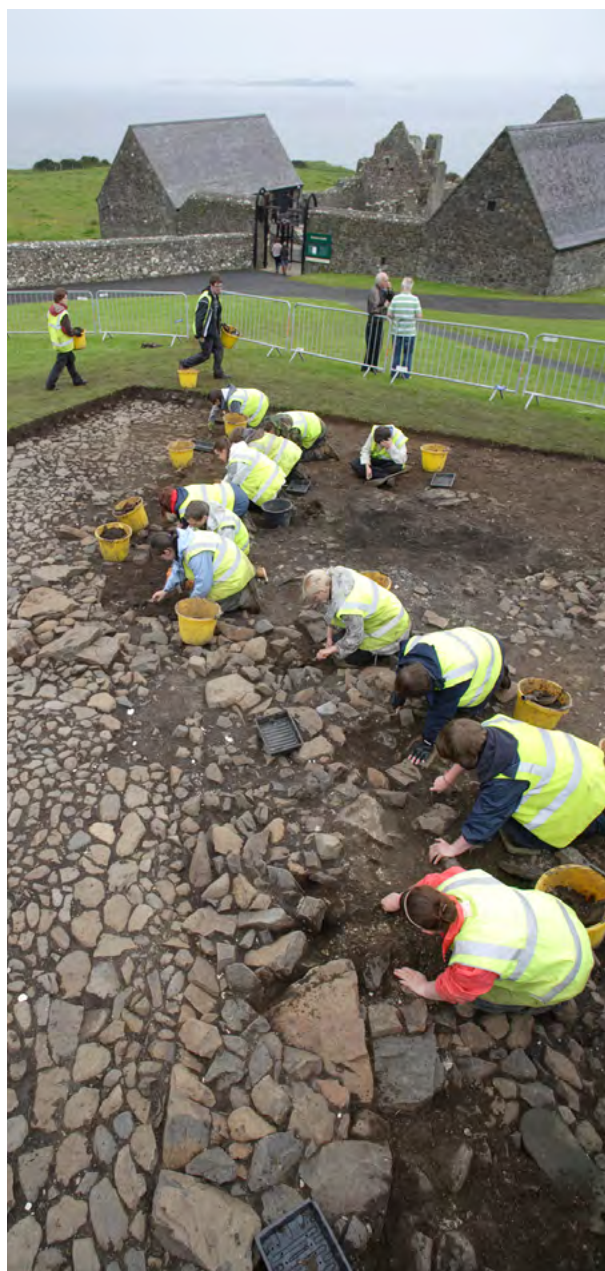
Excavation project at Dunluce

‘We have a responsibility to present and future generations to protect and enhance our environment and to conserve the rich diversity that our natural and built heritage possesses.’