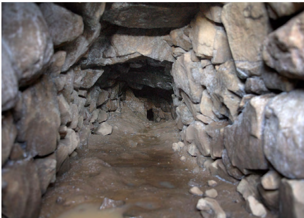
Excavation of part of the souterrain at Bushmills distillery (Clogher Anderson ANT 007-021)

These are explained in more detail within the 'Understanding Significance' section later.