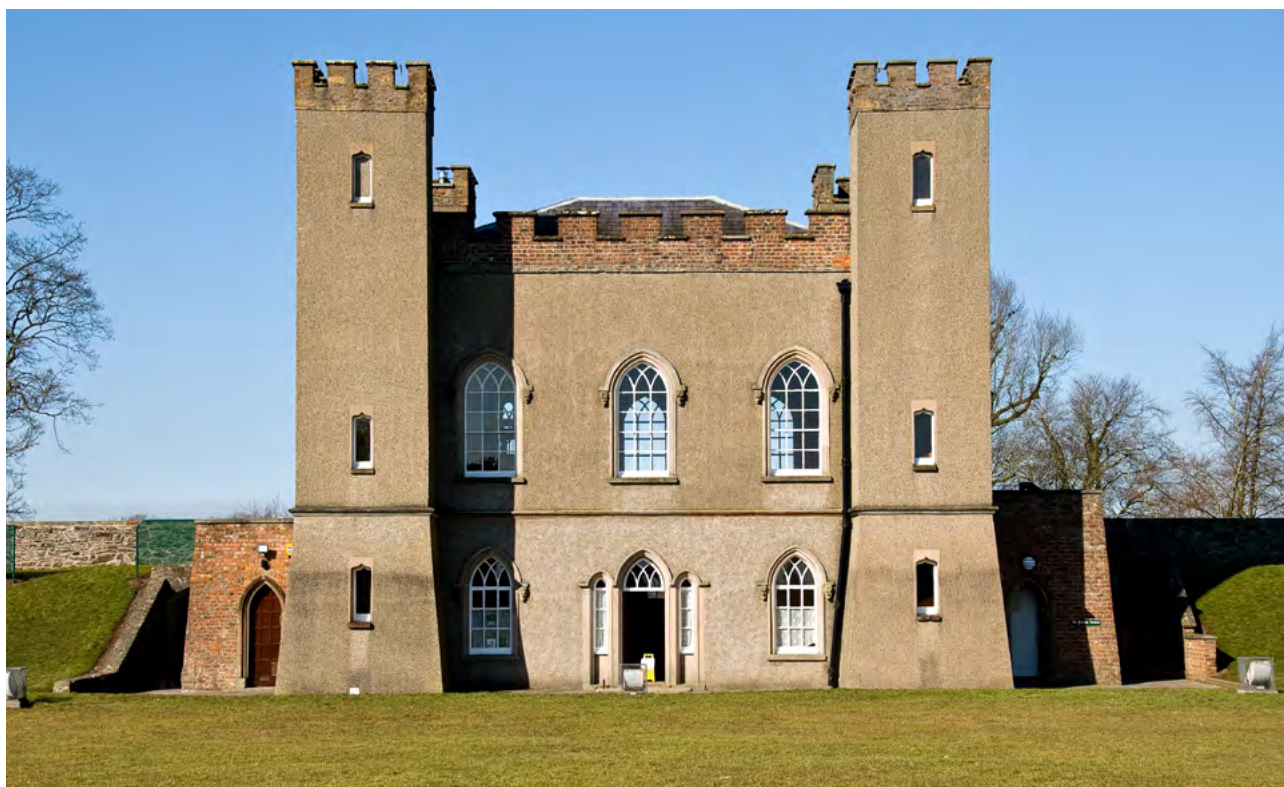
17th Century artillery fort, Hillsborough